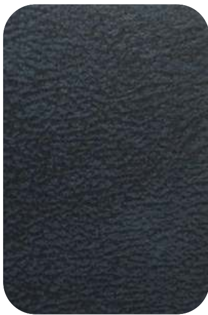
ANCONA - 914