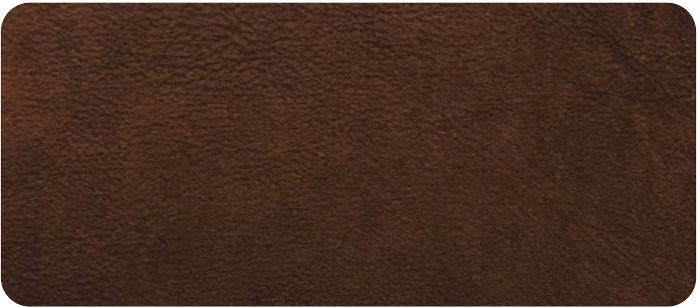
ANCONA - 906