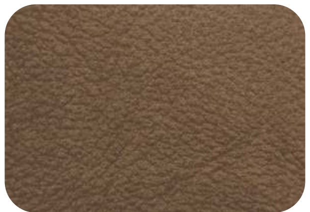
ANCONA - 905