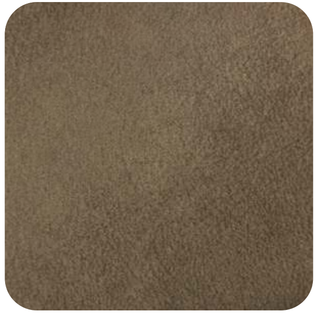
ANCONA - 903