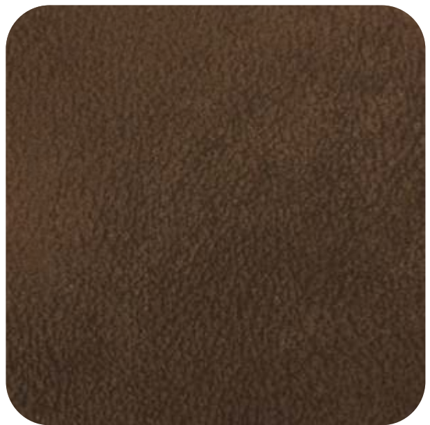
ANCONA - 907