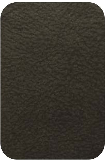
ANCONA - 915