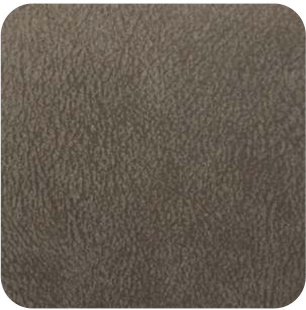
ANCONA - 918