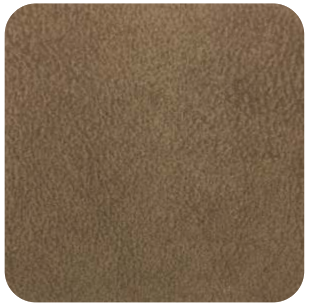
ANCONA - 904