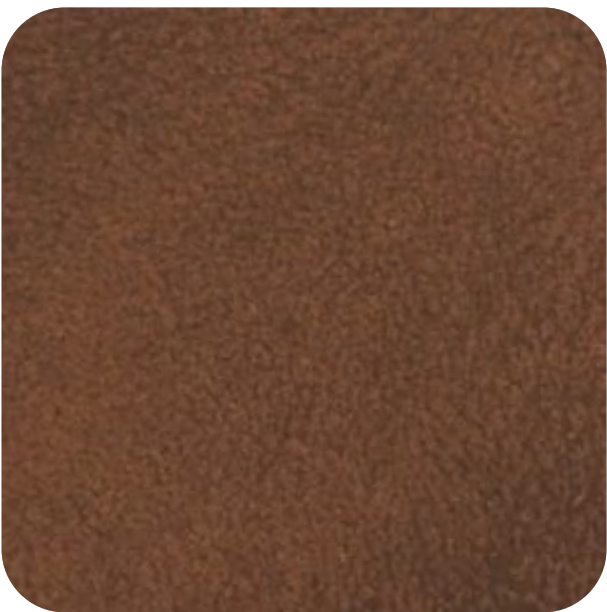
ANCONA - 910