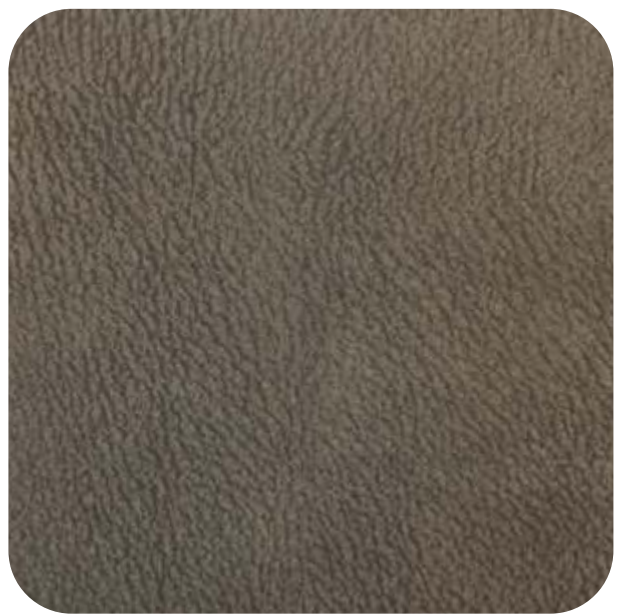
ANCONA - 916