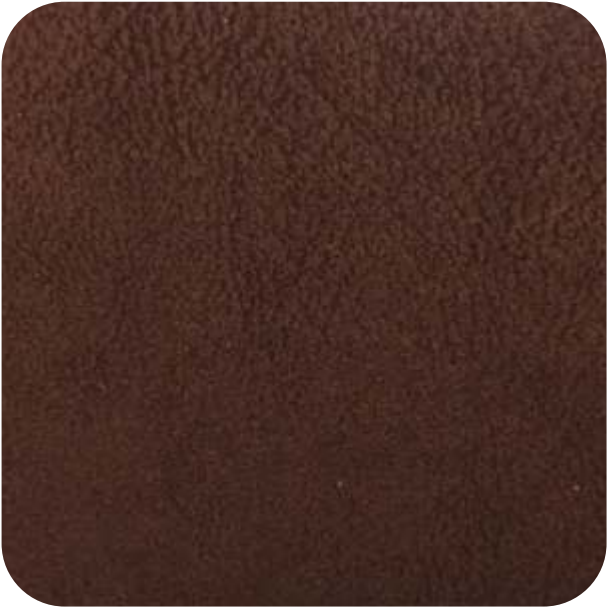
ANCONA - 911