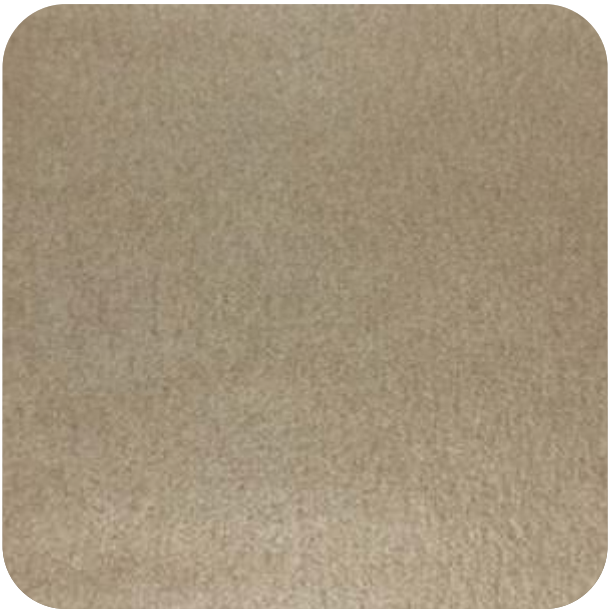
ANCONA - 901