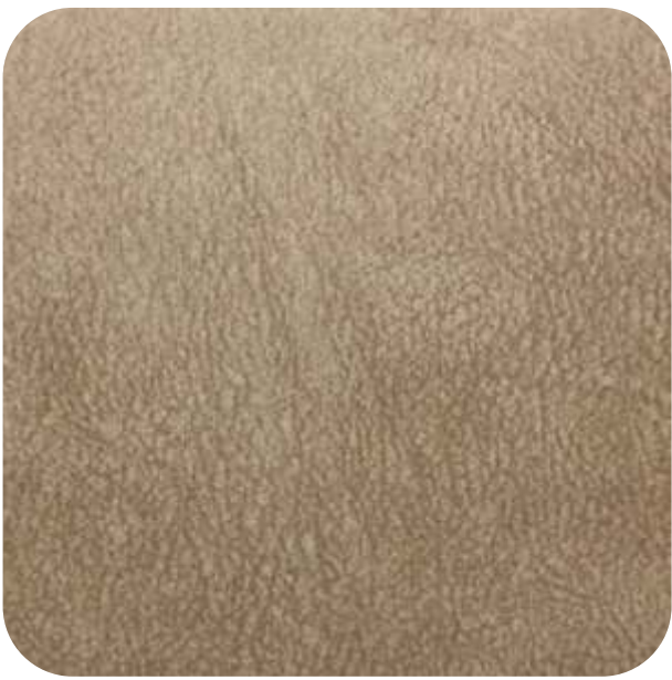
ANCONA - 902