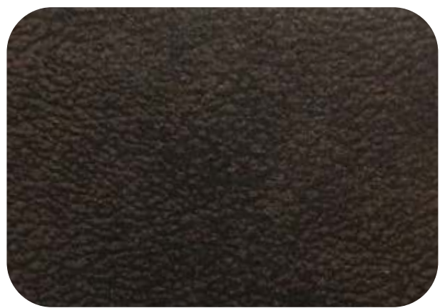
ANCONA - 909