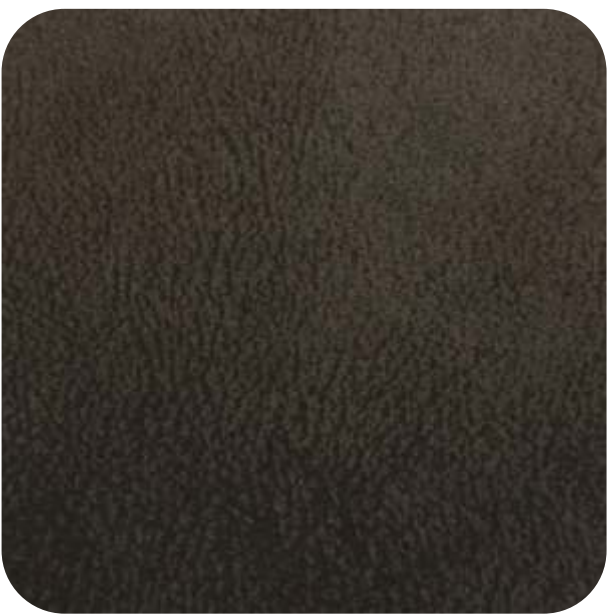
ANCONA - 919