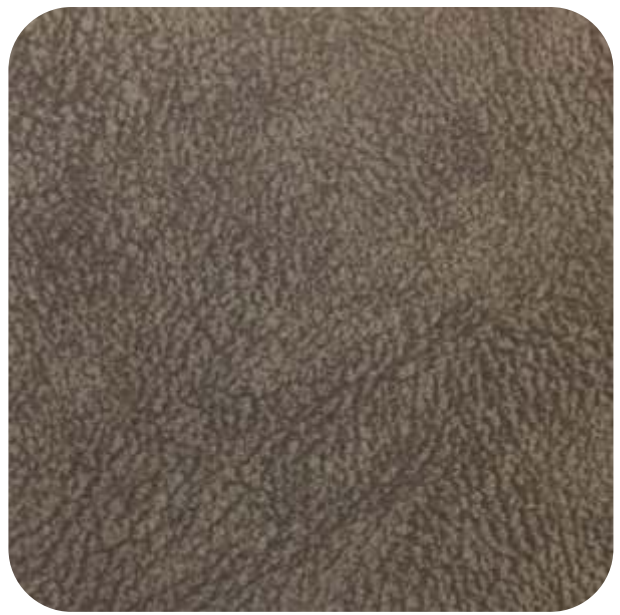
ANCONA - 917