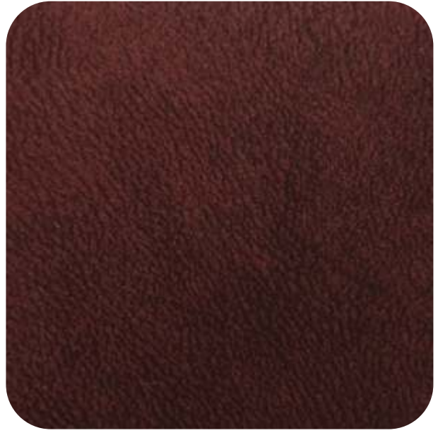
ANCONA - 912