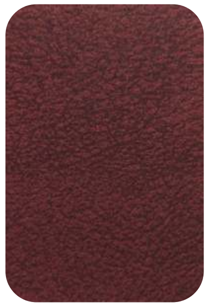
ANCONA - 913