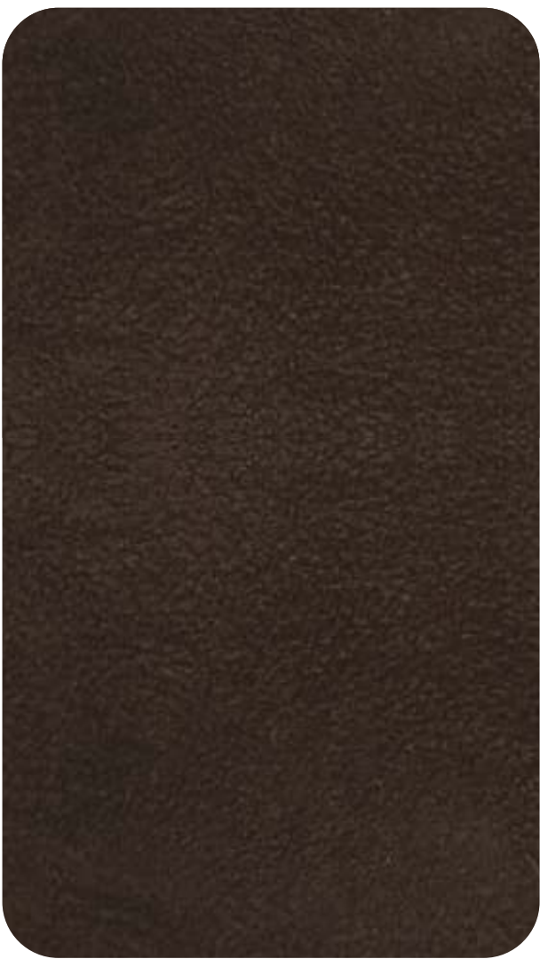
ANCONA - 908