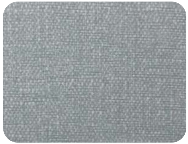
ASPEN - 714