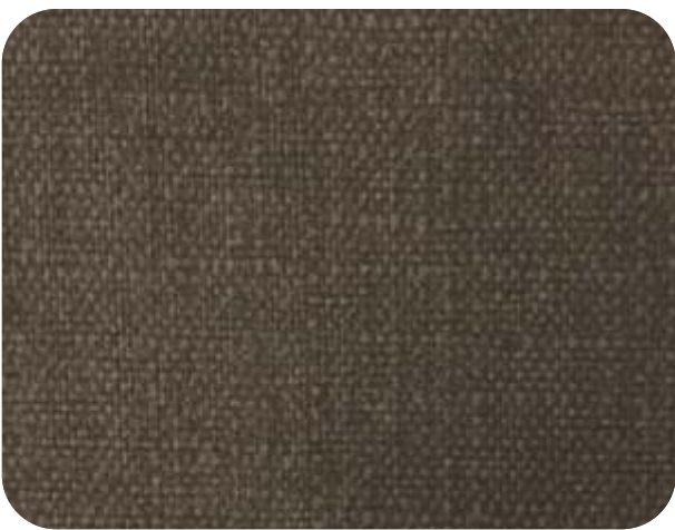
ASPEN - 715