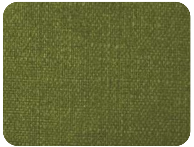
ASPEN - 712