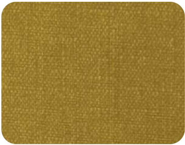
ASPEN - 711