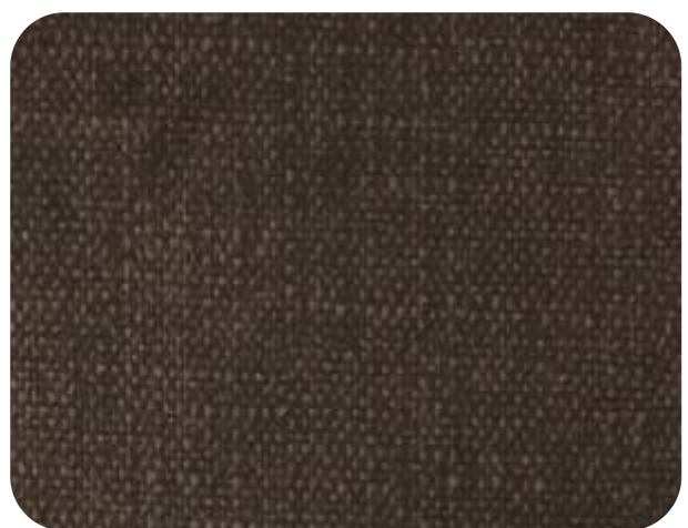
ASPEN - 707