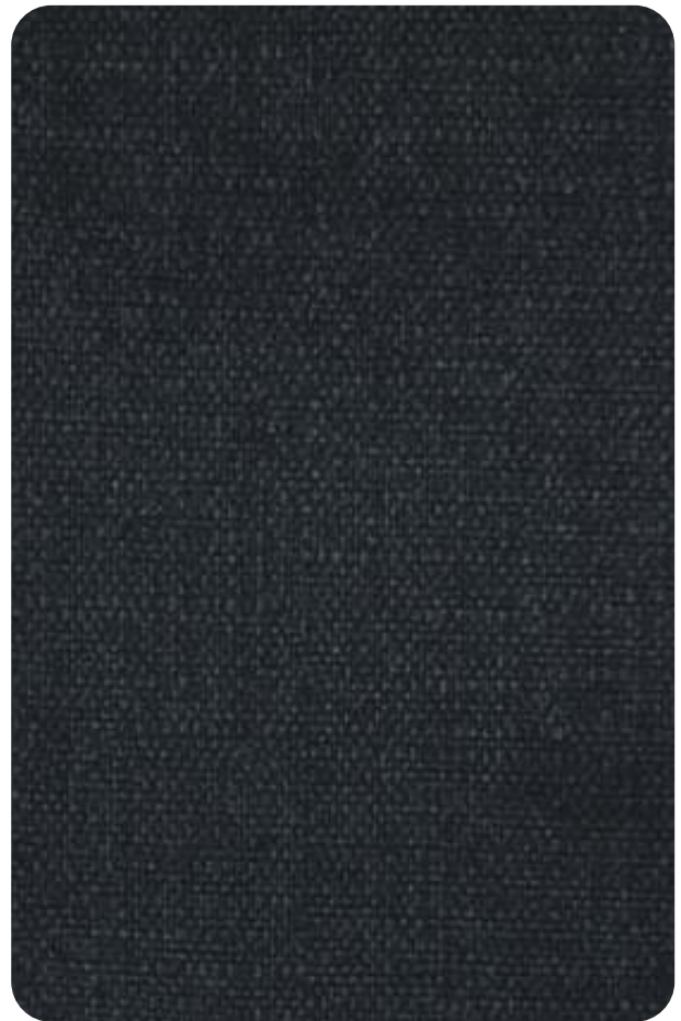
ASPEN - 713