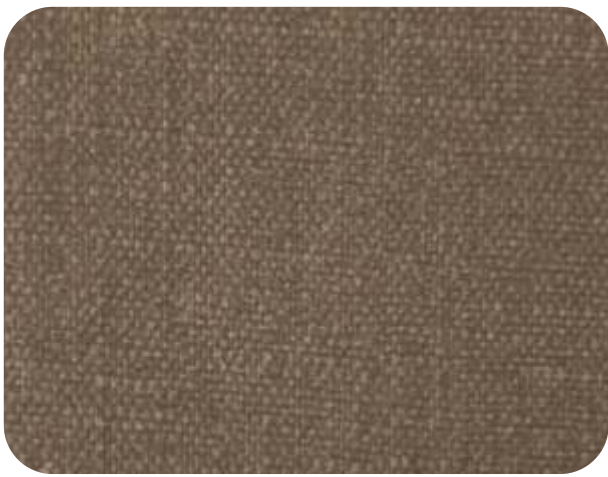
ASPEN - 703