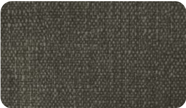
ASPEN - 718