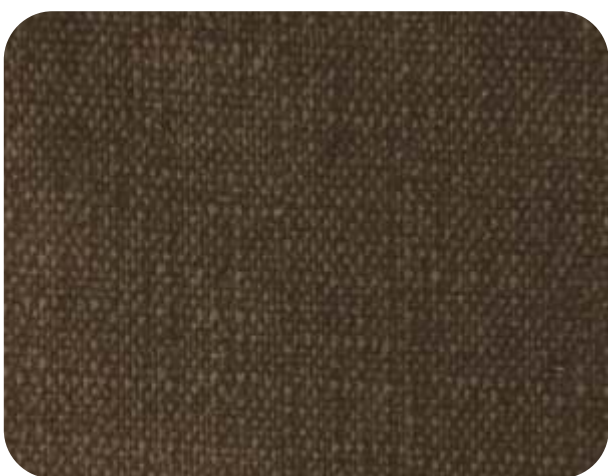
ASPEN - 704