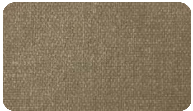
ASPEN - 702