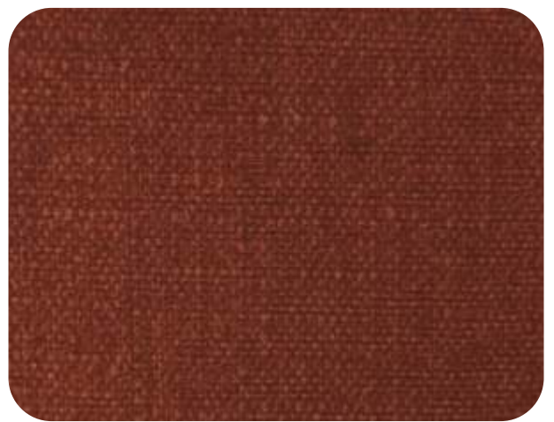
ASPEN - 708