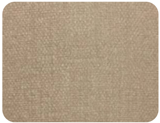
ASPEN - 701