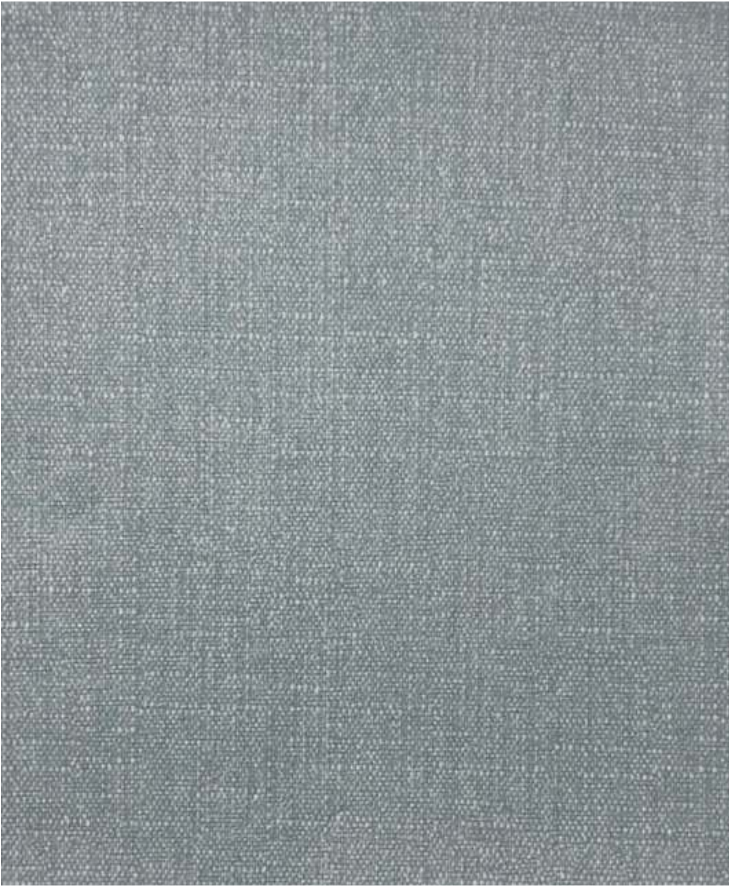
ASPEN - 714