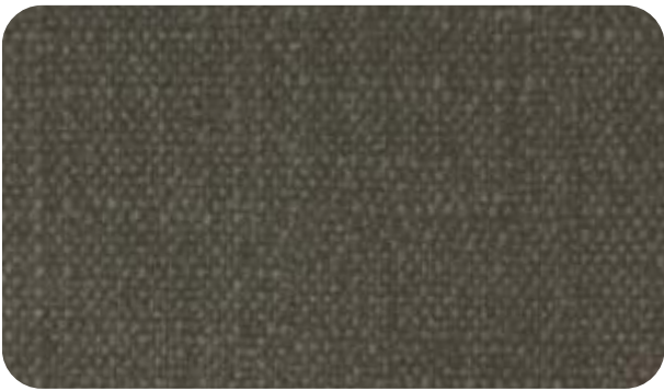
ASPEN - 717