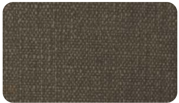
ASPEN - 706