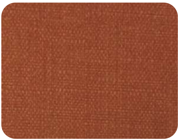
ASPEN - 709