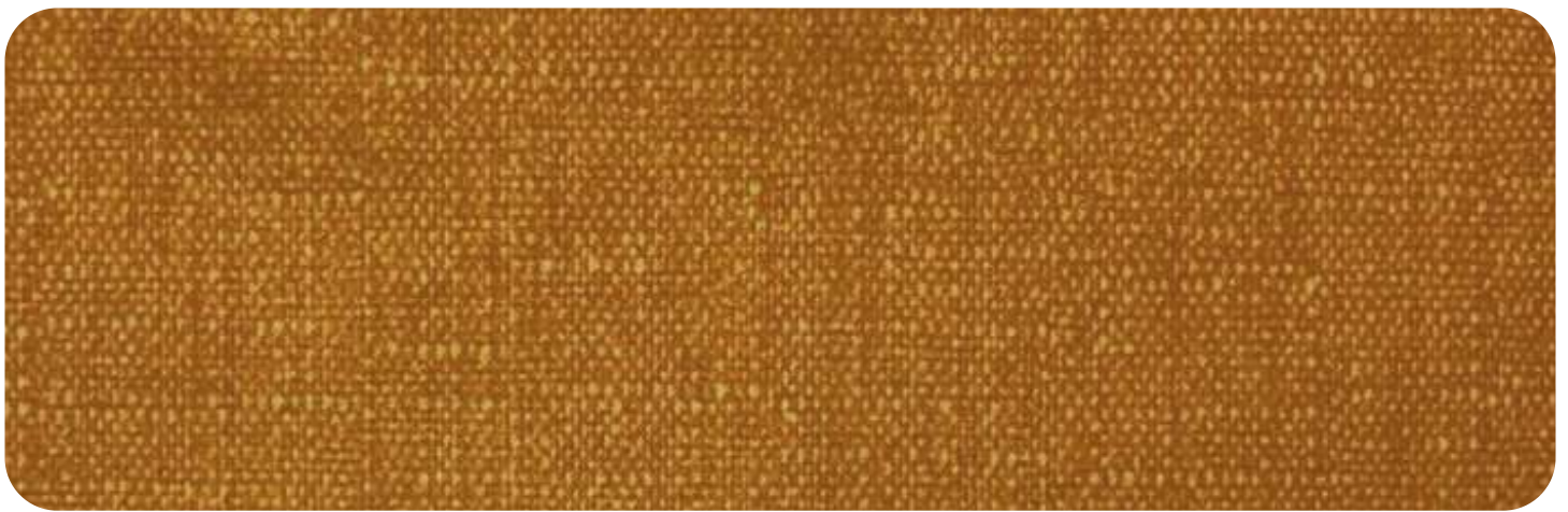
ASPEN - 710