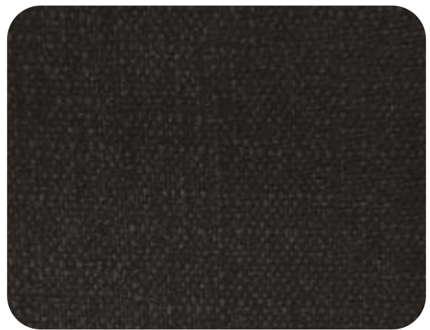
ASPEN - 719