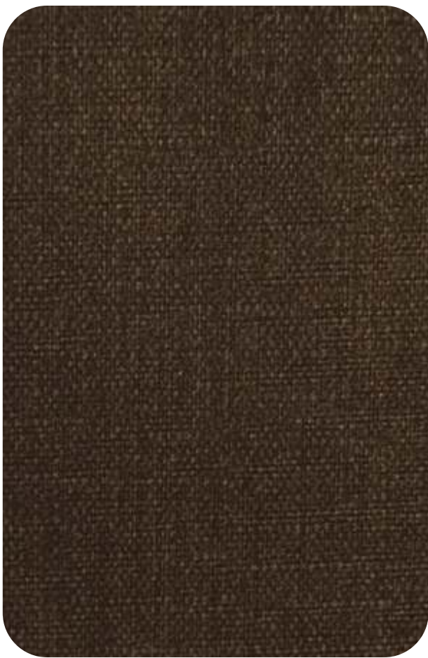
ASPEN - 705