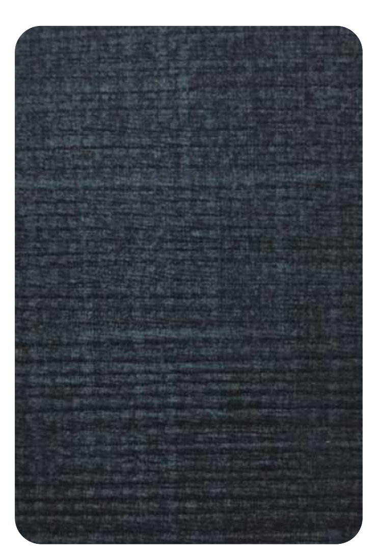
AUSTIN - 718