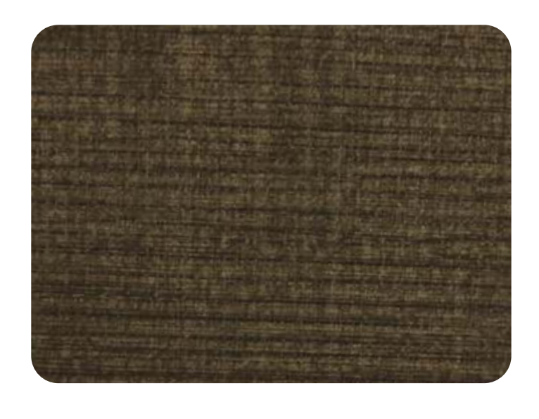
AUSTIN - 704