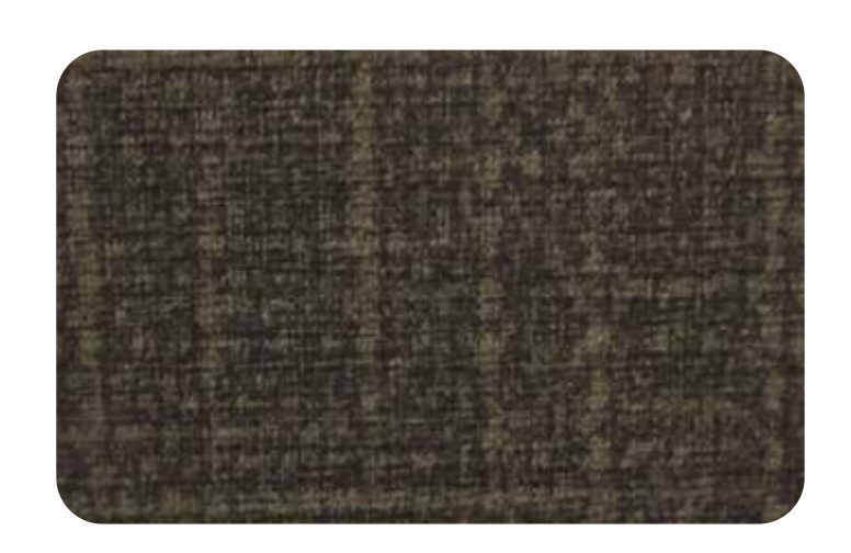
AUSTIN - 706