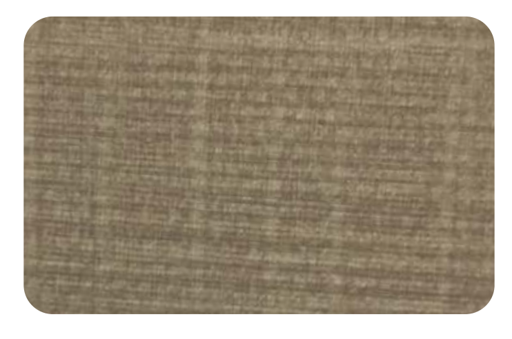
AUSTIN - 702