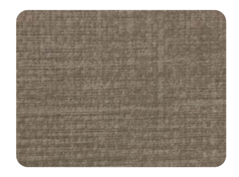
AUSTIN - 703