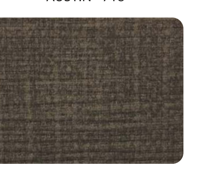
AUSTIN - 715