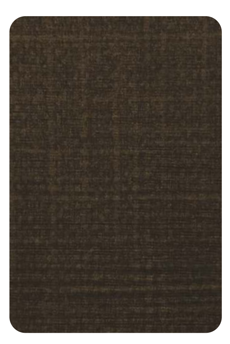
AUSTIN - 705