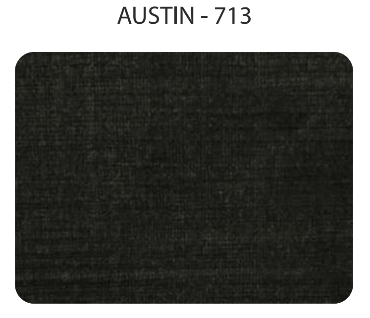
AUSTIN - 719