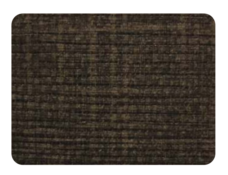
AUSTIN - 707