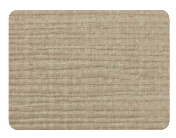
AUSTIN - 701