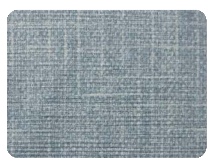
AUSTIN - 714