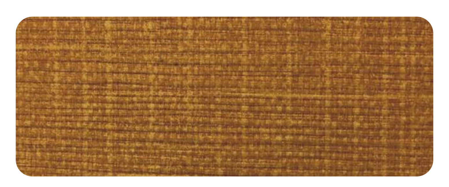
AUSTIN - 710