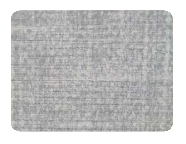
AUSTIN - 716