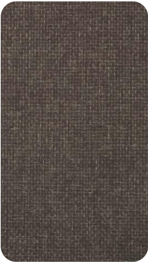
BRISBANE - 716