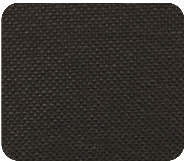
BRISBANE - 719