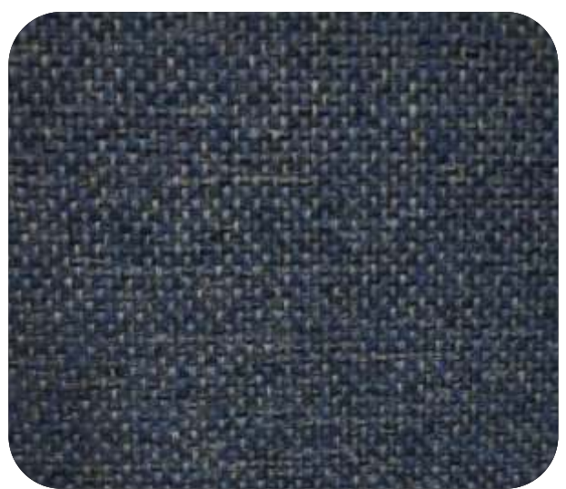
BRISBANE - 715