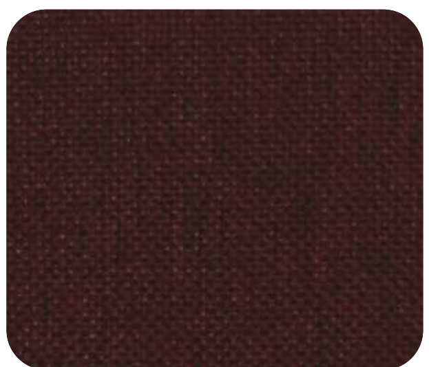
BRISBANE - 711