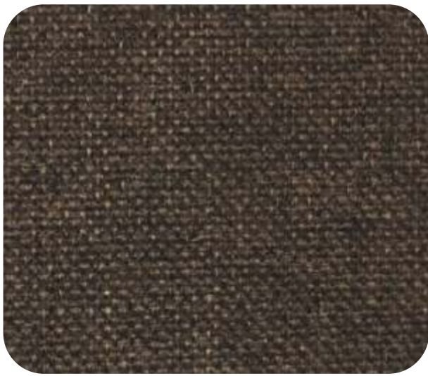
BRISBANE - 707