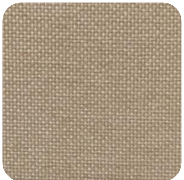
BRISBANE - 701