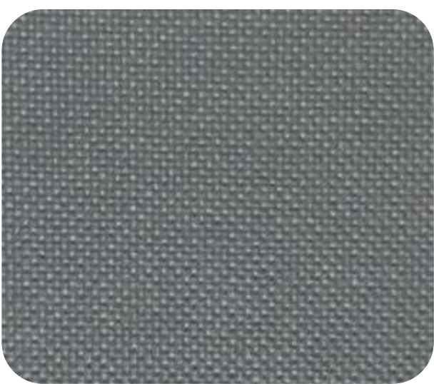
BRISBANE - 713