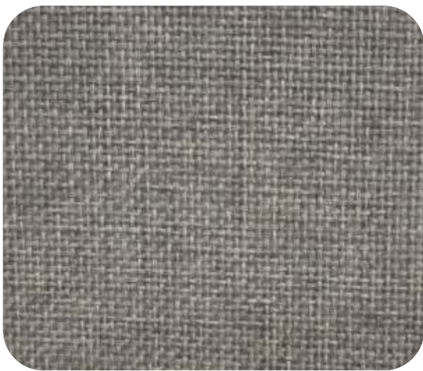
BRISBANE - 717