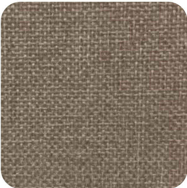
BRISBANE - 704