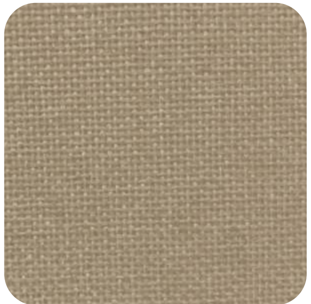
BRISBANE - 702