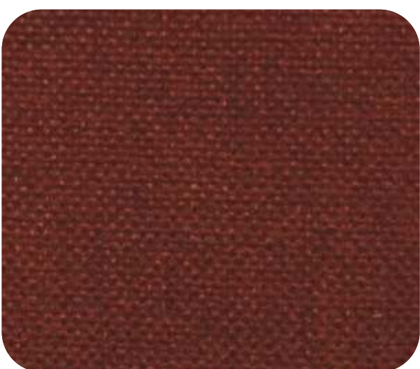
BRISBANE - 709