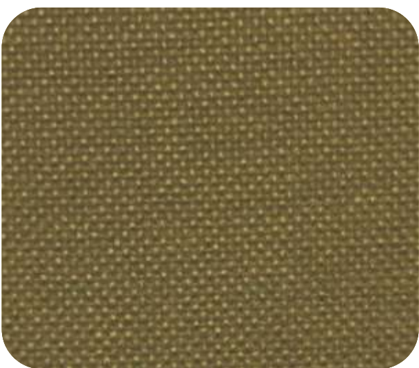
BRISBANE - 712