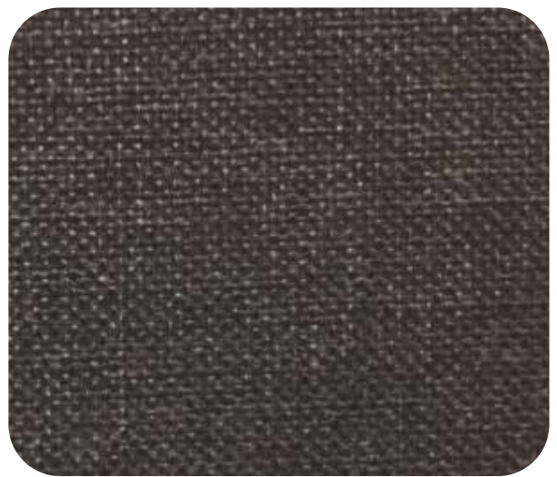
BRISBANE - 718