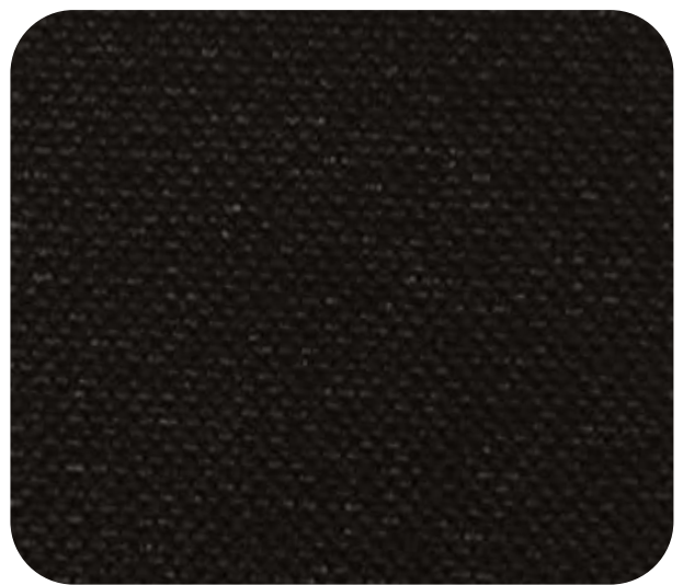
BRISBANE - 720