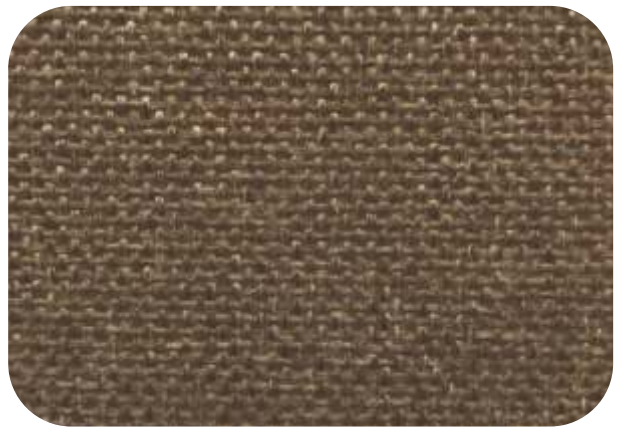
BRISBANE - 706