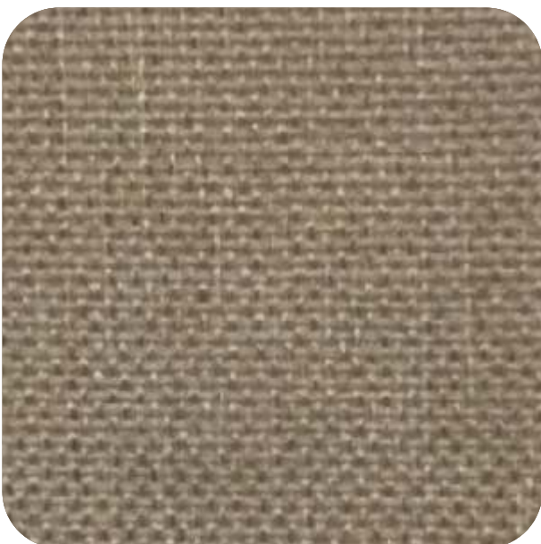
BRISBANE - 703