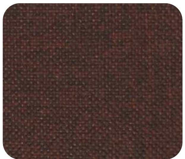
BRISBANE - 710