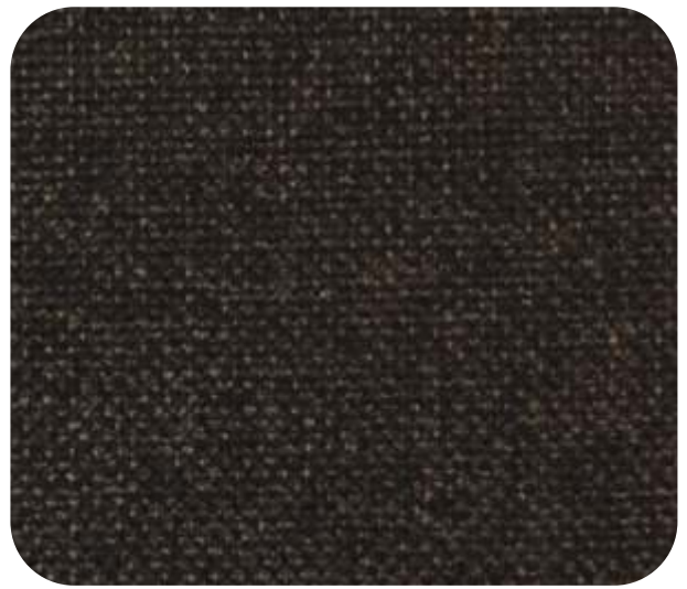
BRISBANE - 708