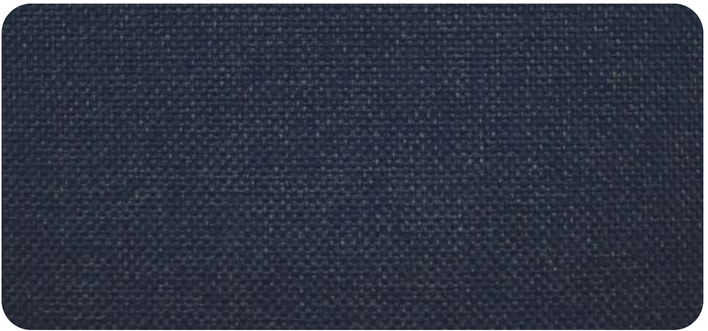
BRISBANE - 714