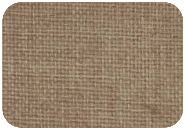
BRISBANE - 705