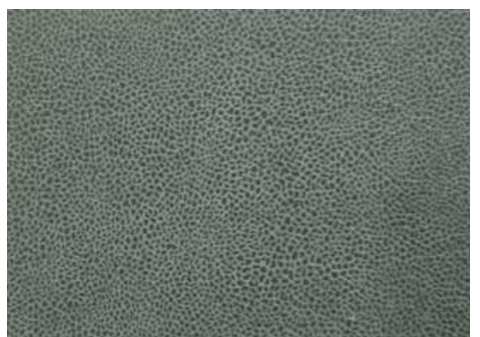
BRYAN | 720