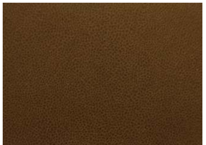
BRYAN | 707