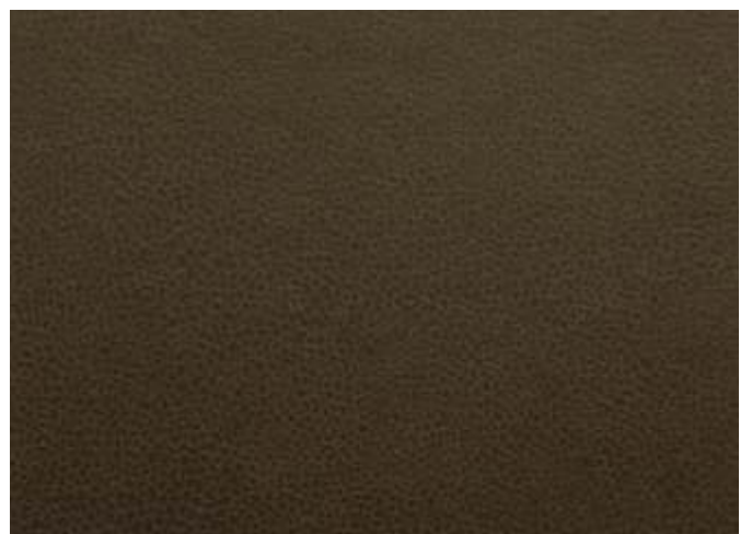
BRYAN | 706