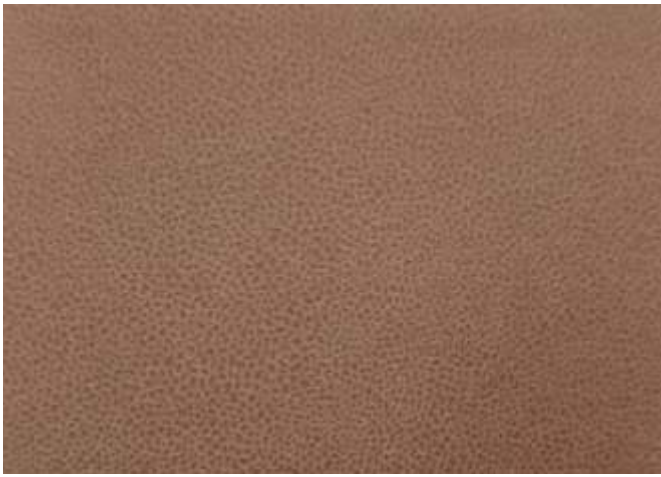
BRYAN | 709