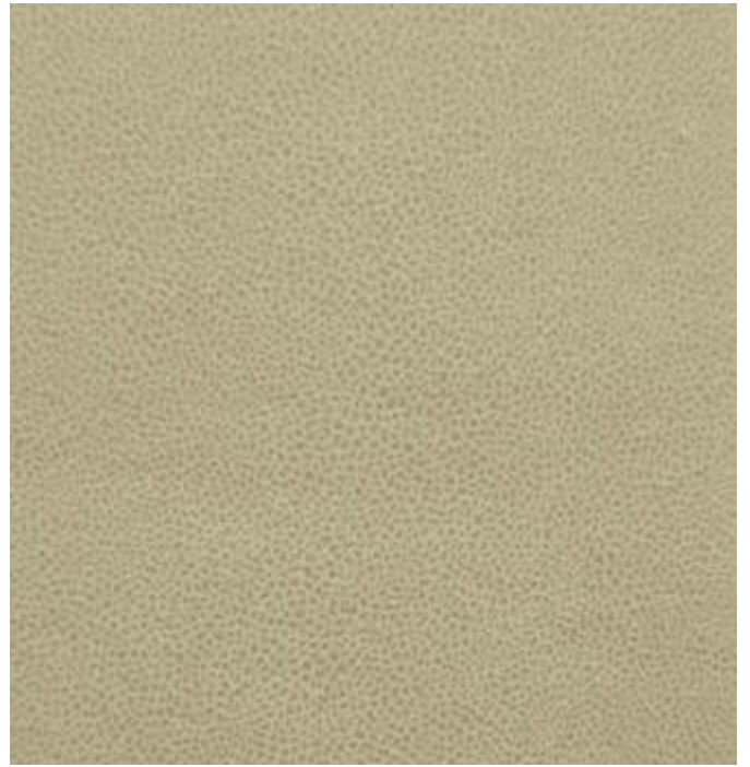
BRYAN | 701