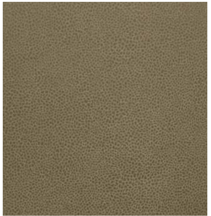
BRYAN | 704