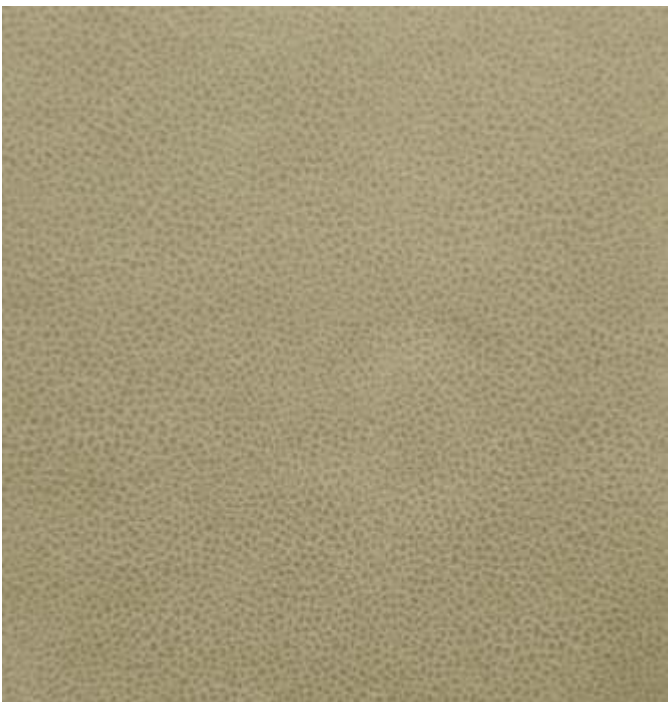
BRYAN | 703