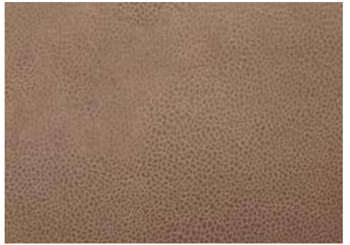
BRYAN | 708