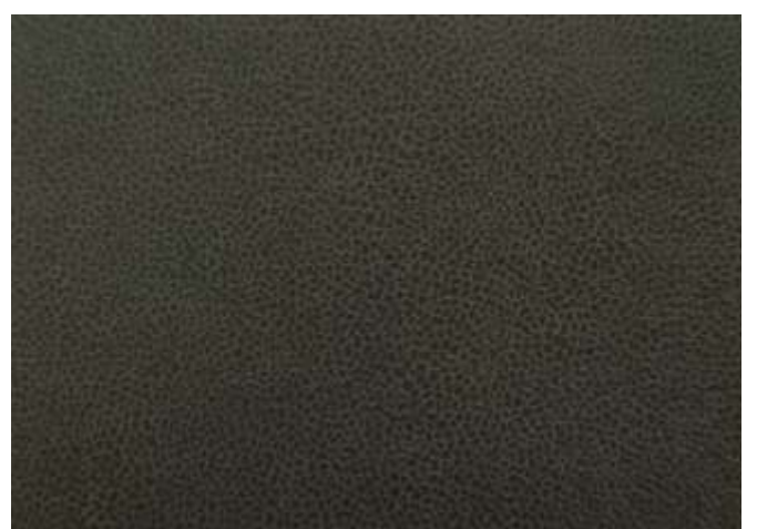
BRYAN | 721