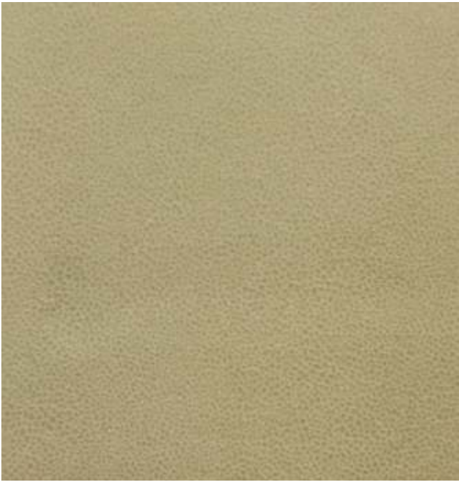
BRYAN | 702