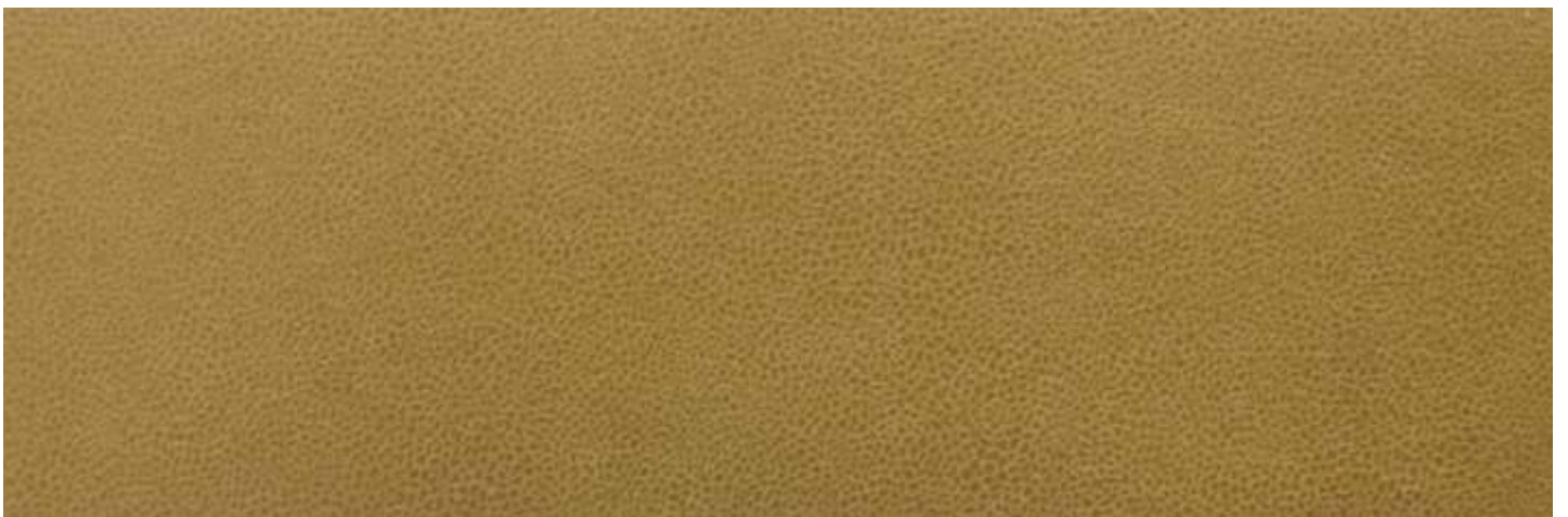
BRYAN | 710