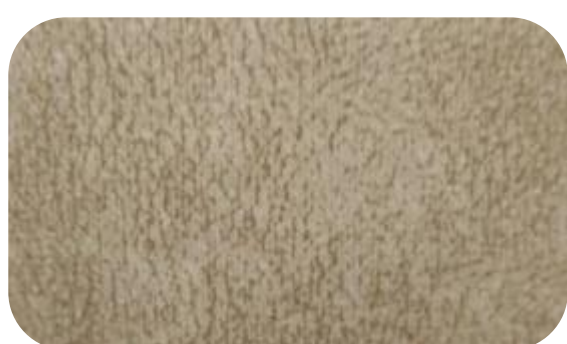
CHOPER - 902