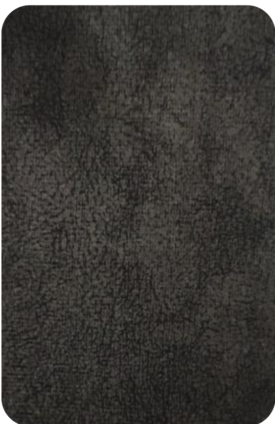
CHOPER - 918