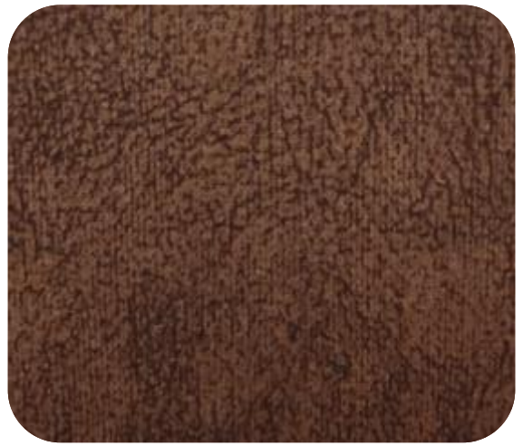
CHOPER - 909