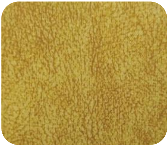
CHOPER - 910