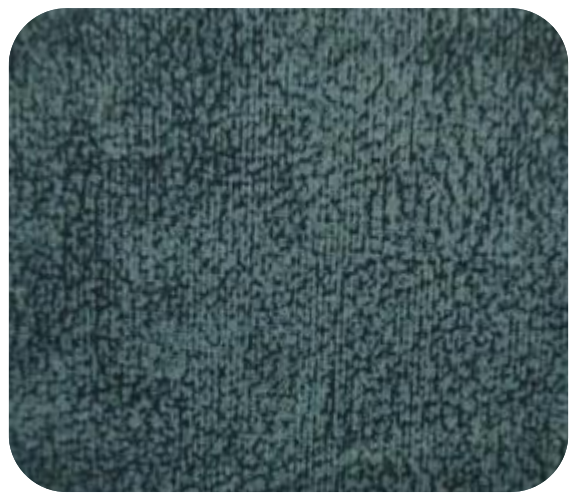
CHOPER - 912