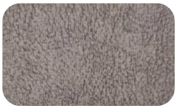
CHOPER - 916