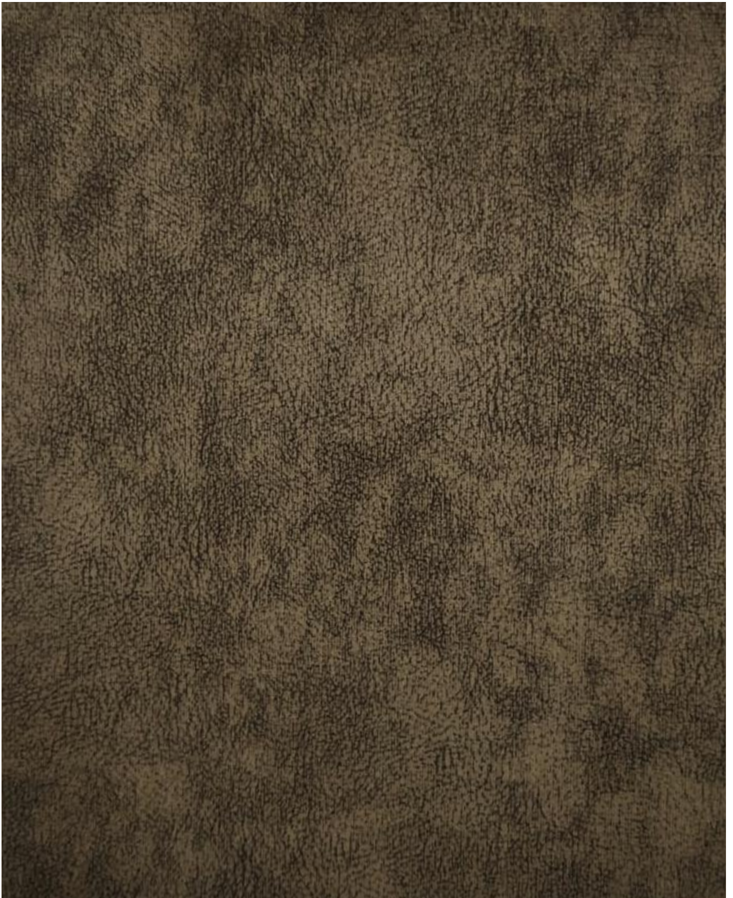
CHOPER - 905