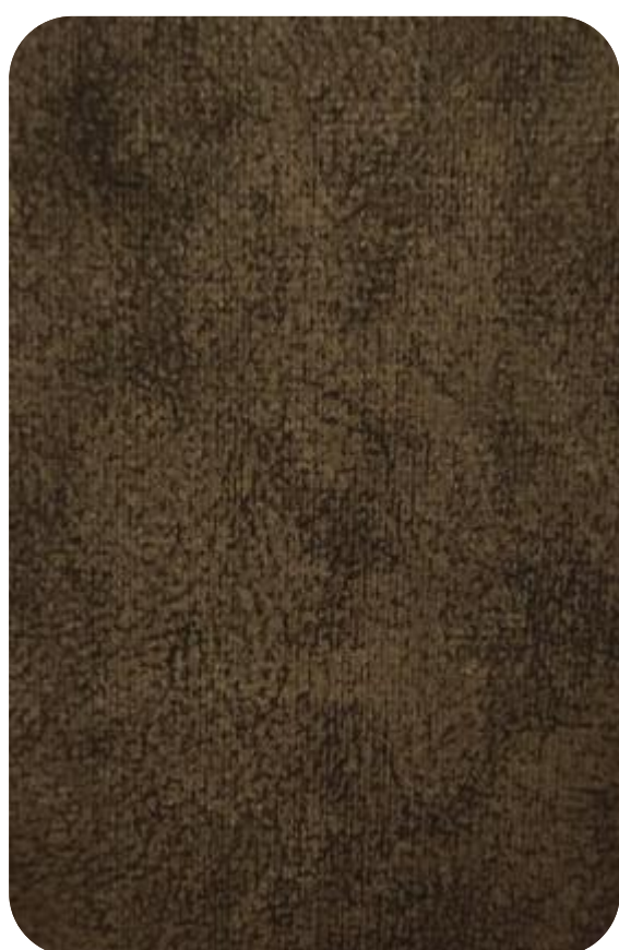
CHOPER - 906