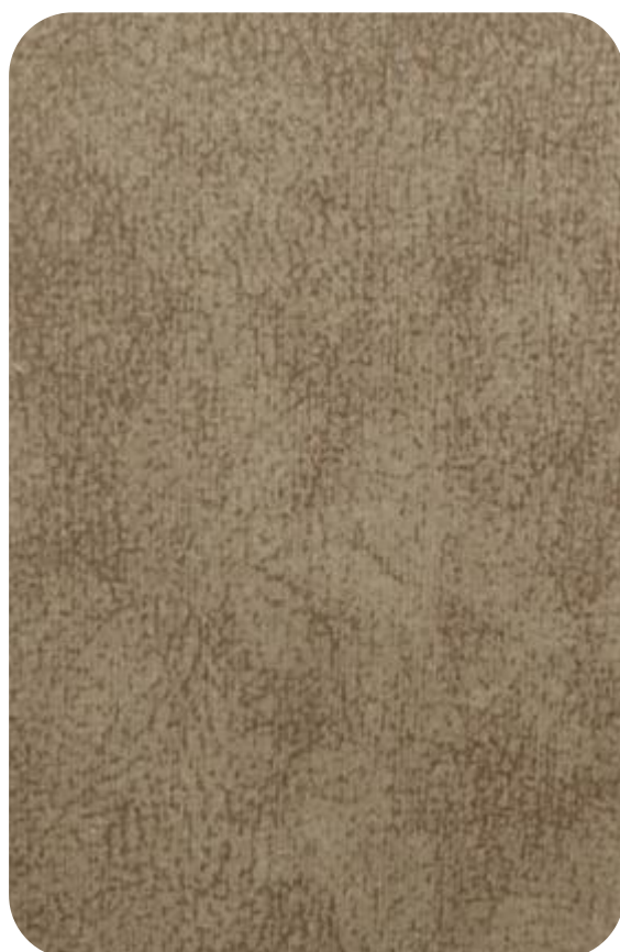
CHOPER - 903