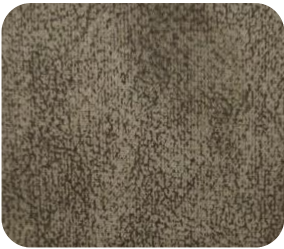
CHOPER - 914