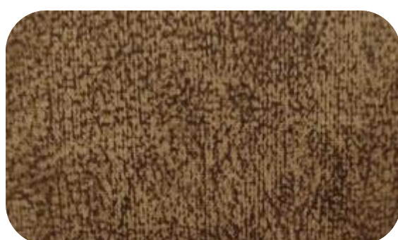
CHOPER - 904