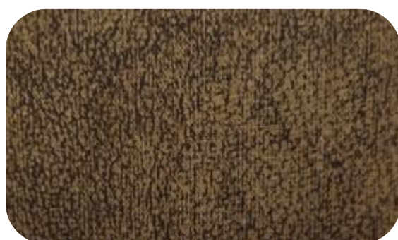
CHOPER - 905