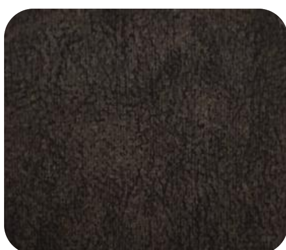
CHOPER - 908