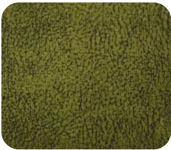
CHOPER - 911