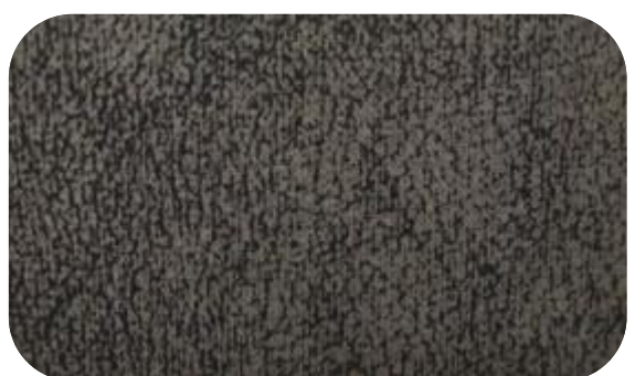
CHOPER - 917