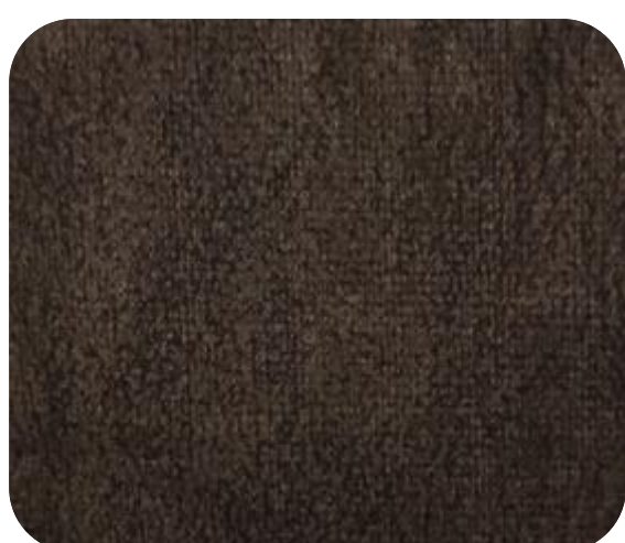
CHOPER - 907