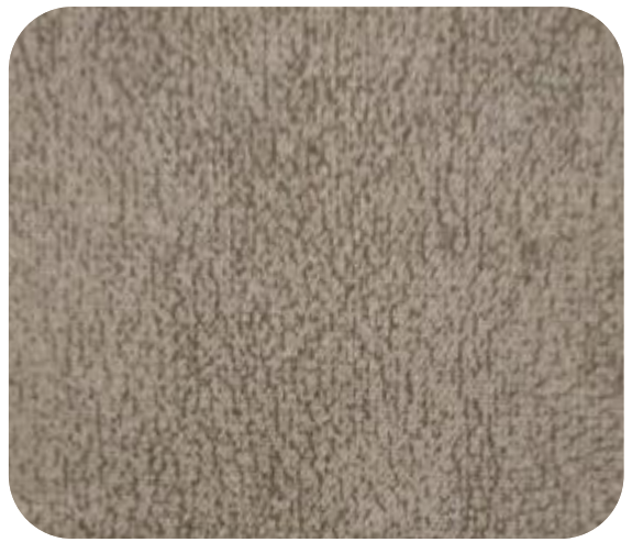
CHOPER - 915