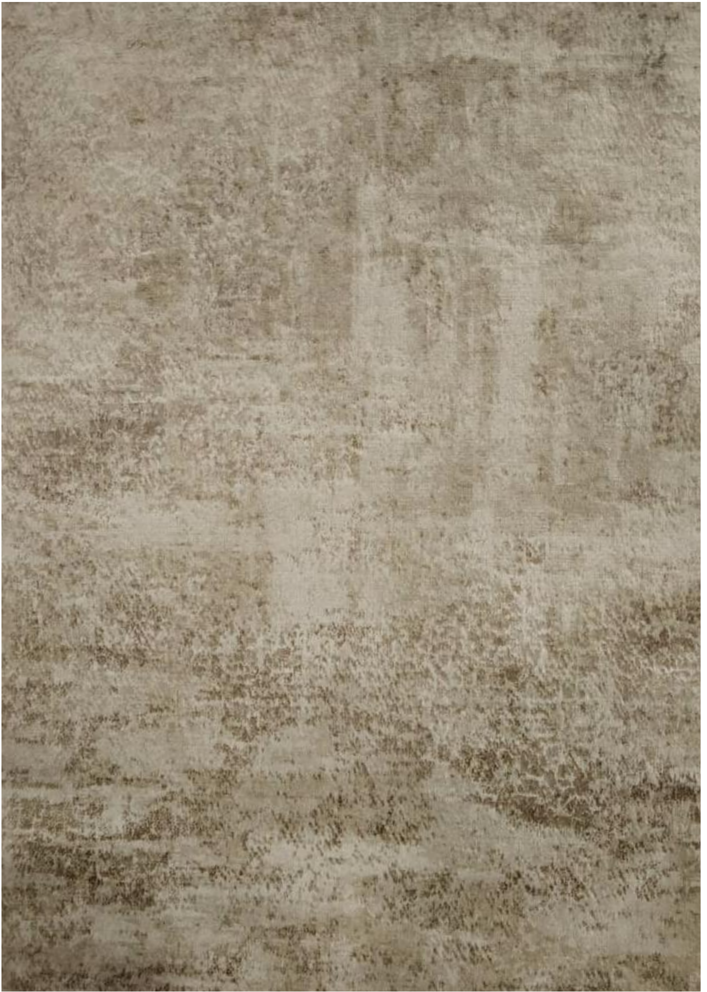
ELEGANT - 104