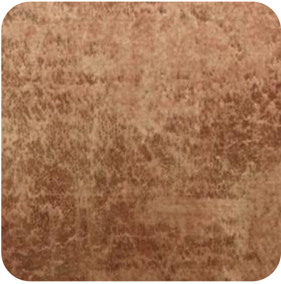
ELEGANT - 113