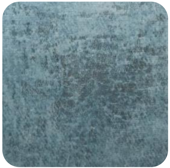
ELEGANT - 110