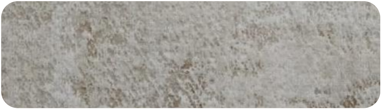
ELEGANT - 102