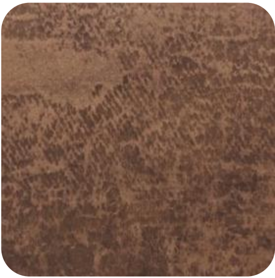
ELEGANT - 105