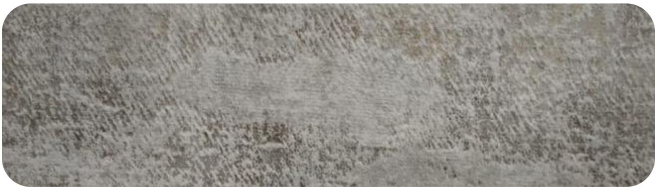
ELEGANT - 108