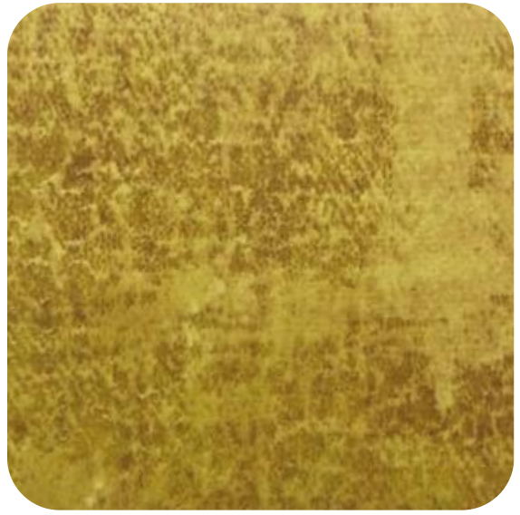
ELEGANT - 112