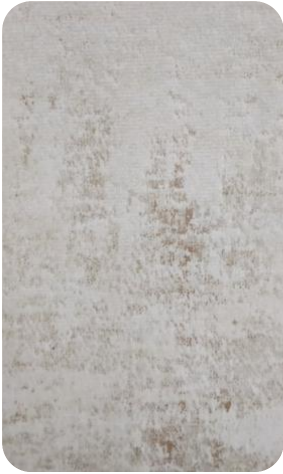
ELEGANT - 101