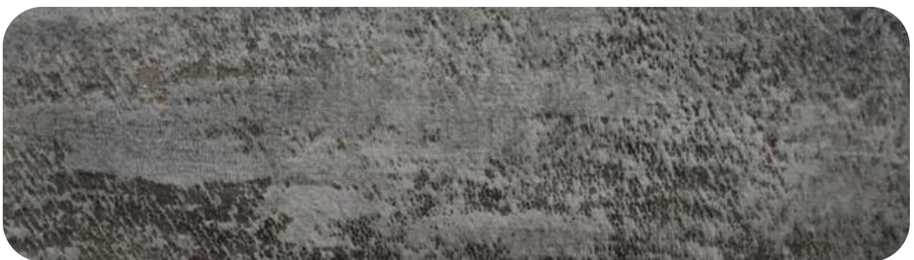
ELEGANT - 109