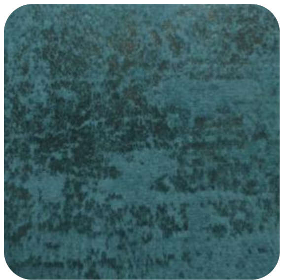
ELEGANT - 111