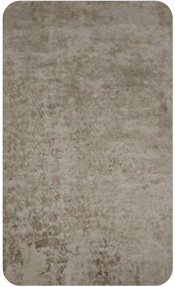
ELEGANT - 103