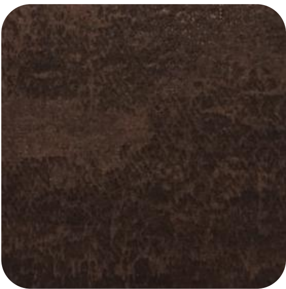
ELEGANT - 106