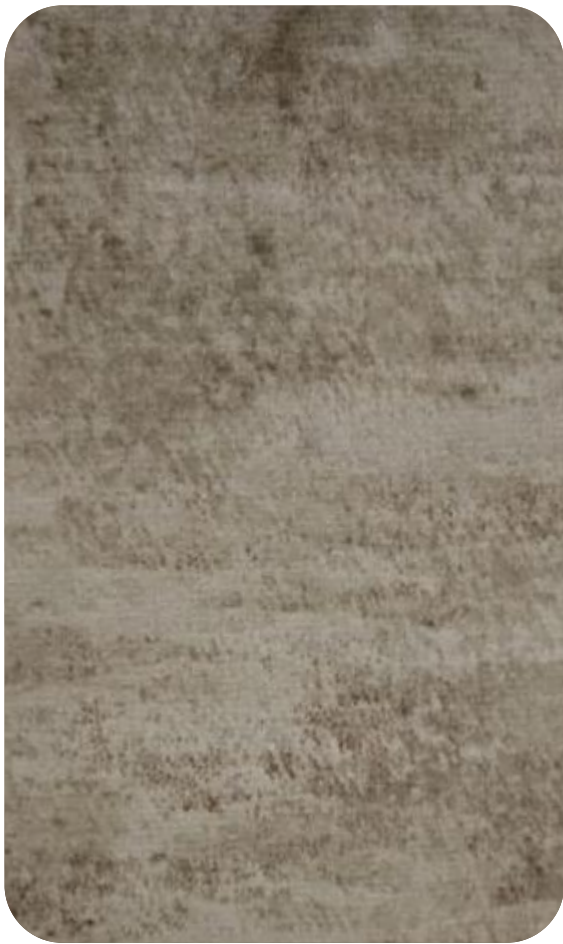
ELEGANT - 104