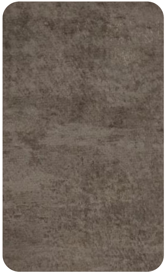
ELEGANT - 107