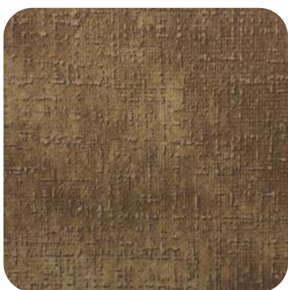
GLAMOUR - 104