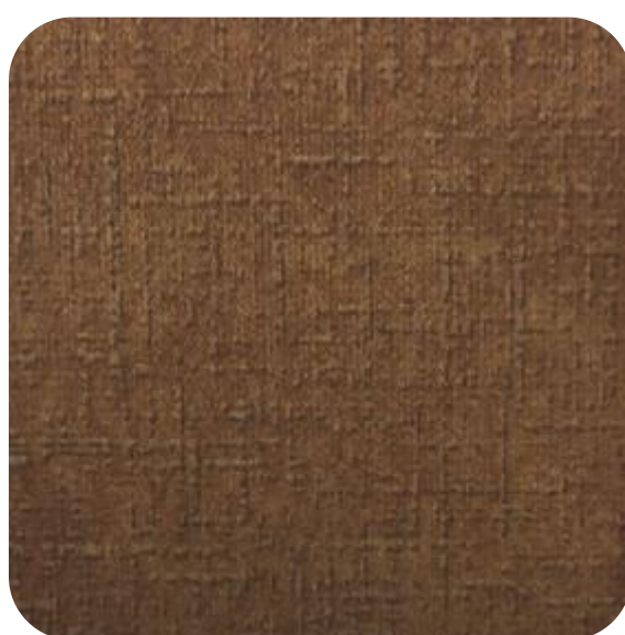
GLAMOUR - 108