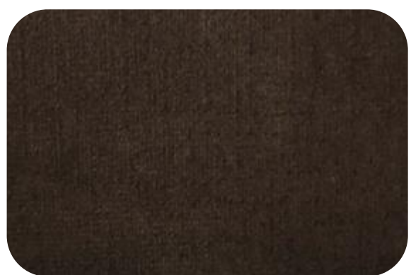
GLAMOUR - 107