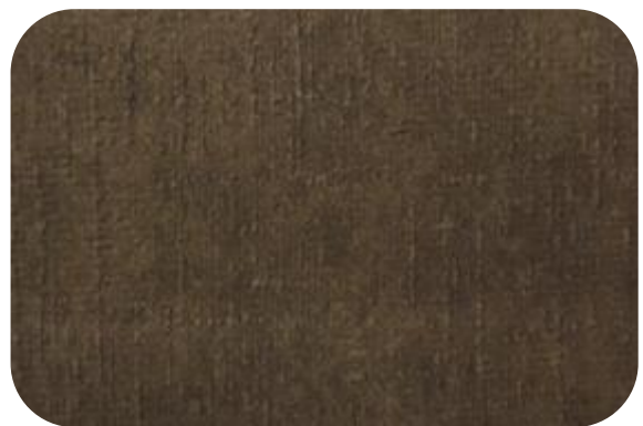
GLAMOUR - 106