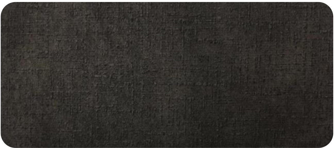
GLAMOUR - 119