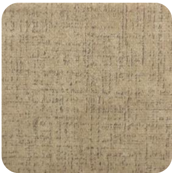
GLAMOUR - 101