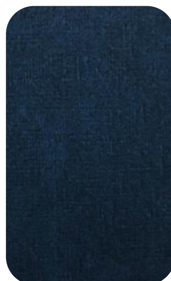
GLAMOUR - 113