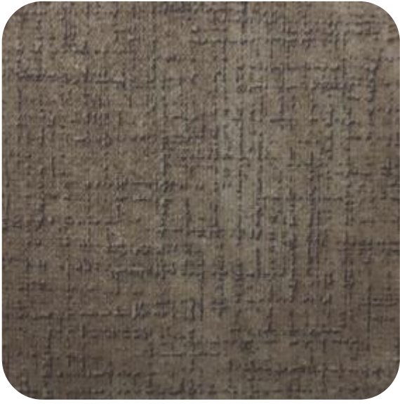
GLAMOUR - 115