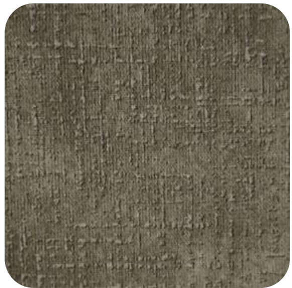
GLAMOUR - 114