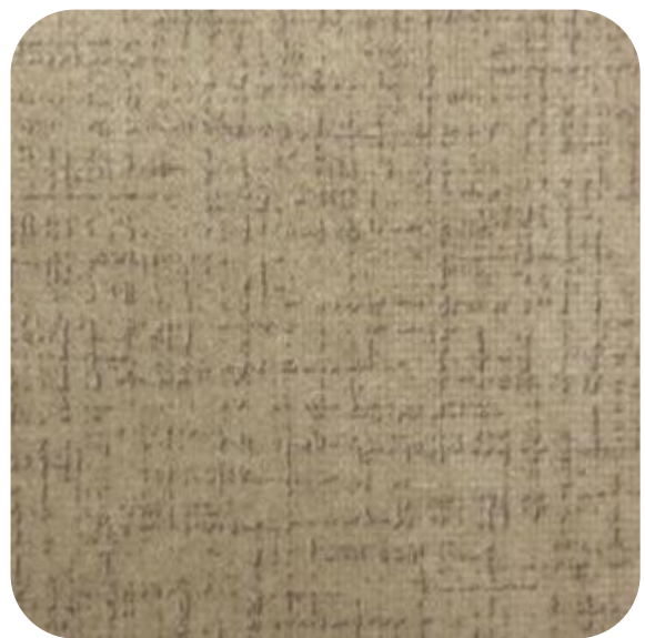
GLAMOUR - 102