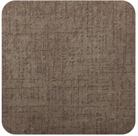
GLAMOUR - 116