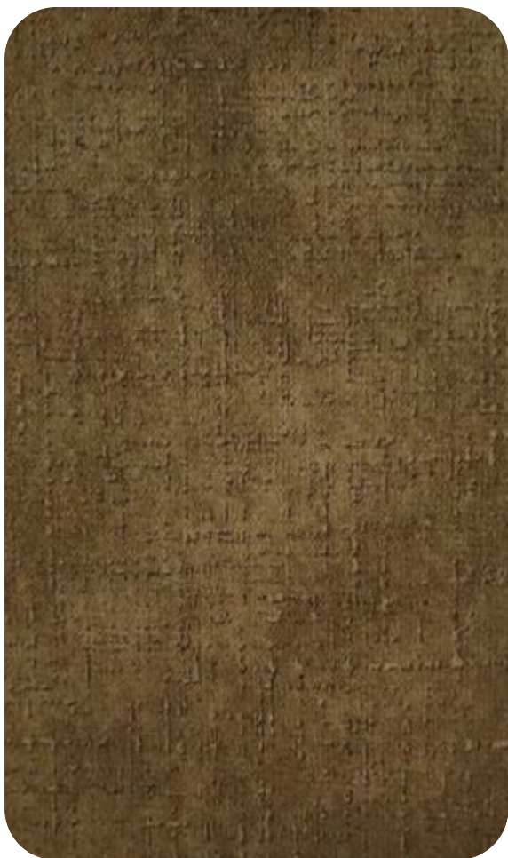
GLAMOUR - 105