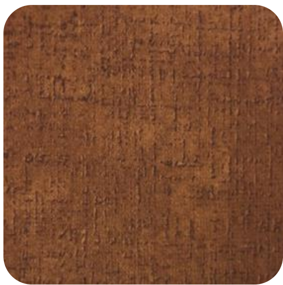
GLAMOUR - 110