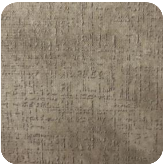
GLAMOUR - 117