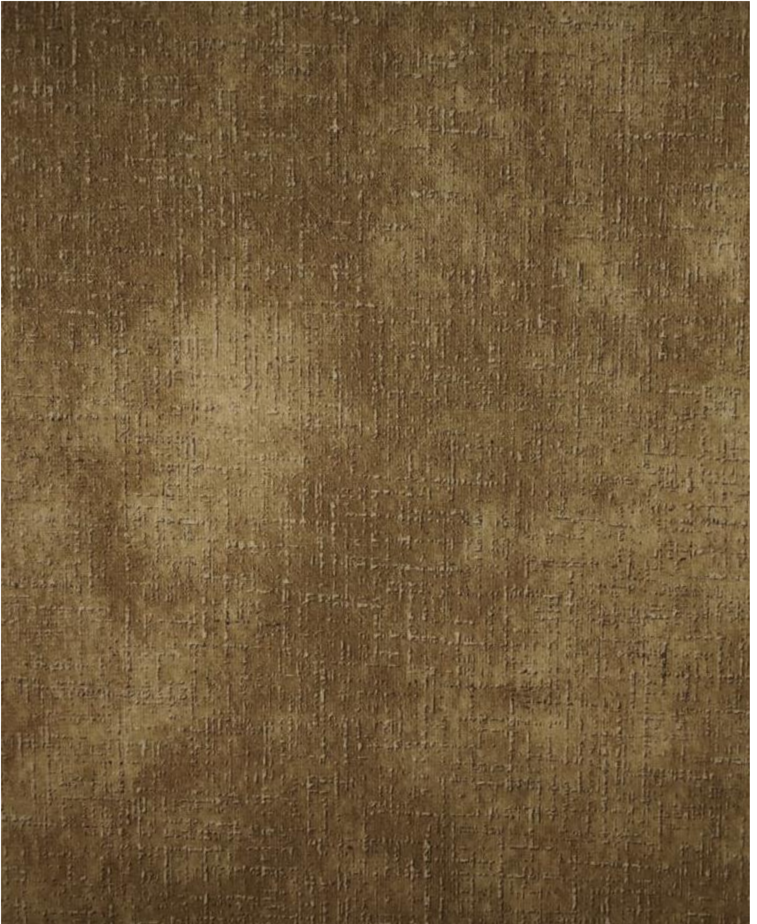
GLAMOUR - 104