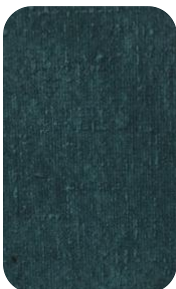
GLAMOUR - 112