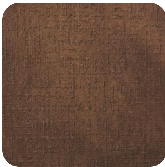
GLAMOUR - 109