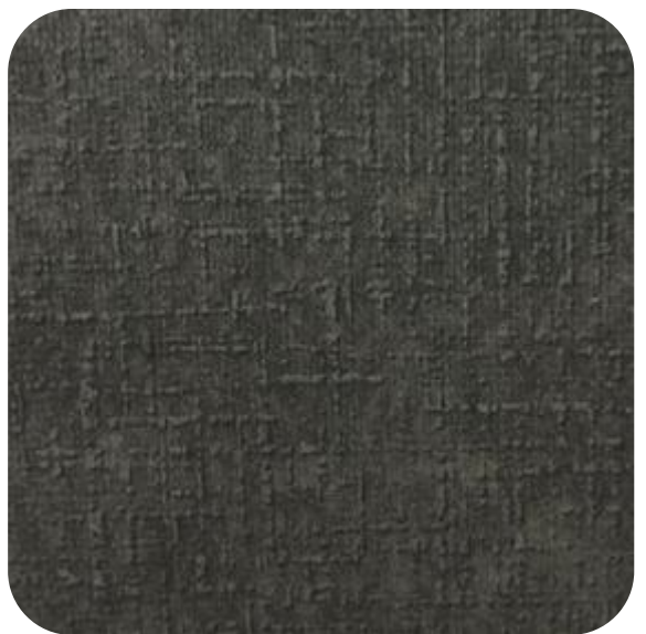
GLAMOUR - 118