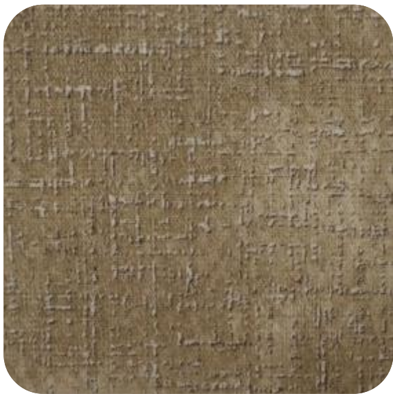
GLAMOUR - 103