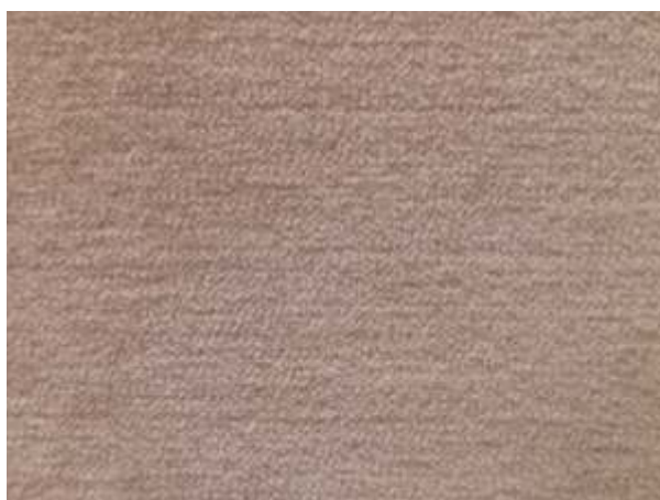
KENZI | 909