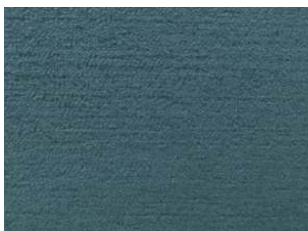
KENZI | 915