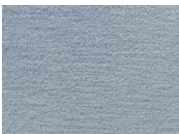
KENZI | 916