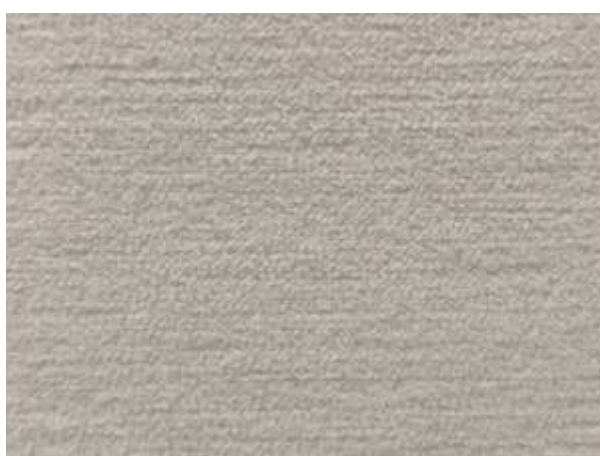
KENZI | 925