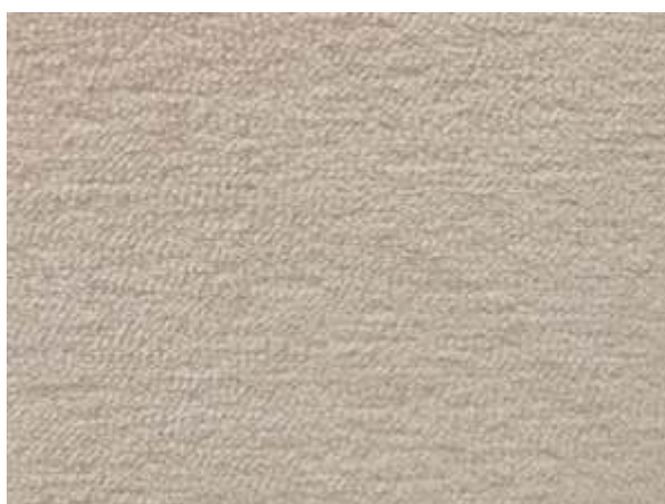
KENZI | 907