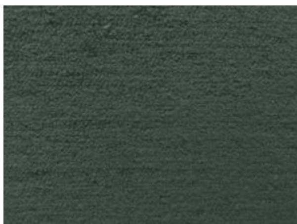
KENZI | 912