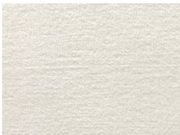
KENZI | 901