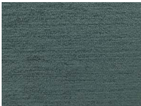
KENZI | 914