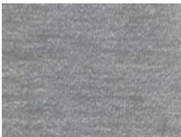
KENZI | 926