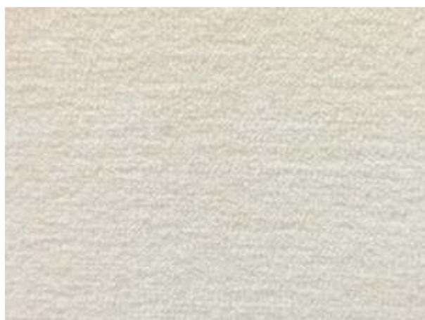
KENZI | 903