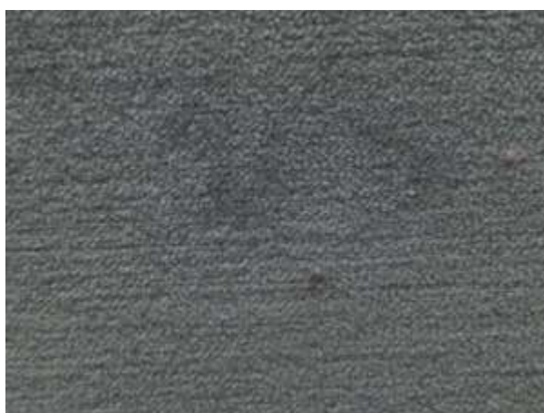
KENZI | 928