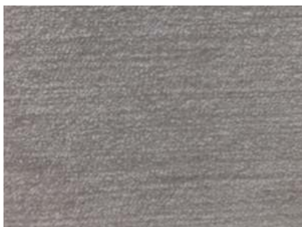
KENZI | 920