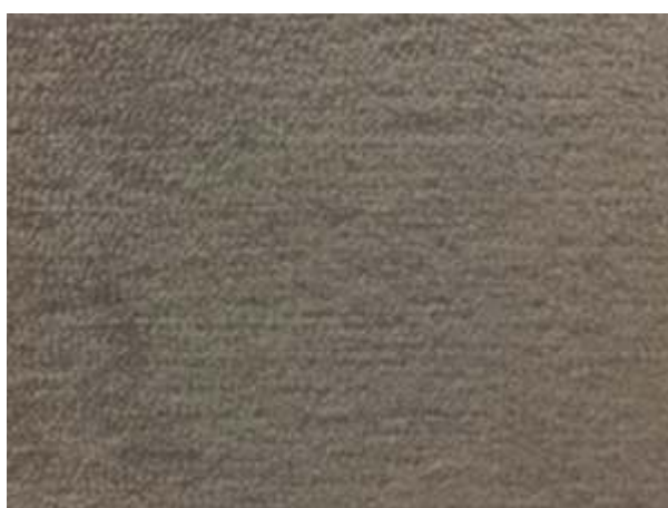
KENZI | 905