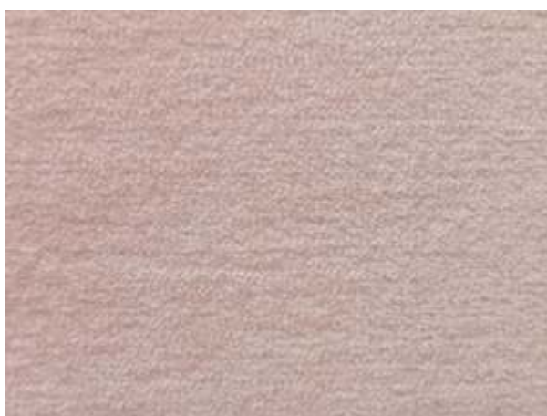
KENZI | 908