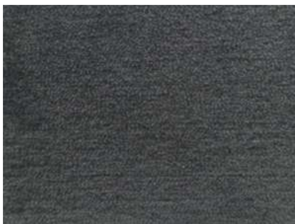
KENZI | 929