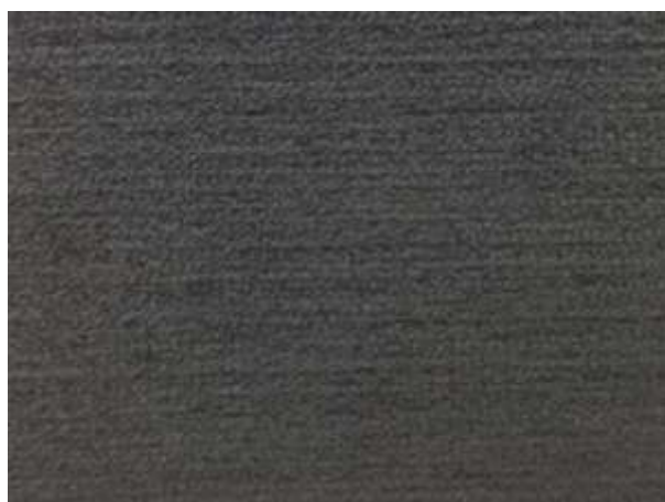
KENZI | 924