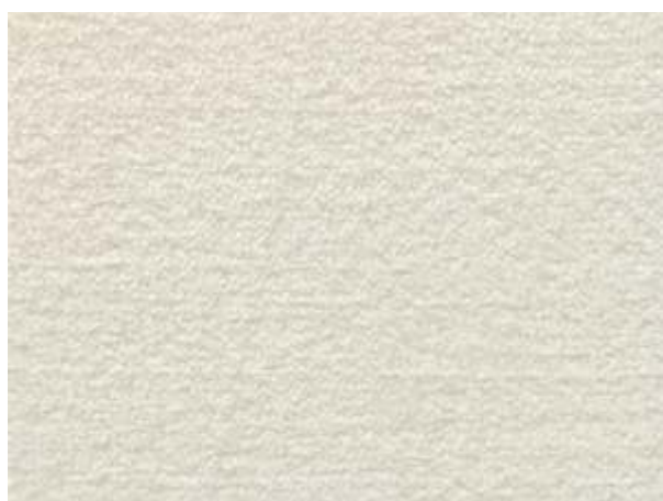
KENZI | 902