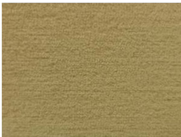
KENZI | 906