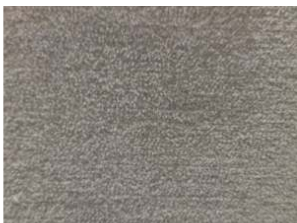
KENZI | 922