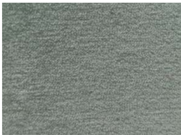
KENZI | 911