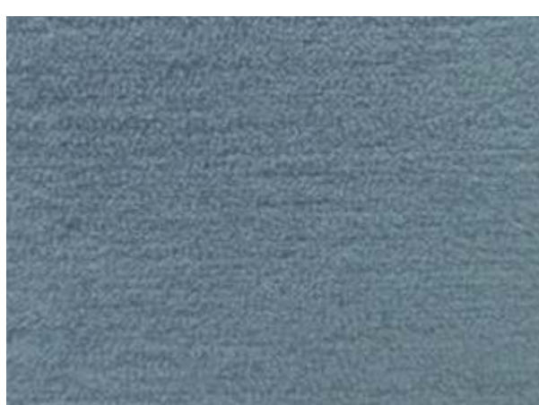
KENZI | 917