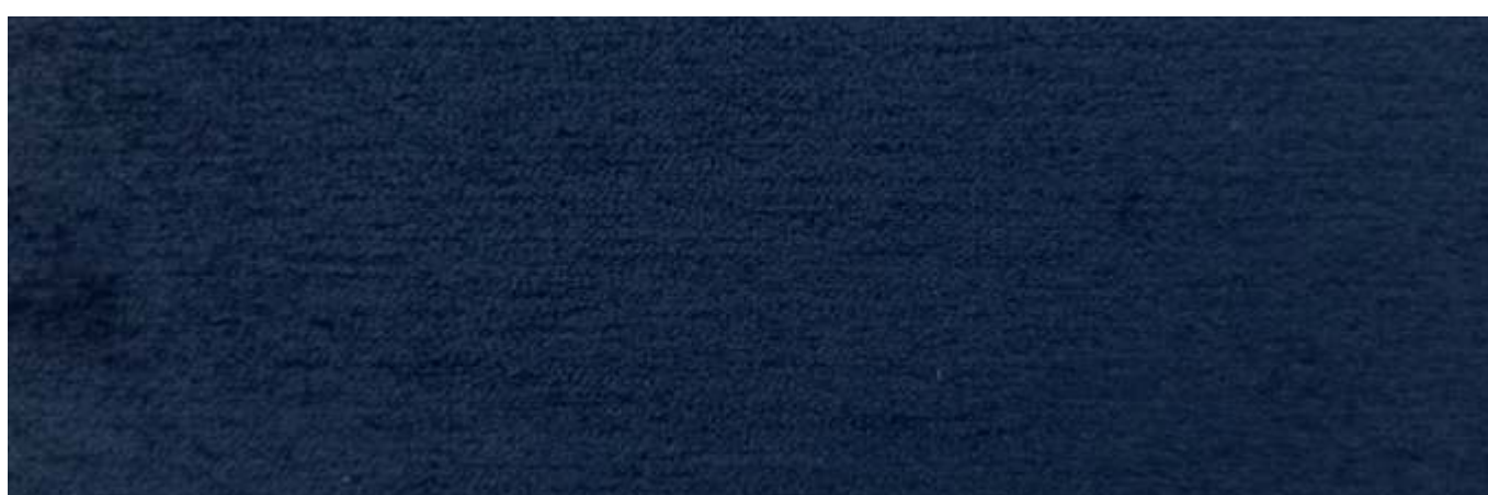
KENZI | 918