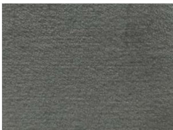
KENZI | 921