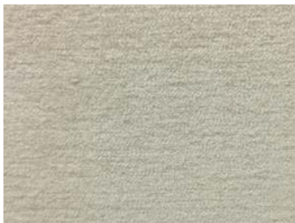
KENZI | 904