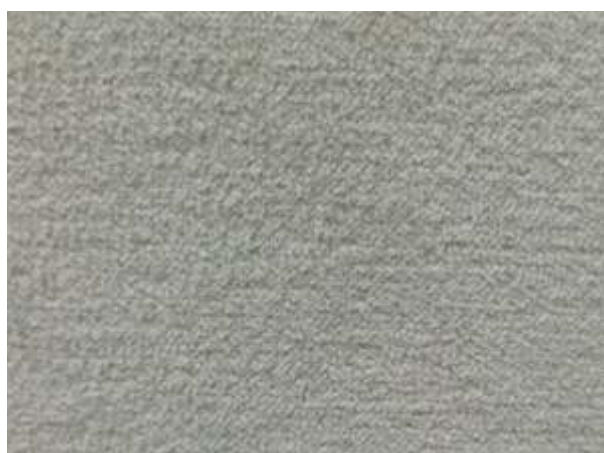
KENZI | 910