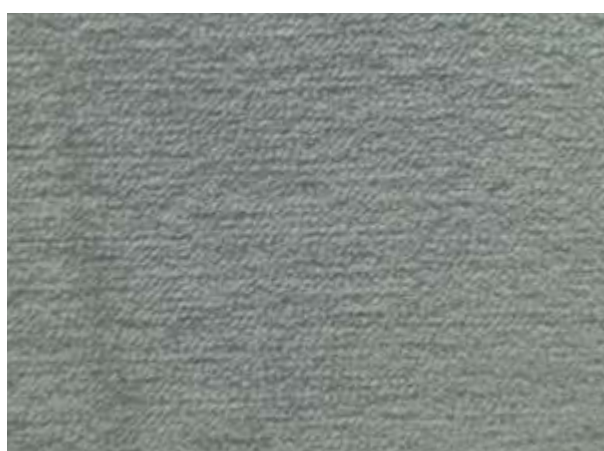
KENZI | 913