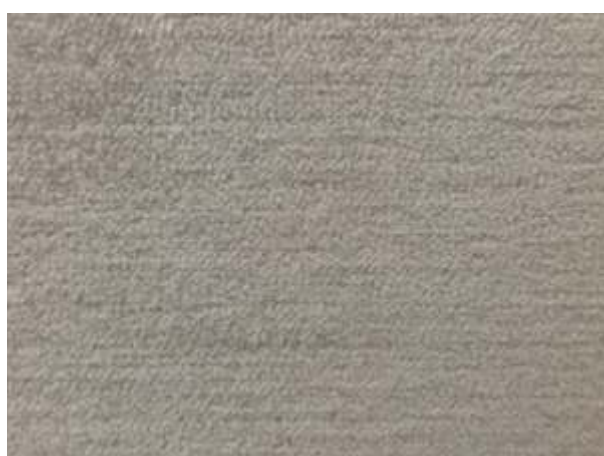
KENZI | 919