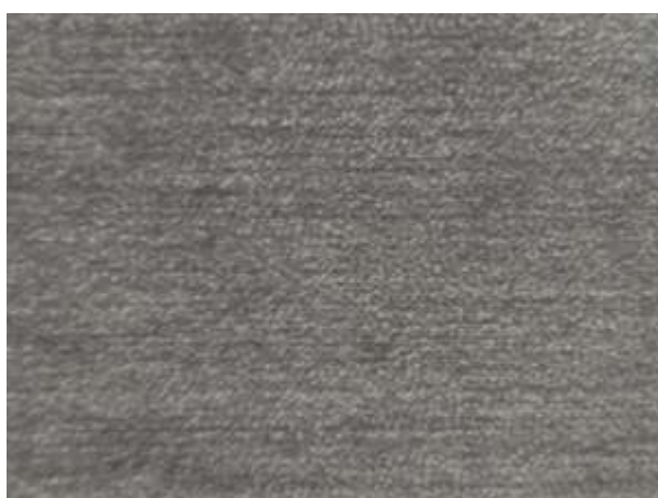
KENZI | 927