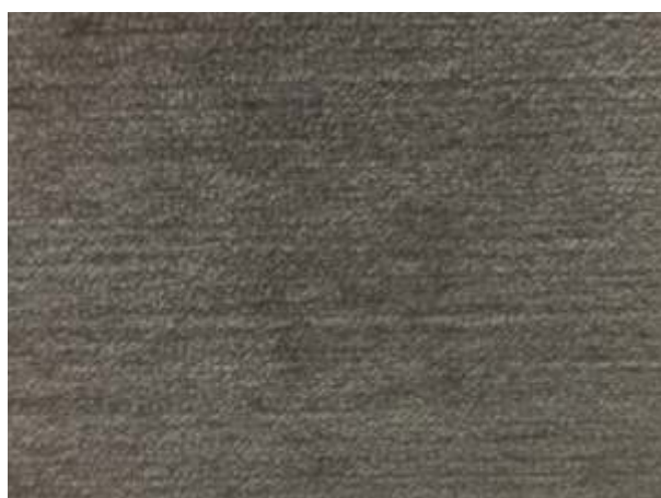
KENZI | 923