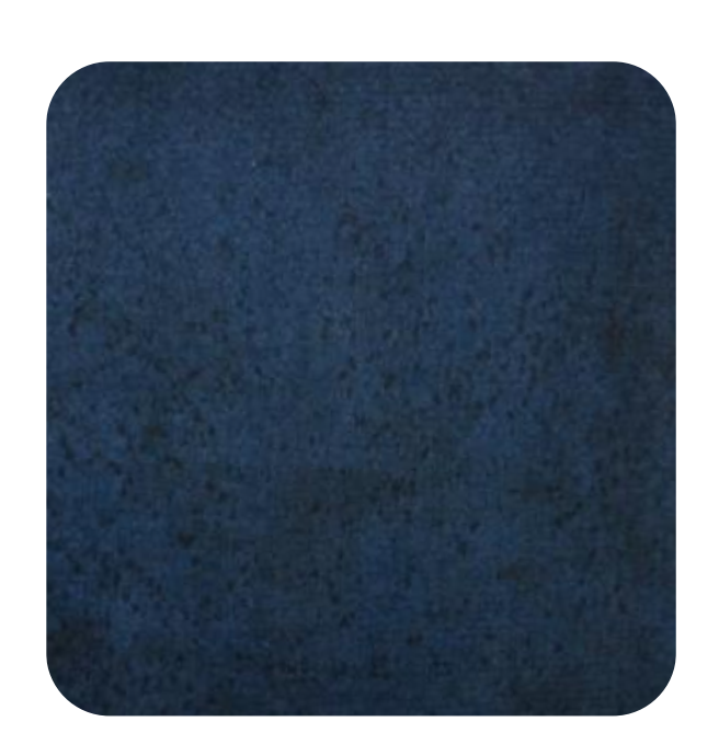
MIRACLE - 111