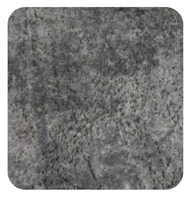
MIRACLE - 114