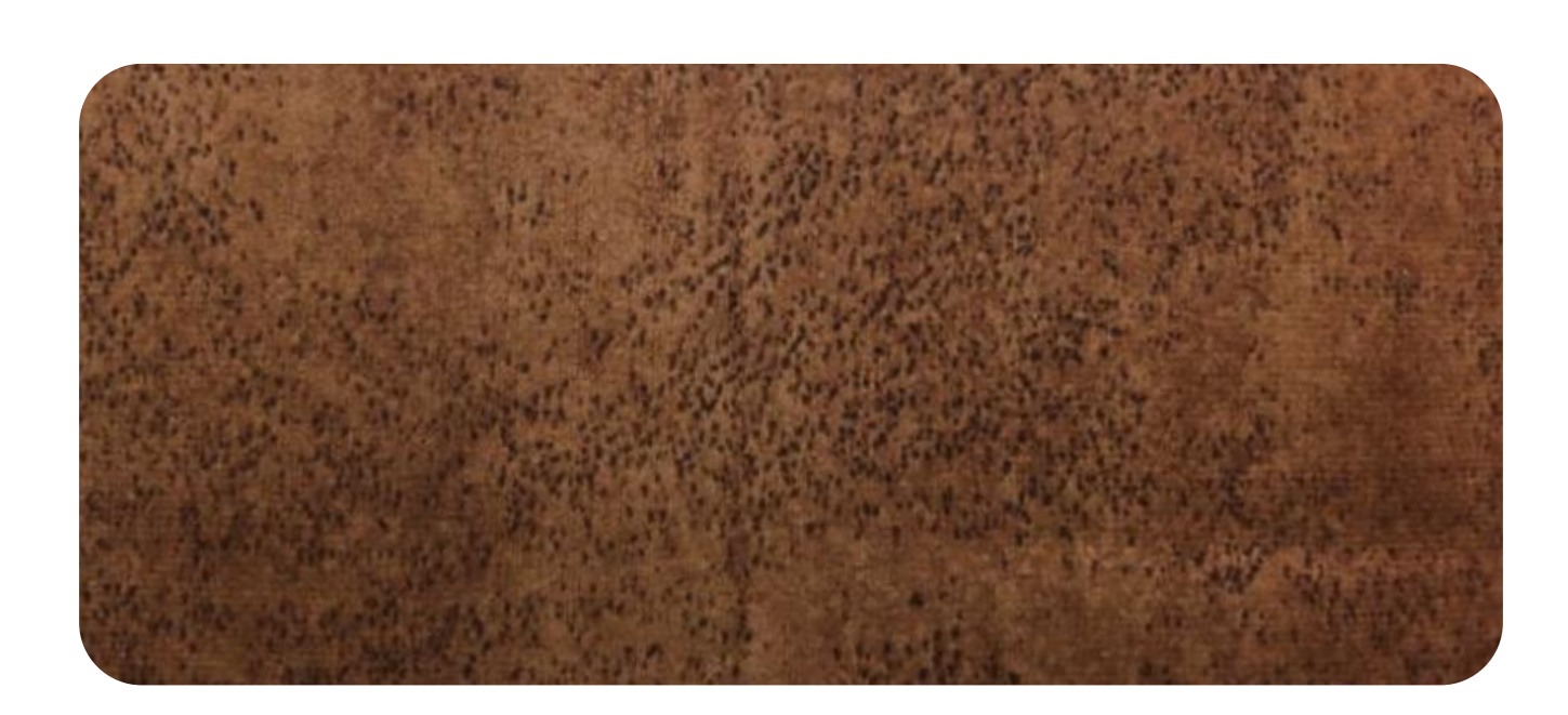
MIRACLE - 108