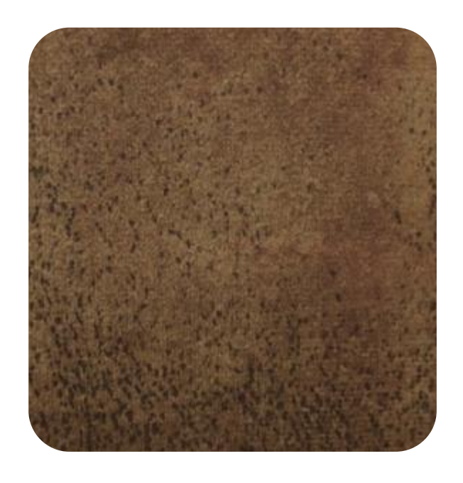
MIRACLE - 107