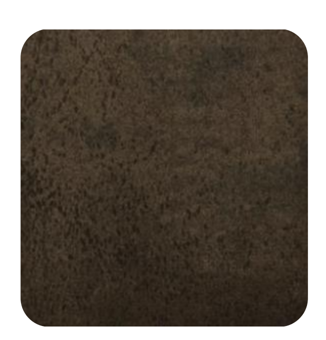
MIRACLE - 106