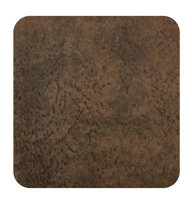
MIRACLE - 105