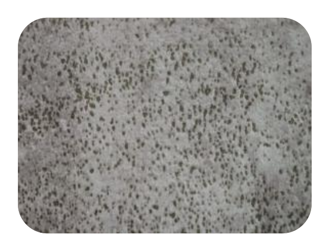
MIRACLE - 112