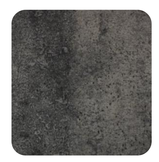
MIRACLE - 115