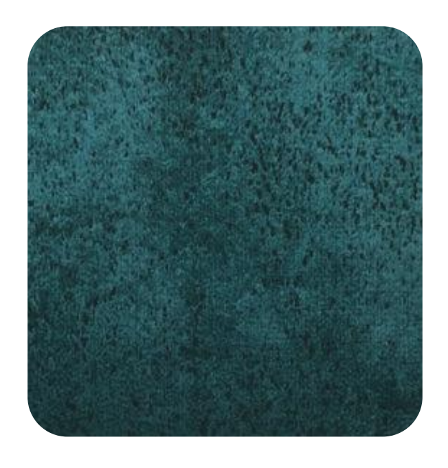
MIRACLE - 110