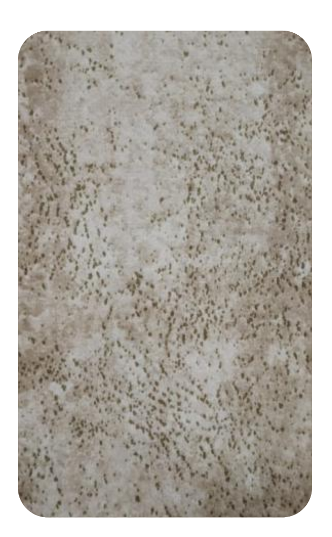
MIRACLE - 101