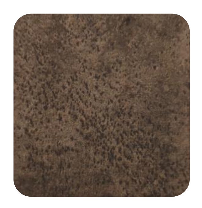
MIRACLE - 104