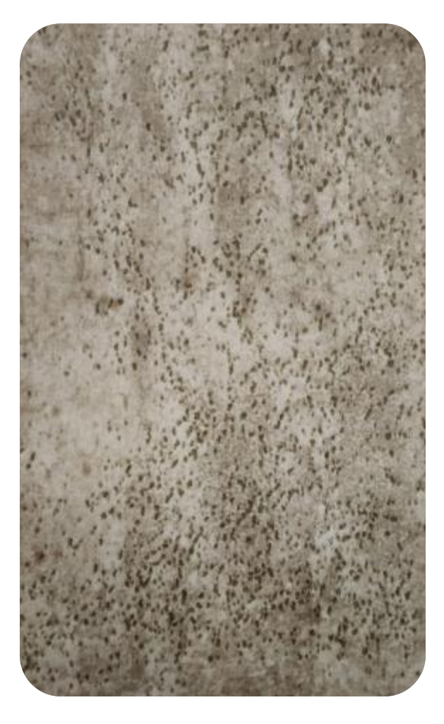
MIRACLE - 102