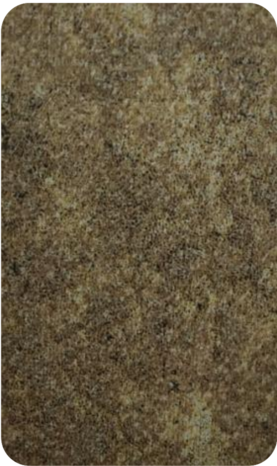
SYDNEY - 903