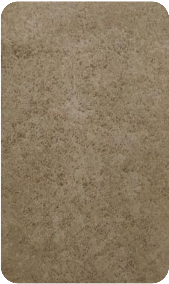
SYDNEY - 901