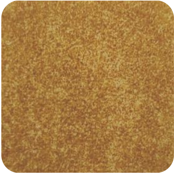
SYDNEY - 912