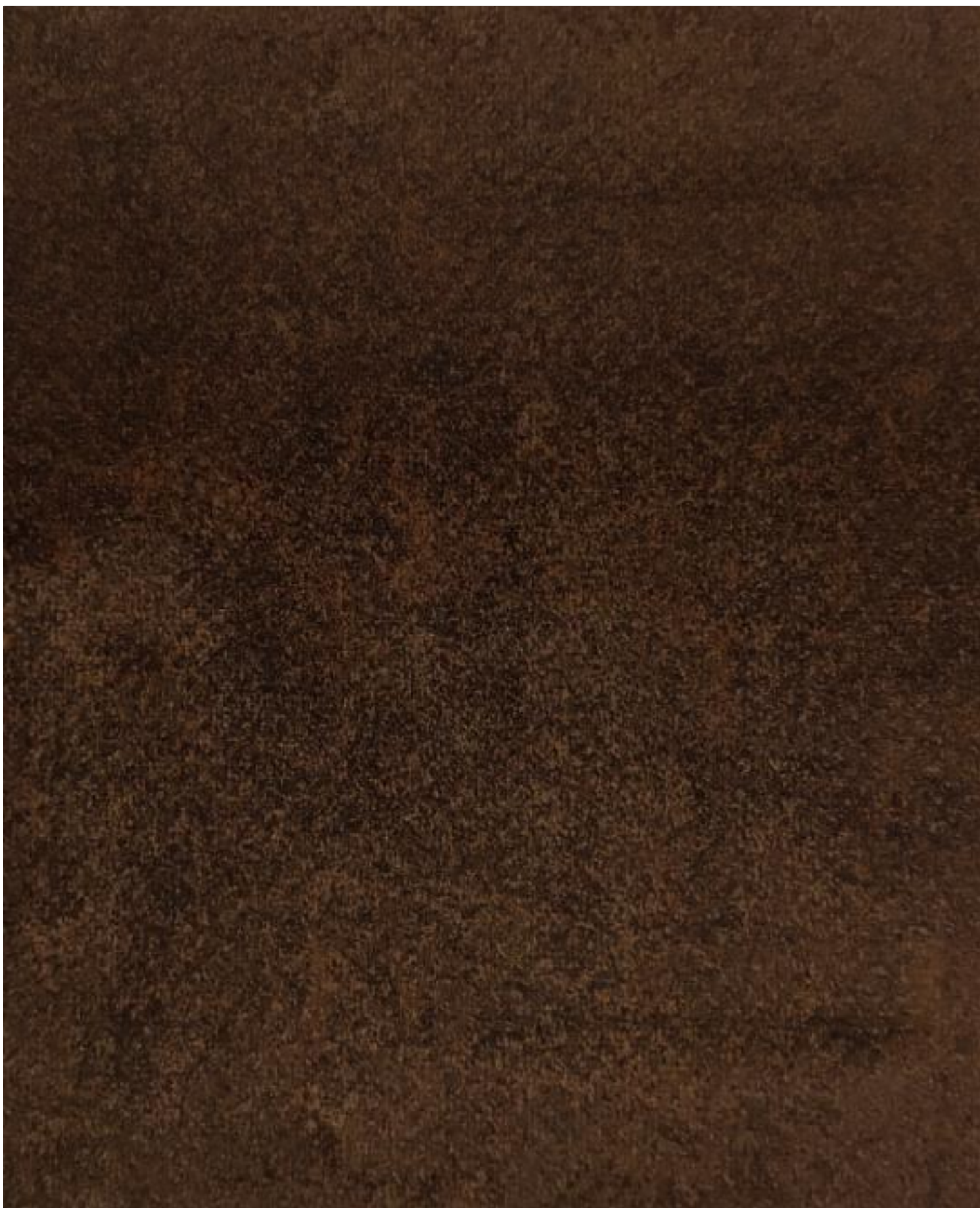
SYDNEY - 906