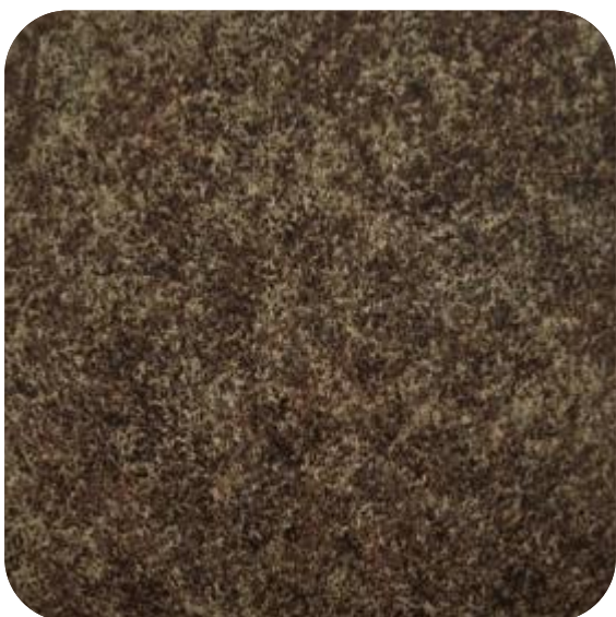
SYDNEY - 905