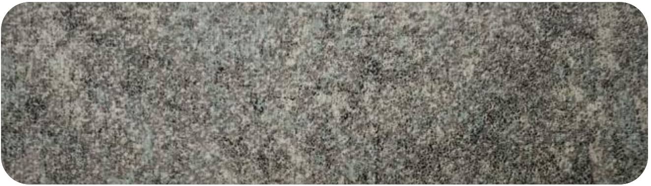
SYDNEY - 909