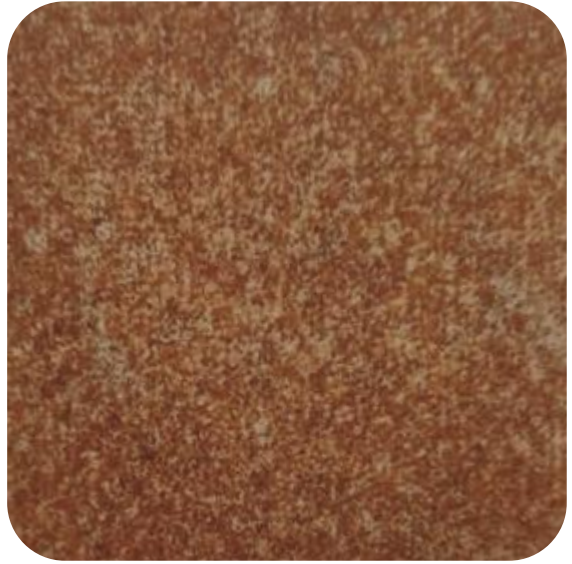
SYDNEY - 913