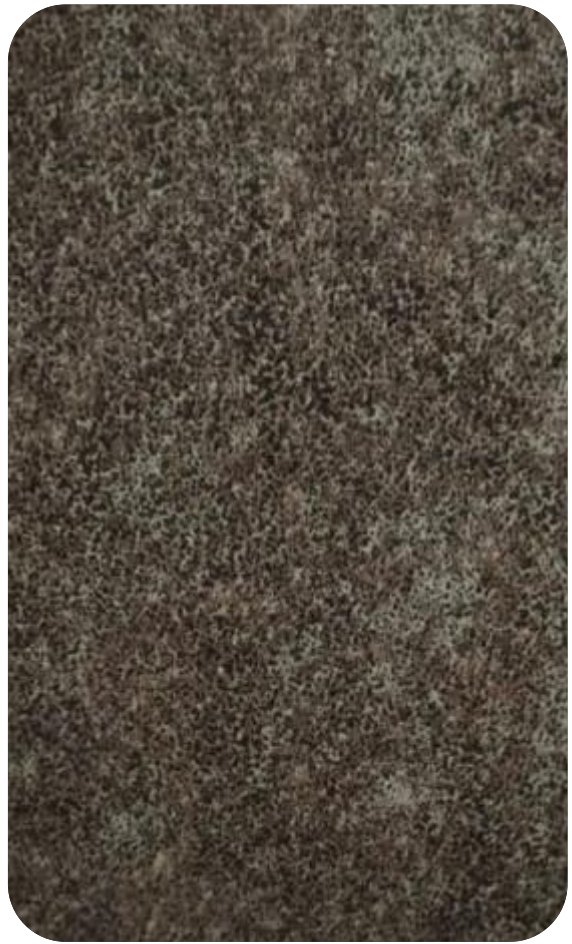
SYDNEY - 908