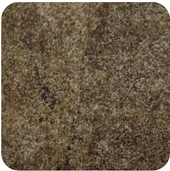
SYDNEY - 904