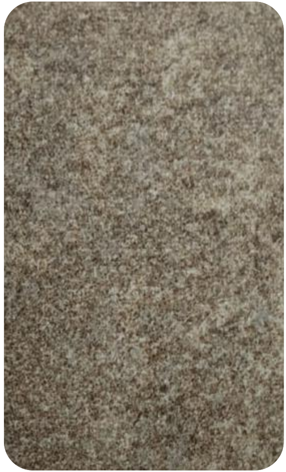
SYDNEY - 902