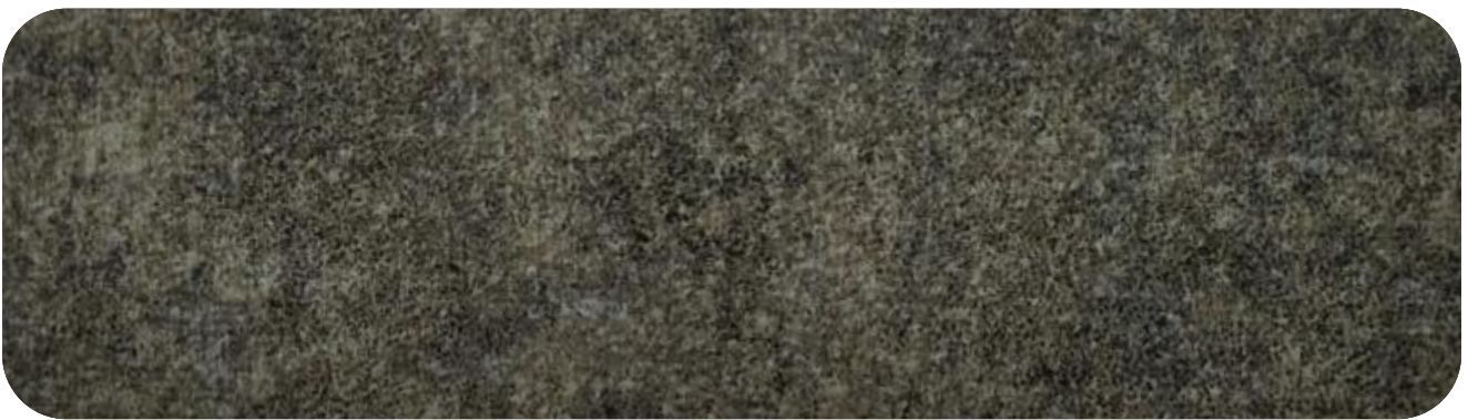
SYDNEY - 910