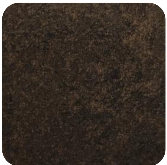
SYDNEY - 907