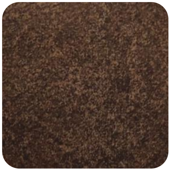
SYDNEY - 906