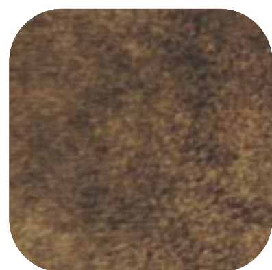
MARBLE - 707