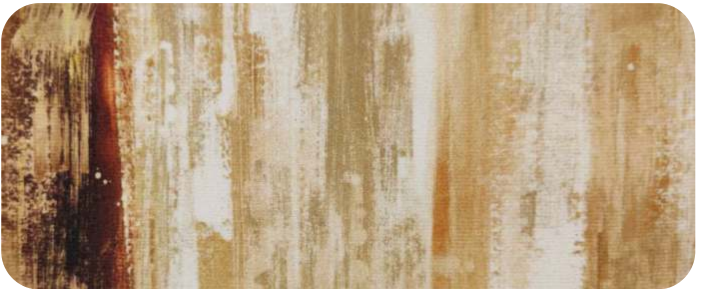
TOLEDO - 204