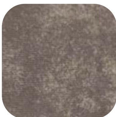
MARBLE - 728