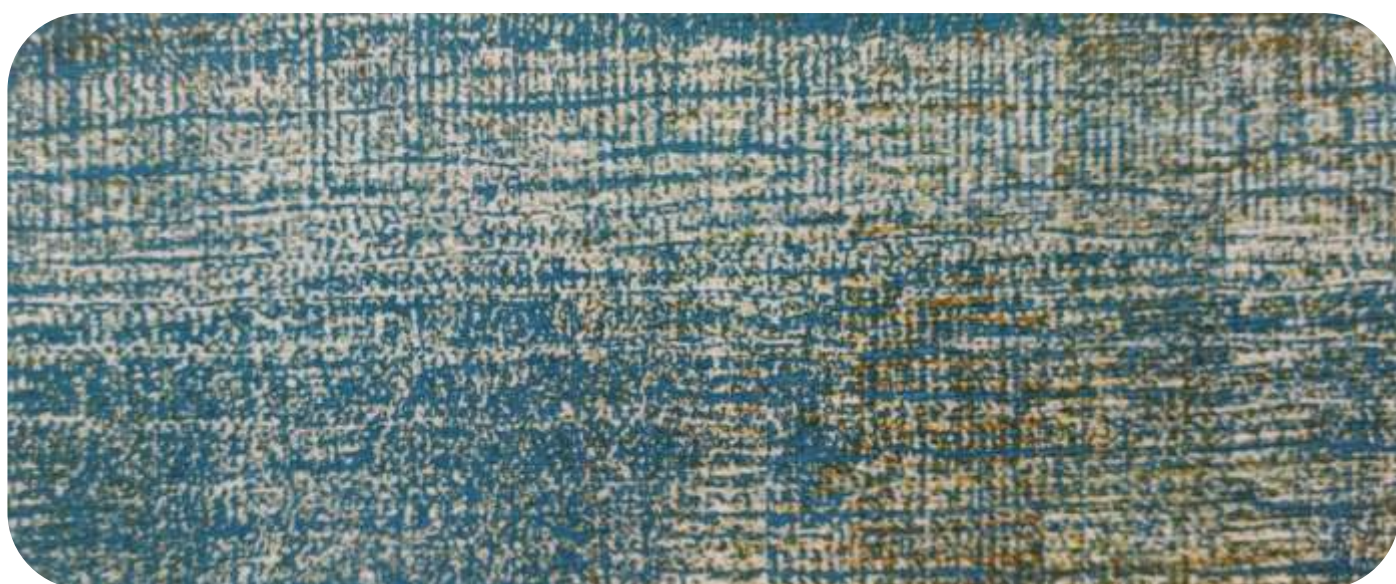
TOLEDO - 209