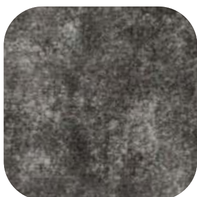
MARBLE - 733