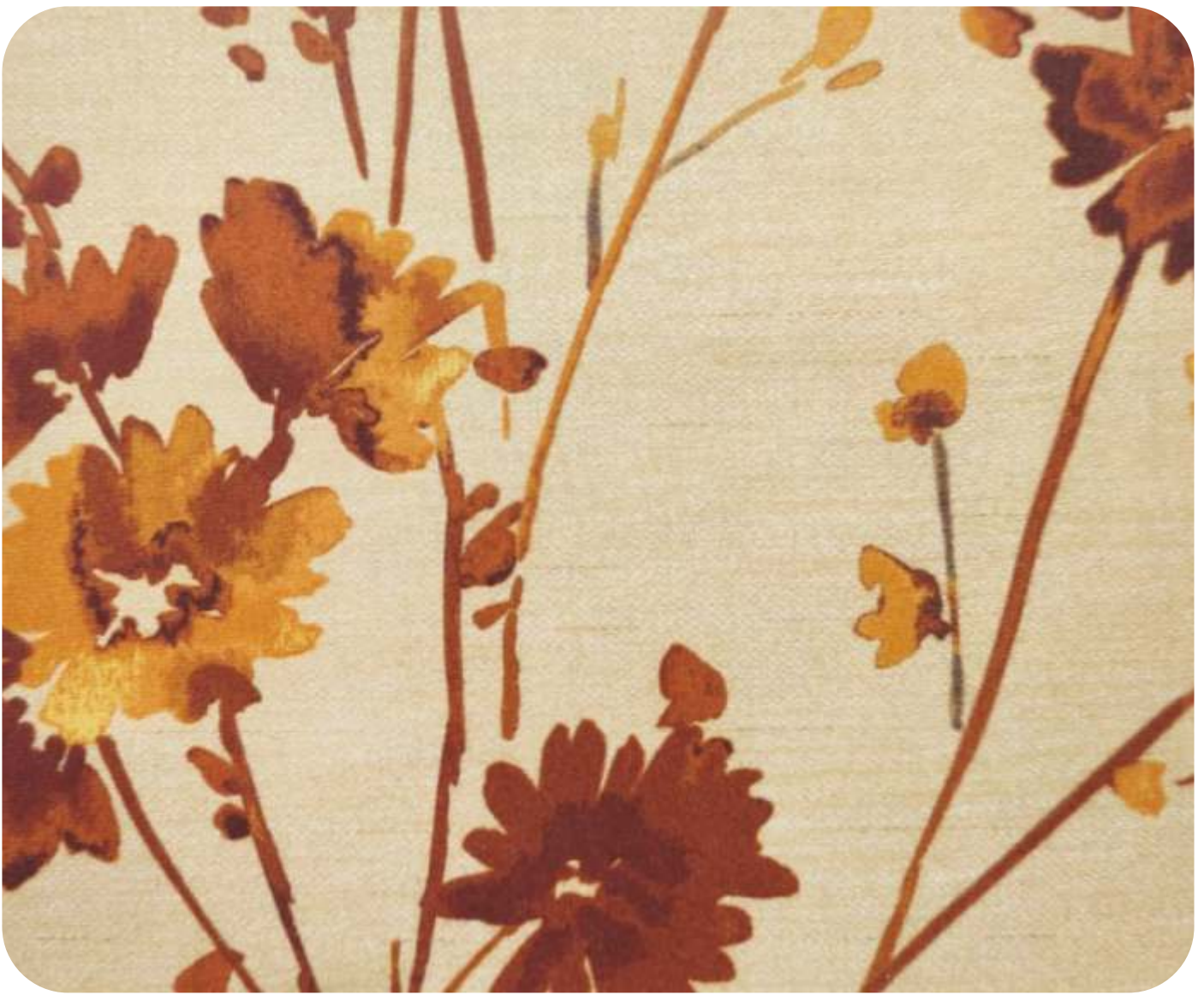
TOLEDO - 205