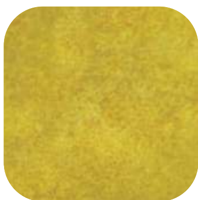
MARBLE - 719