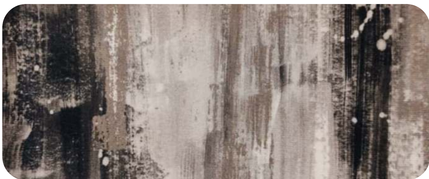
TOLEDO - 210