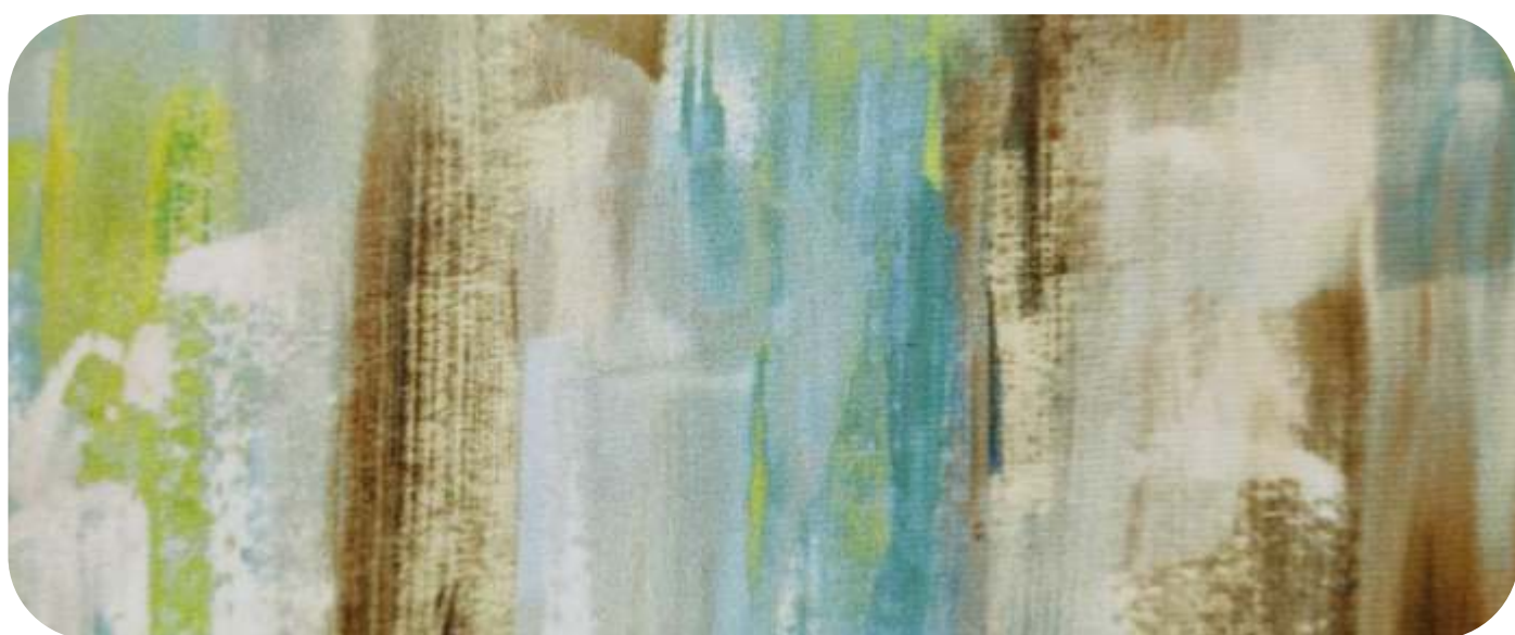
TOLEDO - 207