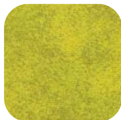
MARBLE - 720