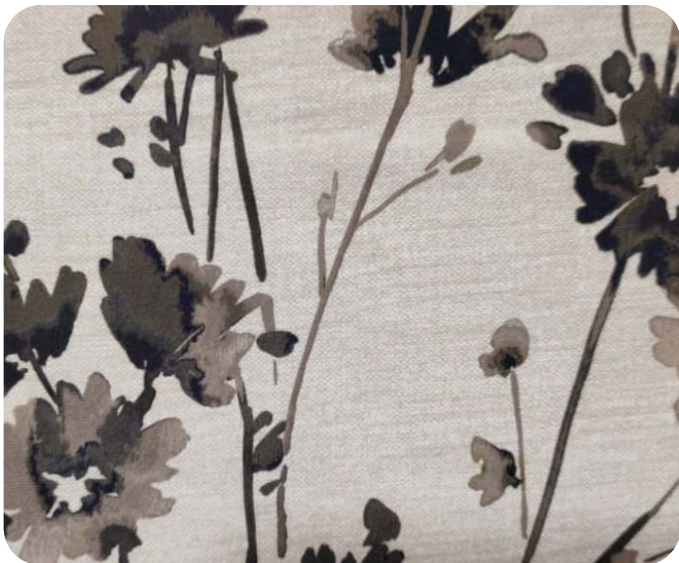
TOLEDO - 211