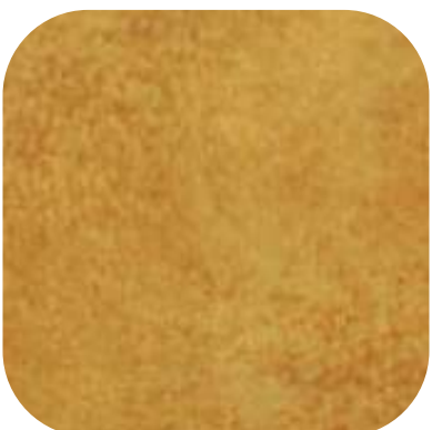
MARBLE - 716