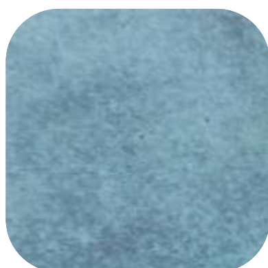
MARBLE - 722