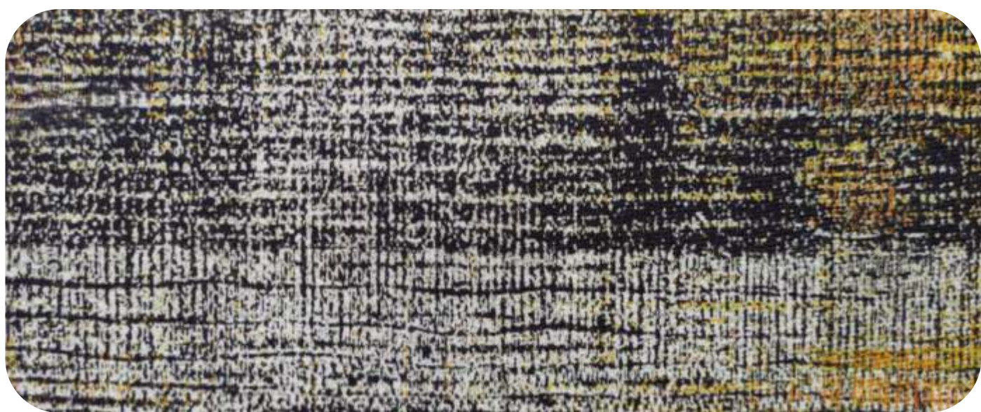
TOLEDO - 203