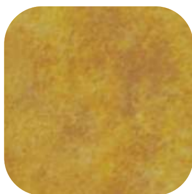
MARBLE - 717