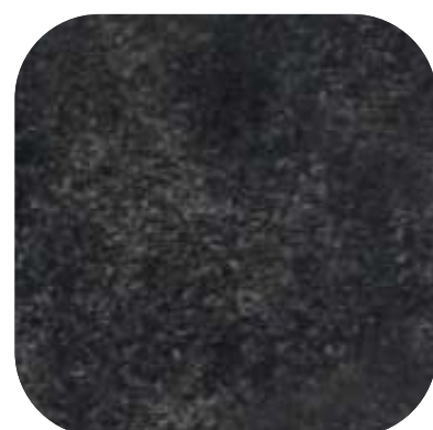
MARBLE - 734