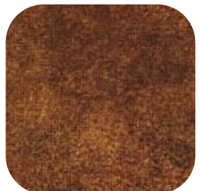
MARBLE - 712