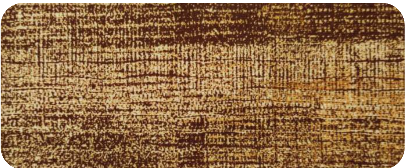
TOLEDO - 206