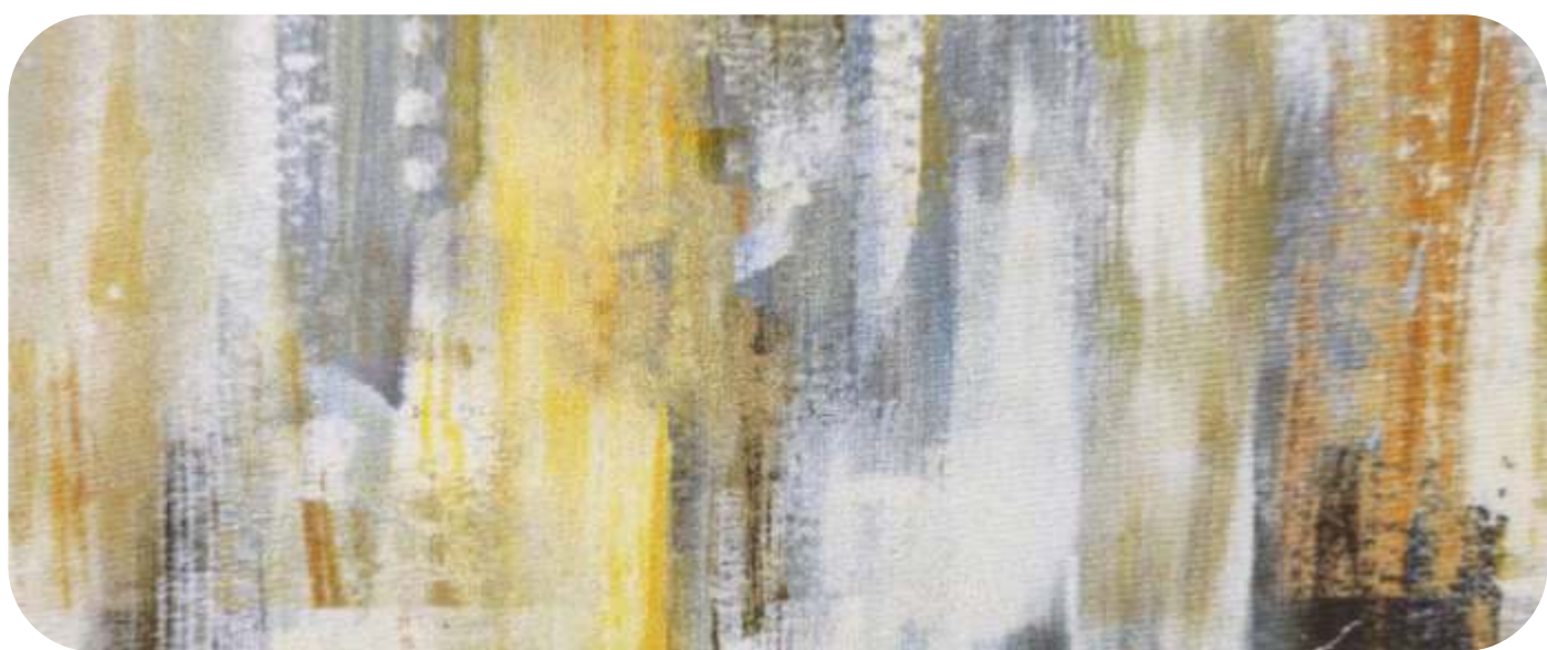
TOLEDO - 201