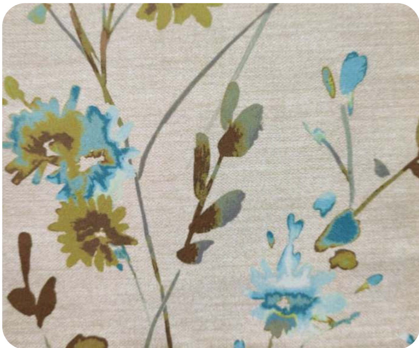
TOLEDO - 208