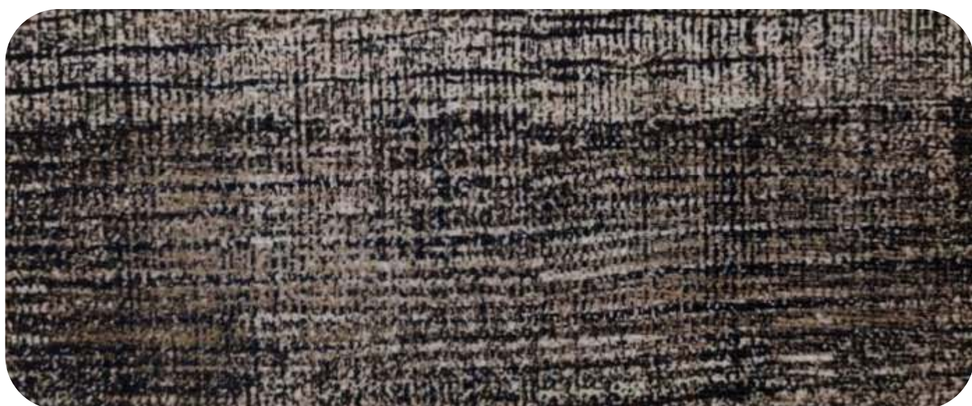
TOLEDO - 212