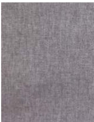
ASABA - 726