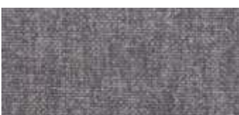
ASABA - 727