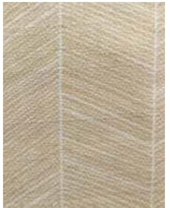
ONELLA - 508