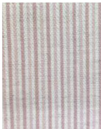
ONELLA - 406