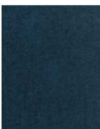
ASABA - 734