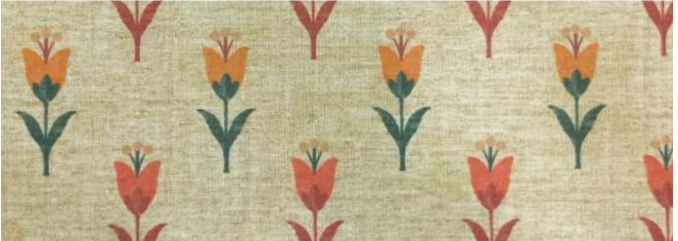
UDAIPUR - 206