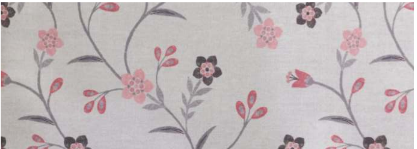
UDAIPUR - 302