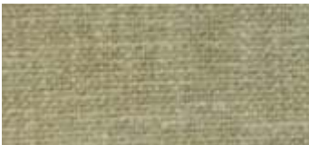
ROYAL - 533