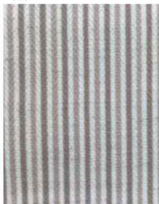
ONELLA - 403