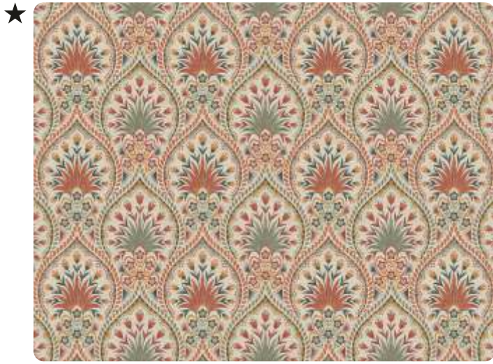
UDAIPUR | 101 TO 106

WIDTH : 140 CMS GSM : 330 V-REPEAT : 32 CMS H-REPEAT : 34.26 CMS COMPOSITION : 100% POLYESTER MARTINDALE : 30,000 COLOUR FASTNESS TO LIGHT : 4-5 WASHING INSTRUCTION : END USE : Upholstery & Loose Cushion