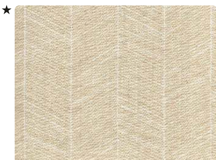
ONELLA | 501 TO 513

WIDTH : 142 CMS GSM : 390 V-REPEAT : STRIPE H-REPEAT : 1 CMS COMPOSITION : 96%PL, 4%LI MARTINDALE : 1,00,000 COLOUR FASTNESS TO LIGHT : N\A WASHING INSTRUCTION : END USE : Upholstery & Curtain