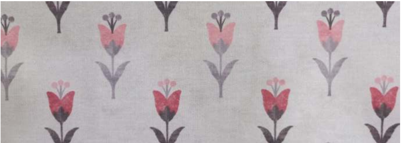
UDAIPUR - 202