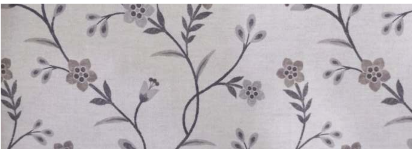
UDAIPUR - 304