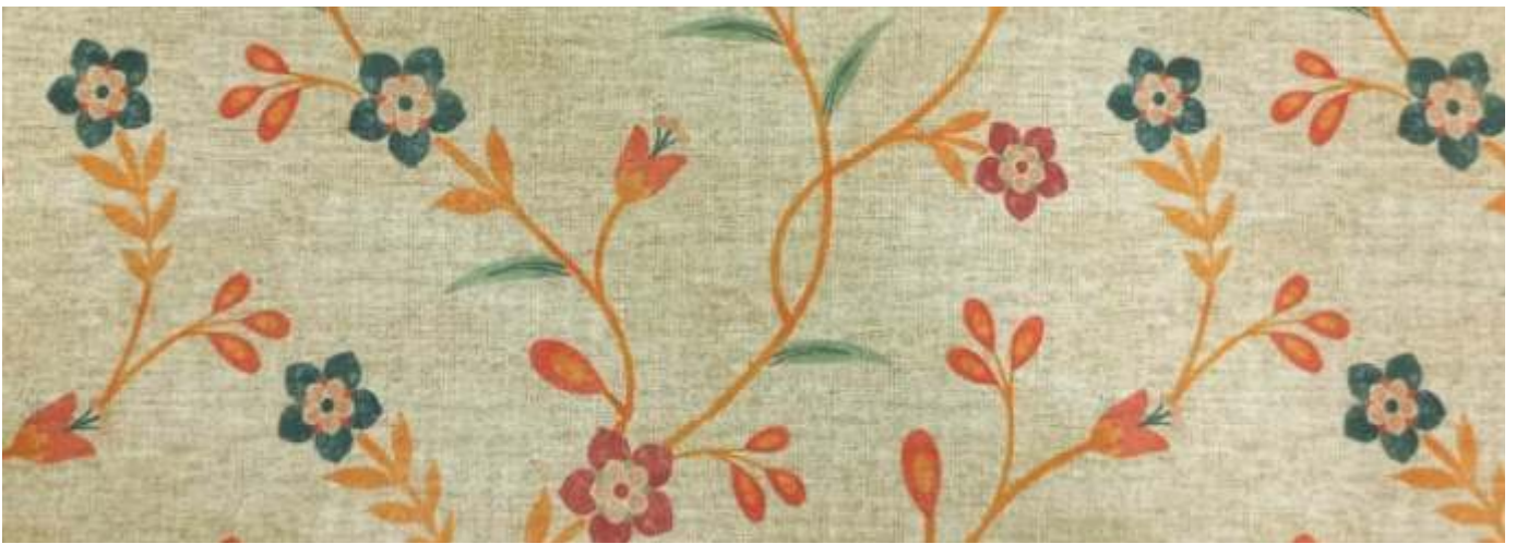
UDAIPUR - 306