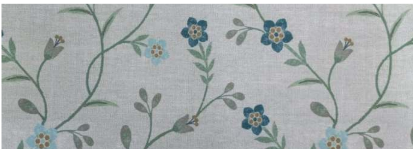
UDAIPUR - 301