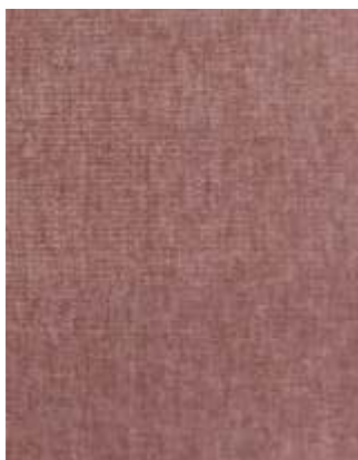
ASABA - 735