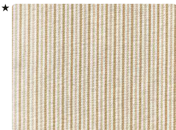
ONELLA | 401 TO 413

WIDTH : 140 CMS GSM : 330 V-REPEAT : 25.4 H-REPEAT : 22.86 CMS COMPOSITION : 100% POLYESTER MARTINDALE : 30,000 COLOUR FASTNESS TO LIGHT : 4-5 WASHING INSTRUCTION : END USE : Upholstery & Loose Cushion