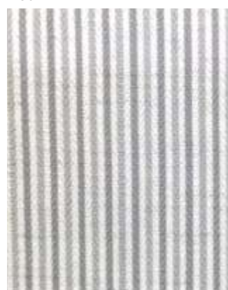
ONELLA - 412