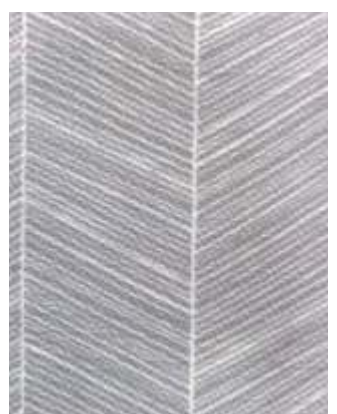
ONELLA - 512