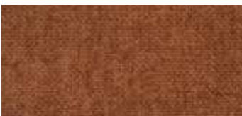
ASABA - 713