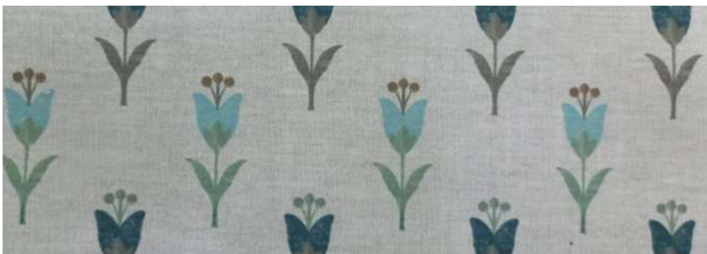
UDAIPUR - 201