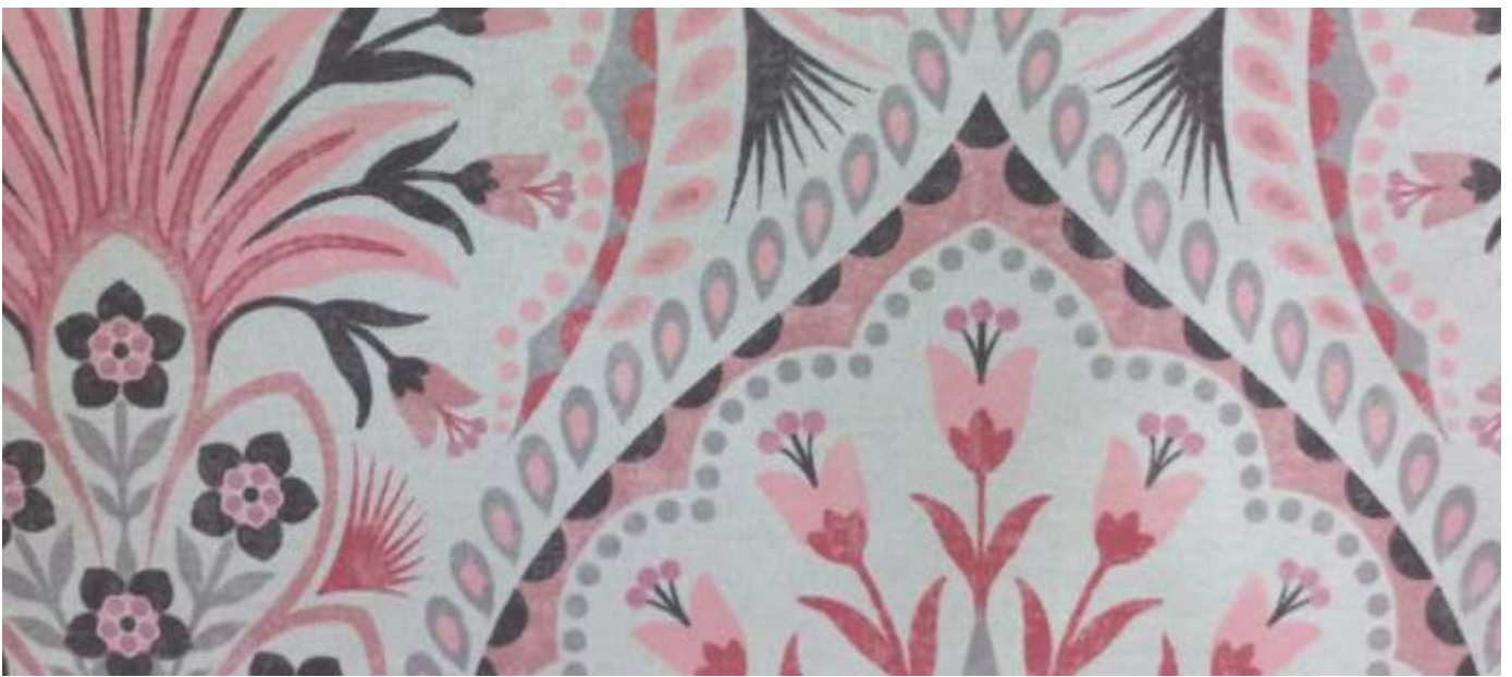
UDAIPUR - 102