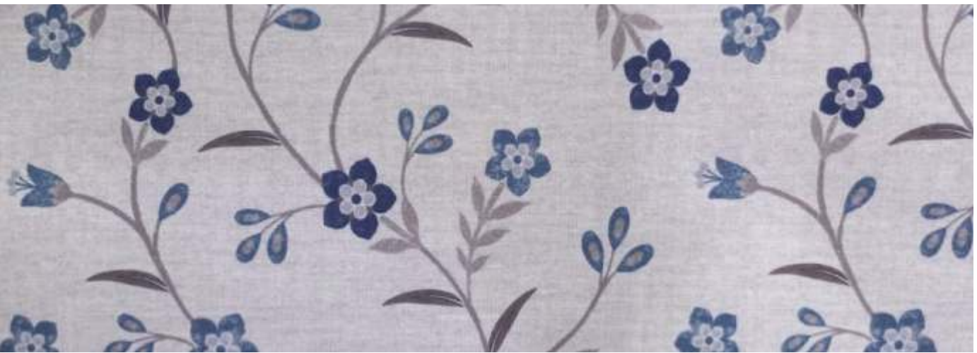
UDAIPUR - 303