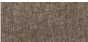
ASABA - 705