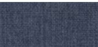
LENKA - 718