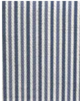
ONELLA - 413