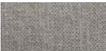
LENKA - 722