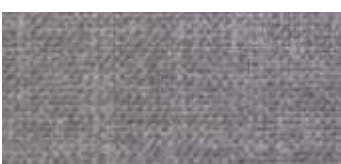
LENKA - 726