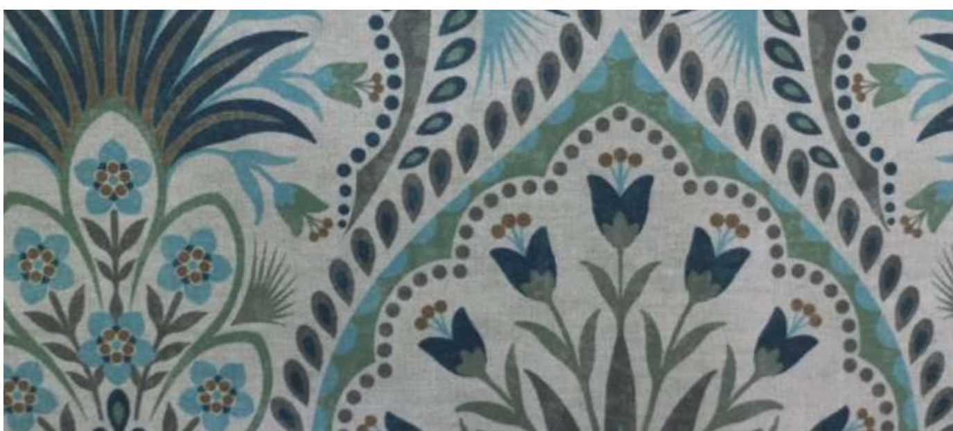
UDAIPUR - 101