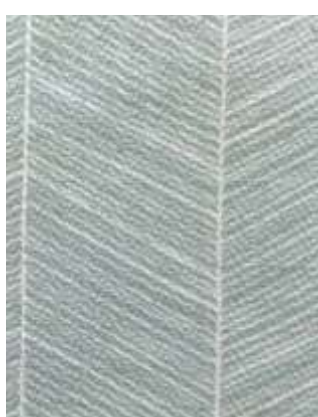
ONELLA - 509