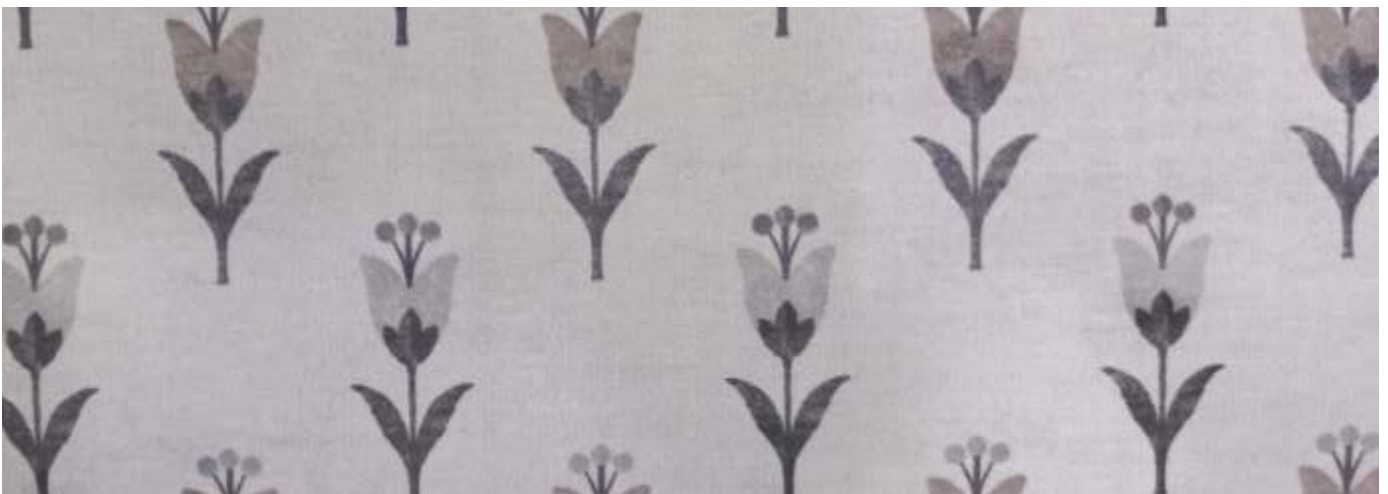
UDAIPUR - 204