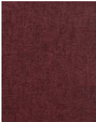
ASABA - 711