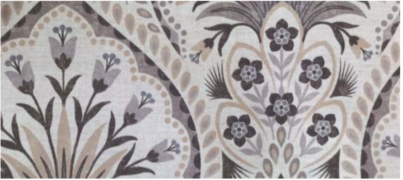
UDAIPUR - 105