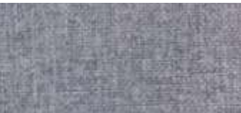
ASABA - 720