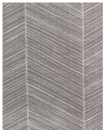
ONELLA - 503