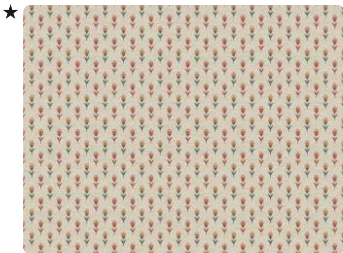
UDAIPUR | 201 TO 206

WIDTH : 140 CMS GSM : 330 V-REPEAT : 32 CMS H-REPEAT : 34.26 CMS COMPOSITION : 100% POLYESTER MARTINDALE : 30,000 COLOUR FASTNESS TO LIGHT : 4-5 WASHING INSTRUCTION : END USE : Upholstery & Loose Cushion