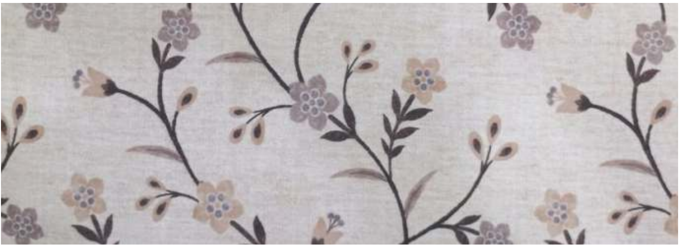
UDAIPUR - 305