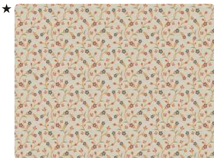
UDAIPUR | 301 TO 306

WIDTH : 140 CMS GSM : 330 V-REPEAT : 32 CMS H-REPEAT : 34.24 CMS COMPOSITION : 100% POLYESTER MARTINDALE : 30,000 COLOUR FASTNESS TO LIGHT : 4-5 WASHING INSTRUCTION : END USE : Upholstery & Loose Cushion