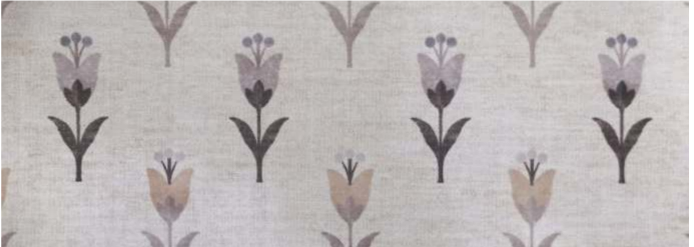
UDAIPUR - 205