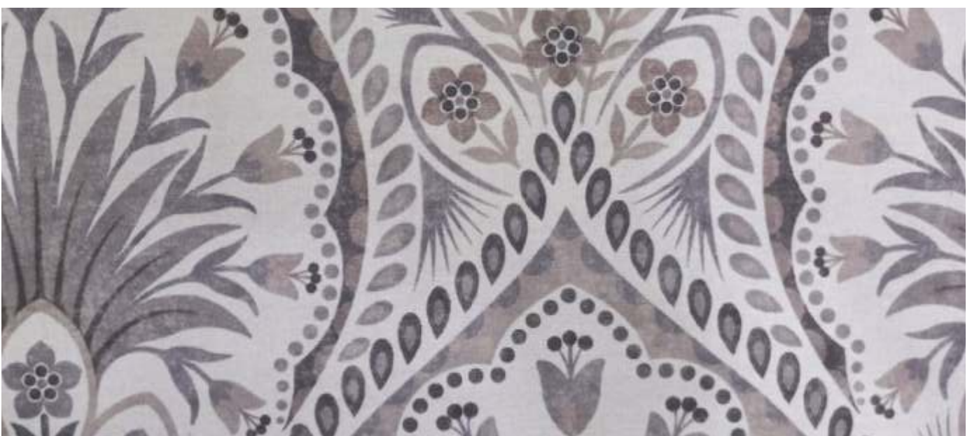
UDAIPUR - 104

Our collection is Perfect for channelling A classic heritage look With contemporary Touch in your home or Commercial space. This quality fabric is Crafted from the fine Quality yarns, Making it perfect for Upholstery treatment.