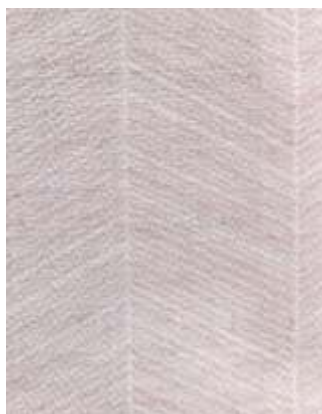
ONELLA - 506