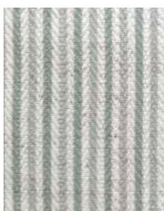
ONELLA - 409