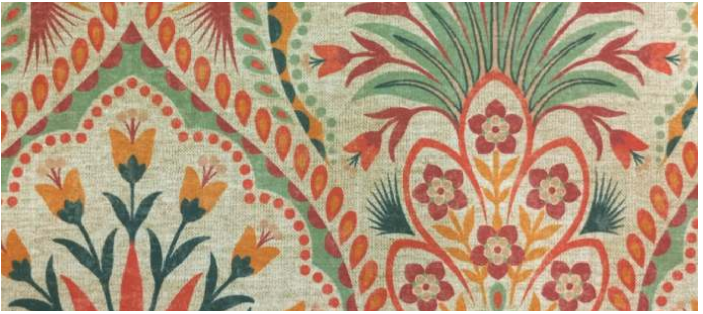
UDAIPUR - 106