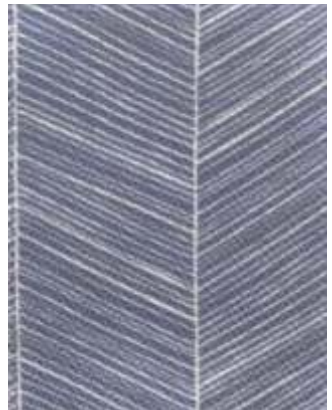
ONELLA - 513