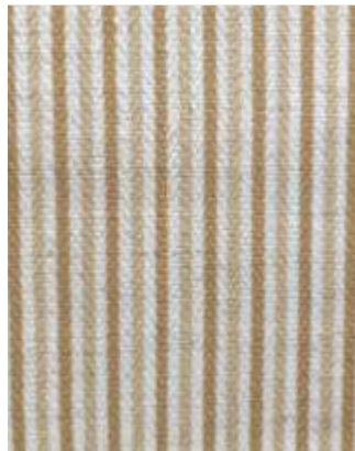
ONELLA - 408