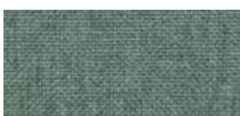
ASABA - 721