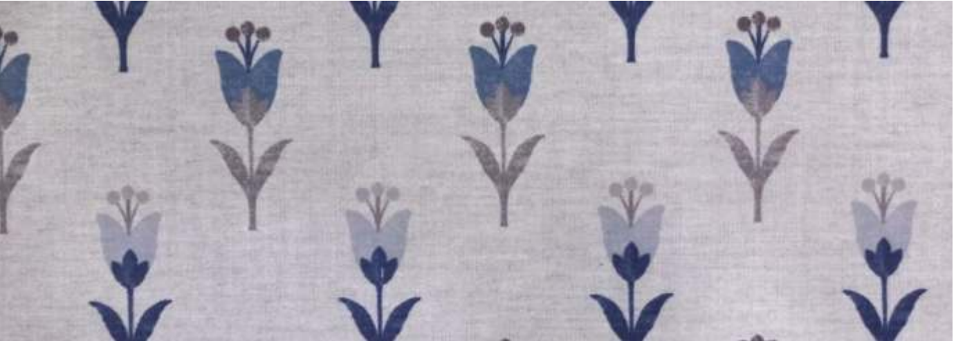
UDAIPUR - 203