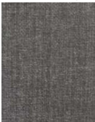
LENKA - 723