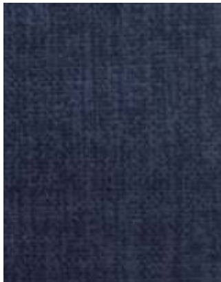
LENKA - 719