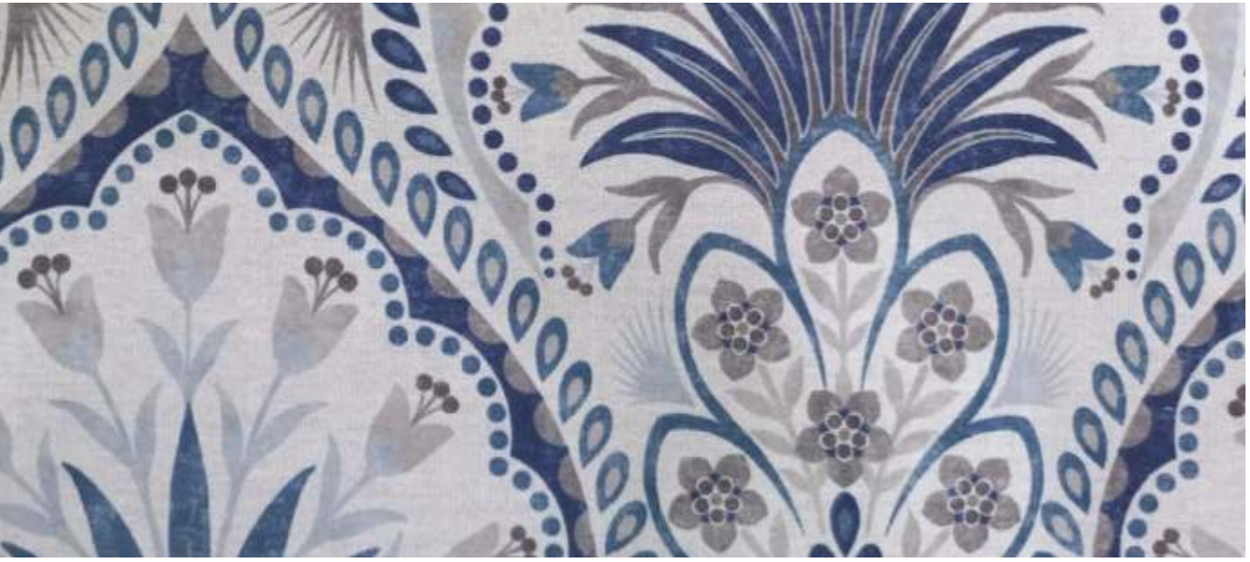
UDAIPUR - 103