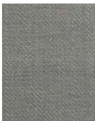
ALESIA - 720