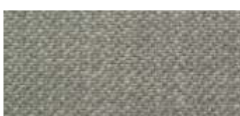
ALESIA - 723