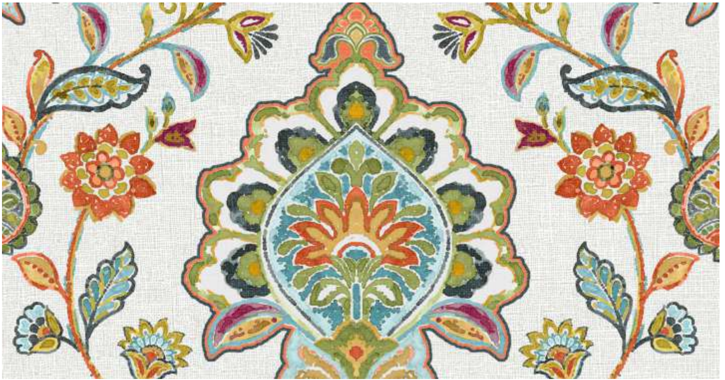
Please turn over for design