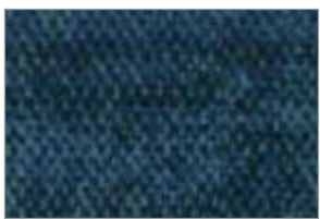
IBIZA | 755