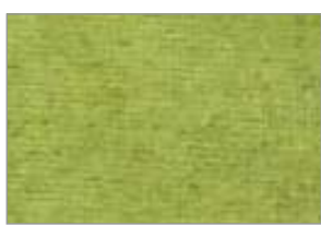
MARBLE | 721