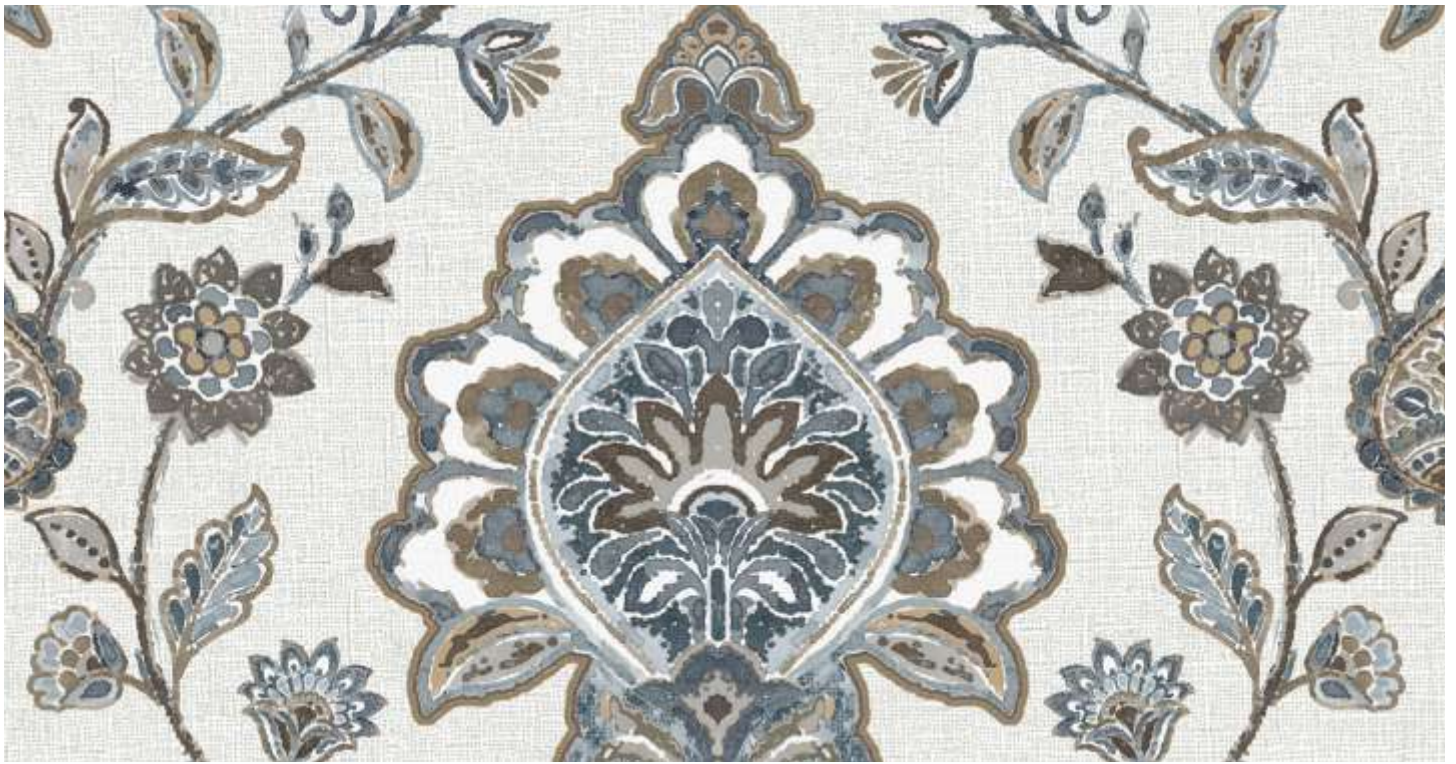
Please turn over for design