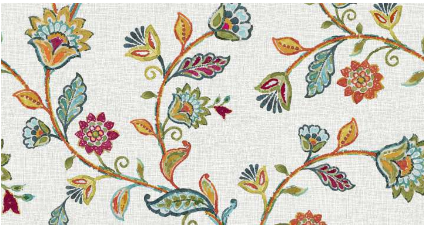
Please turn over for design