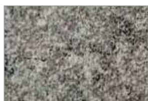
SYDNEY | 909