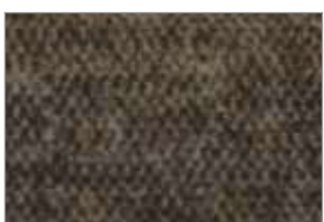
IBIZA | 767