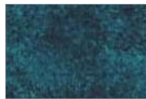
MARBLE | 725