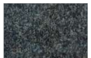
SYDNEY | 911