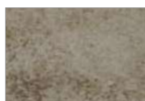
MARBLE | 729