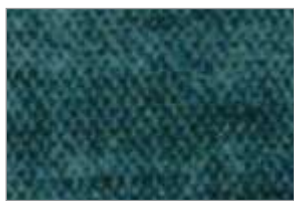
IBIZA | 759