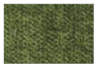
BRONX | 914