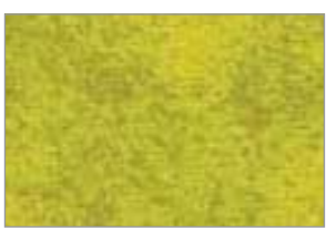
MARBLE | 720