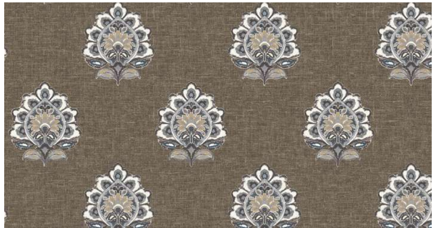
Please turn over for design