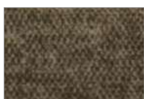
IBIZA | 764