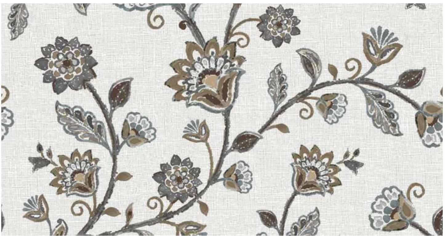
Please turn over for design