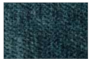
BRONX | 913