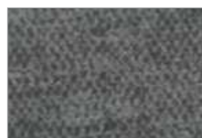
IBIZA | 778