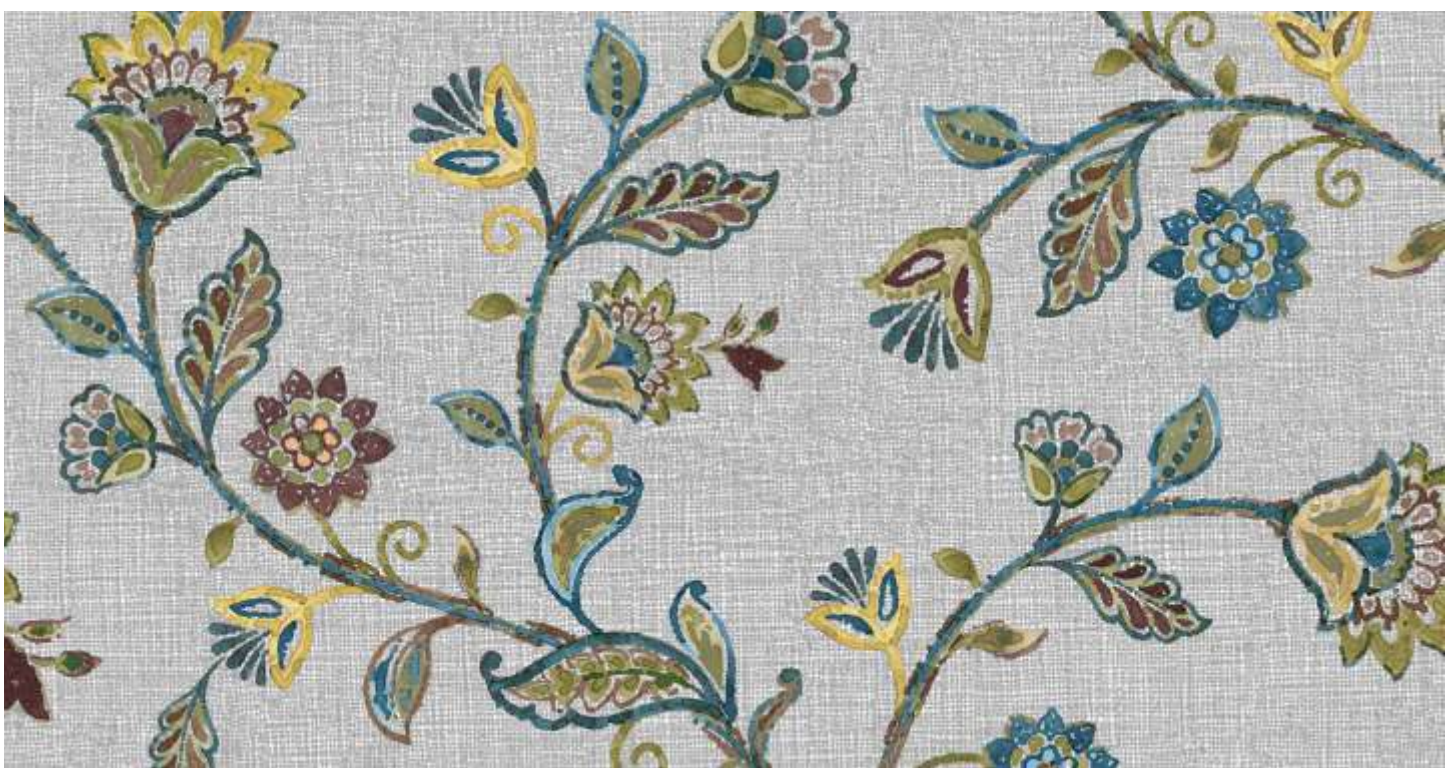
Please turn over for design