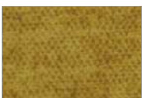
IBIZA | 729