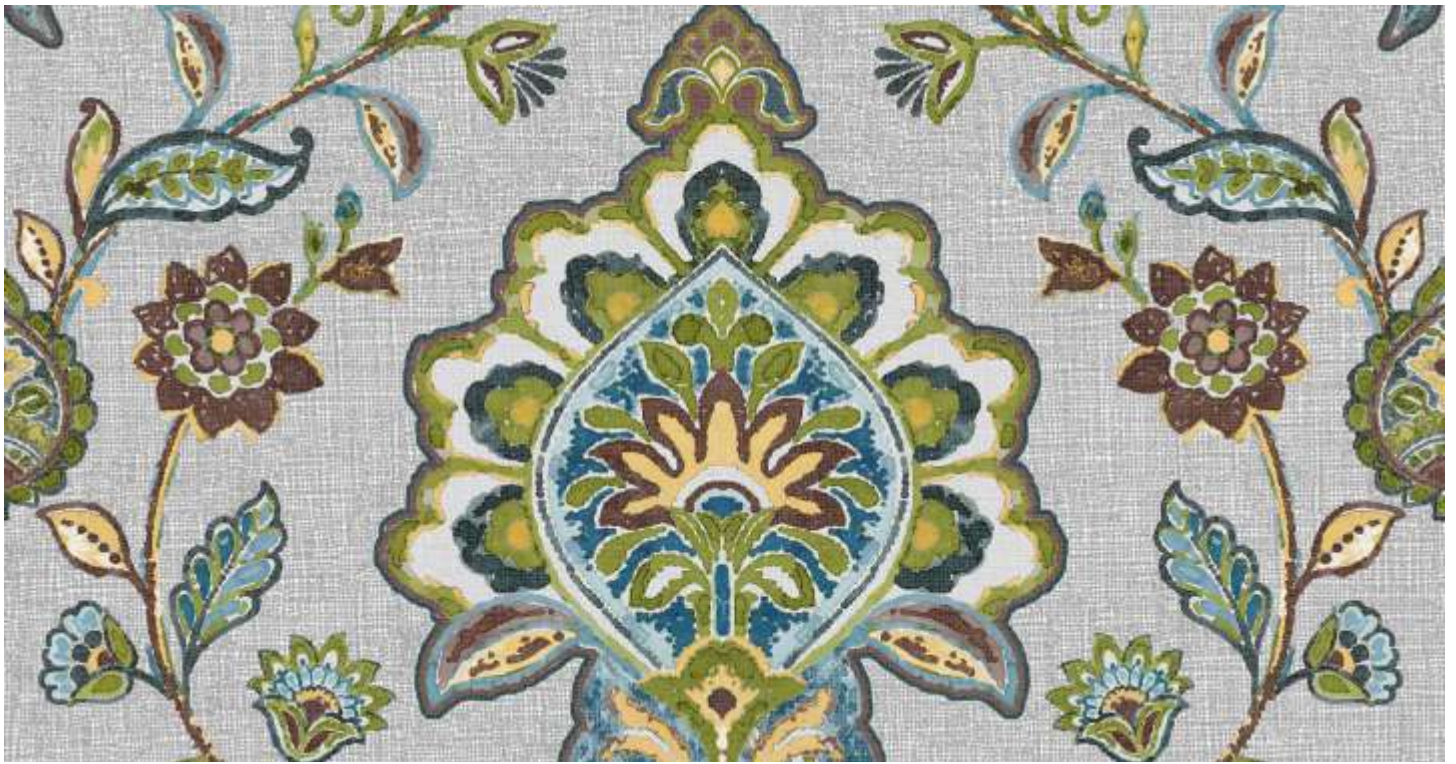
Please turn over for design