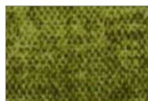
IBIZA | 728