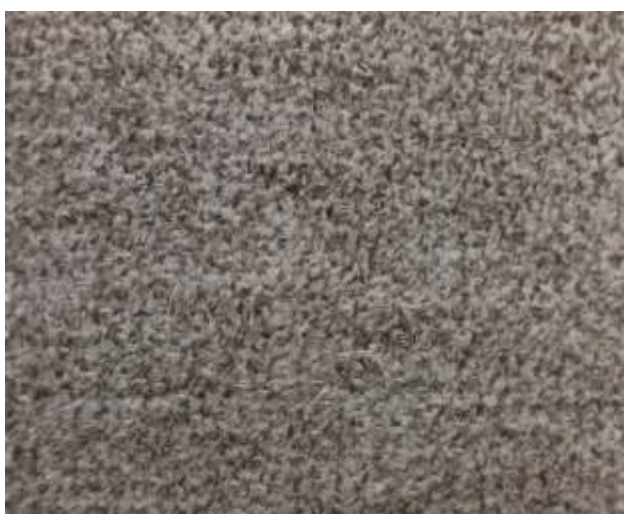
AMBIANT | 904