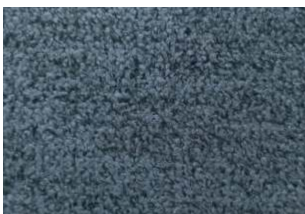
AMBIANT | 912