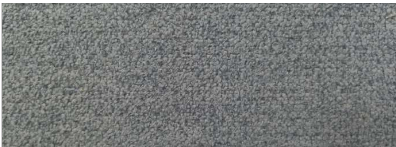
AMBIANT | 919