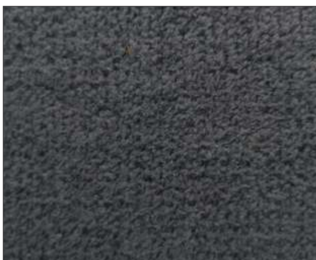
AMBIANT | 920