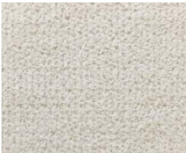
AMBIANT | 902