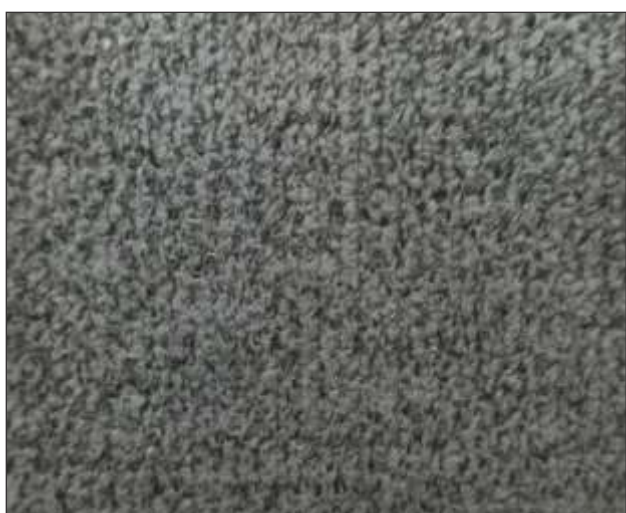
AMBIANT | 918