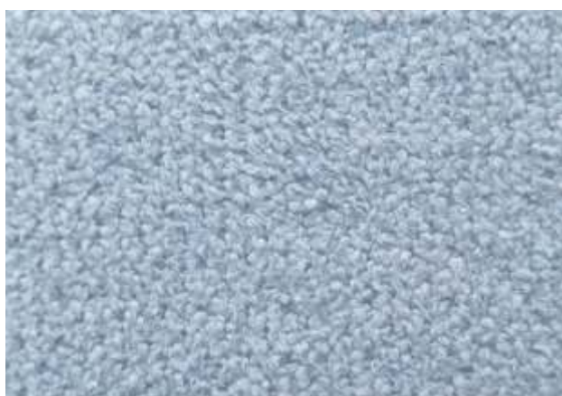
AMBIANT | 911