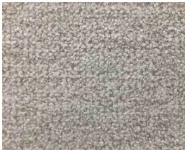
AMBIANT | 914