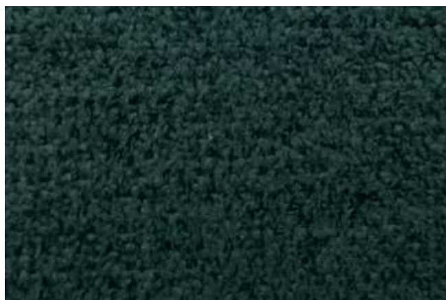
AMBIANT | 909