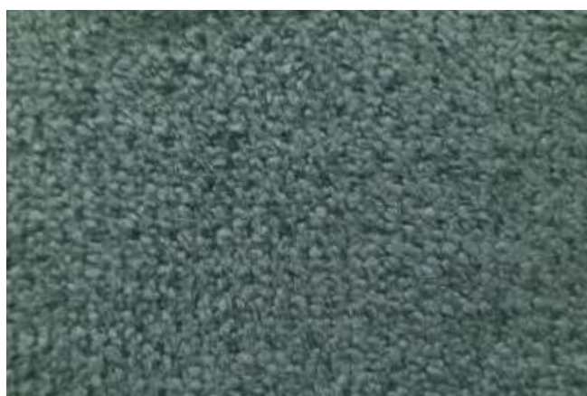
AMBIANT | 908