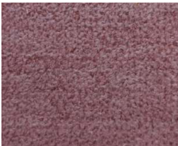
AMBIANT | 906