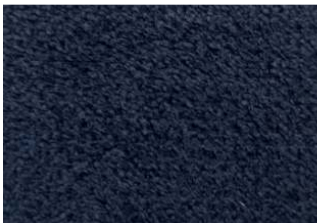
AMBIANT | 913