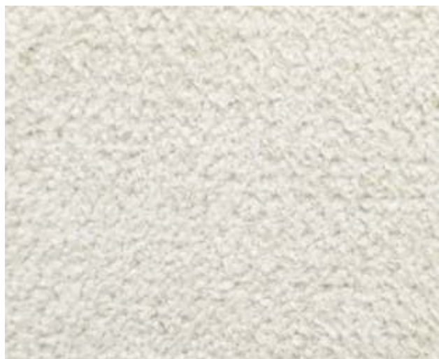
AMBIANT | 901