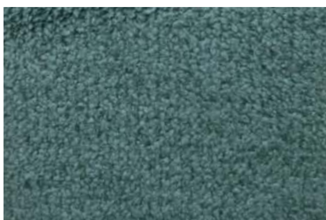
AMBIANT | 910