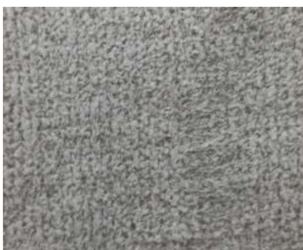
AMBIANT | 917