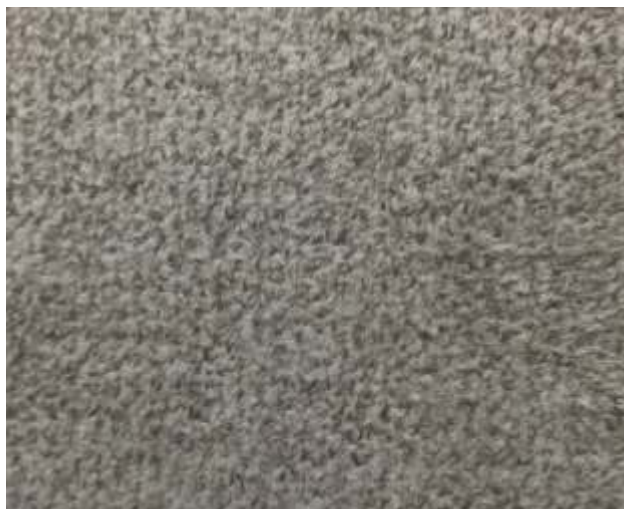
AMBIANT | 915