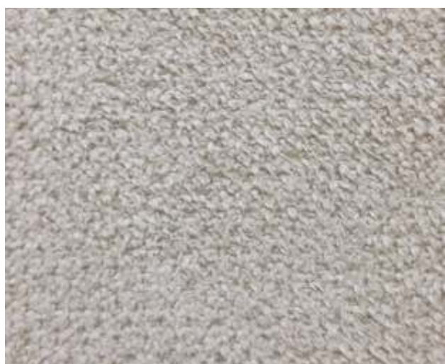
AMBIANT | 903