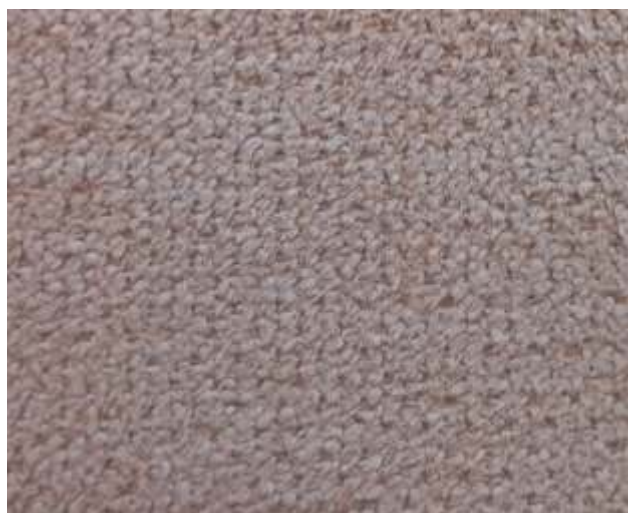
AMBIANT | 905