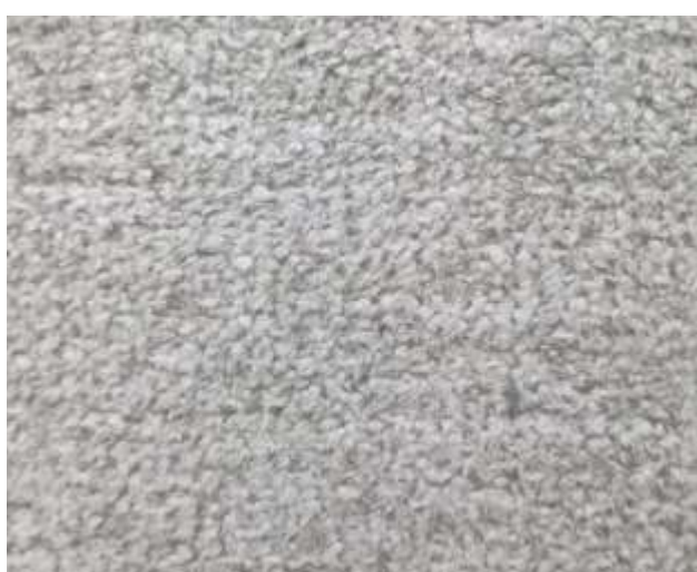
AMBIANT | 916