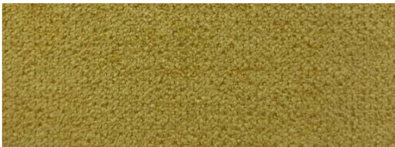
AMBIANT | 907