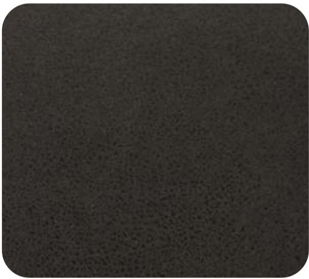
APACHE - 915