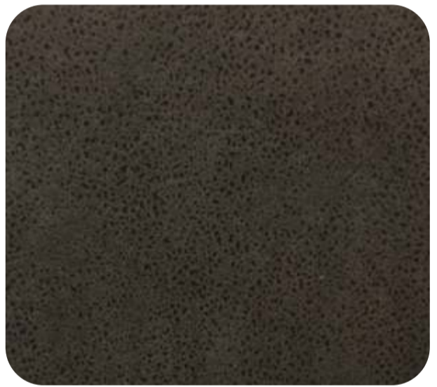
APACHE - 914