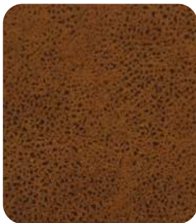
APACHE - 909