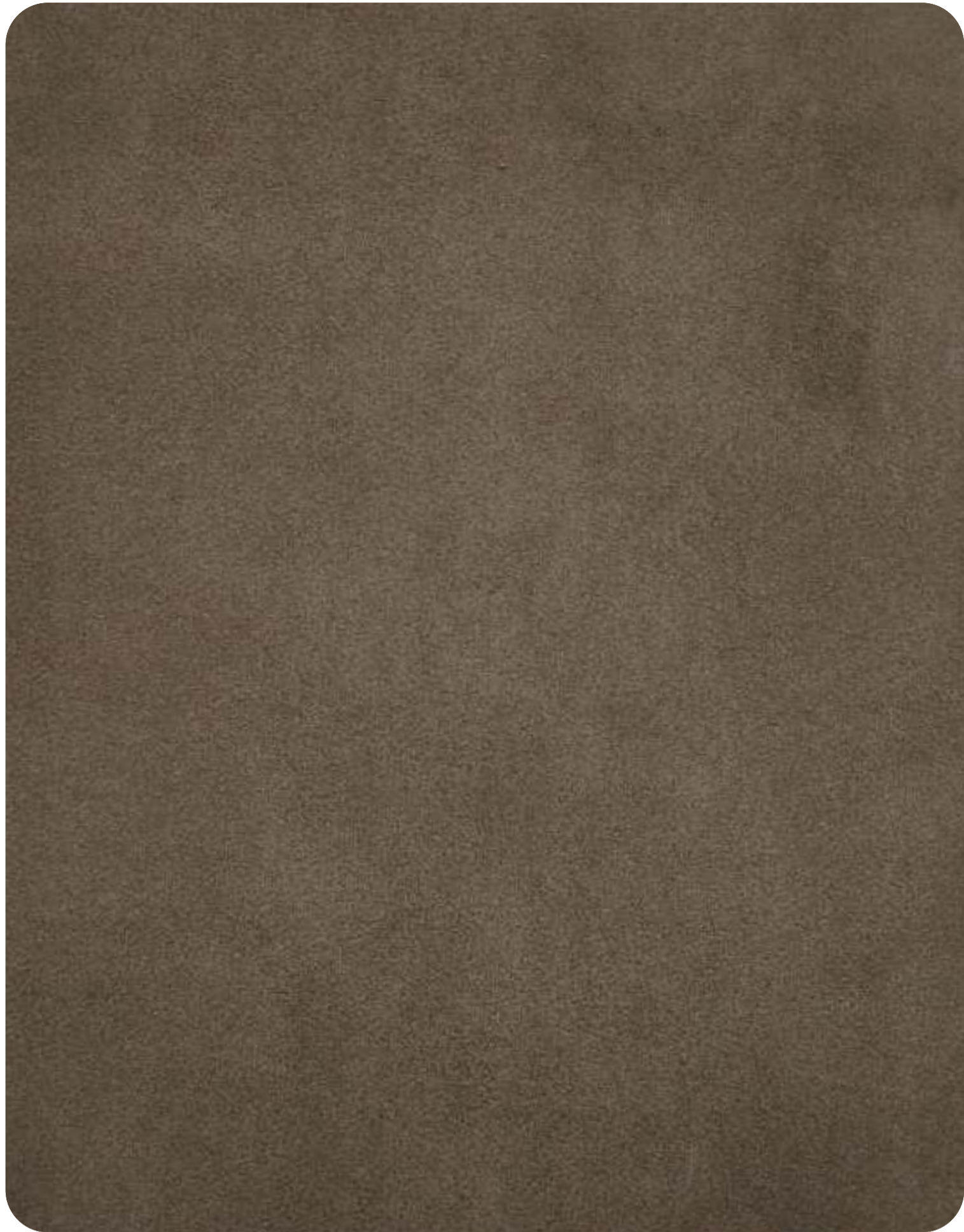
APACHE - 905