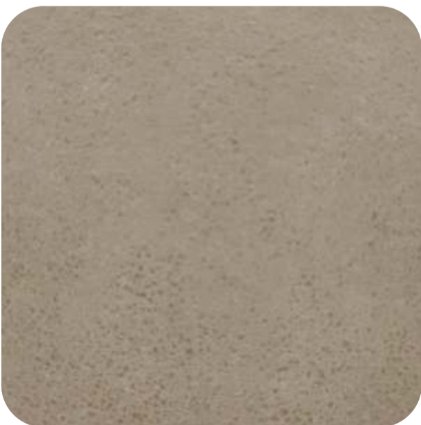
APACHE - 902