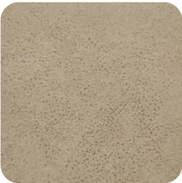
APACHE - 903