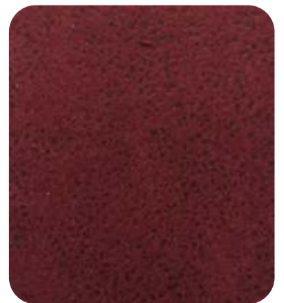
APACHE - 910