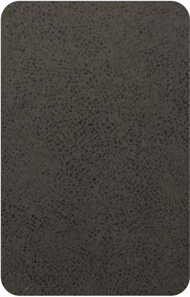
APACHE - 913