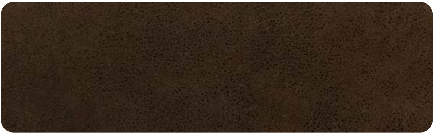
APACHE - 907