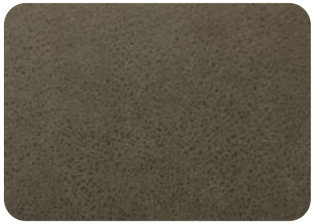
APACHE - 912