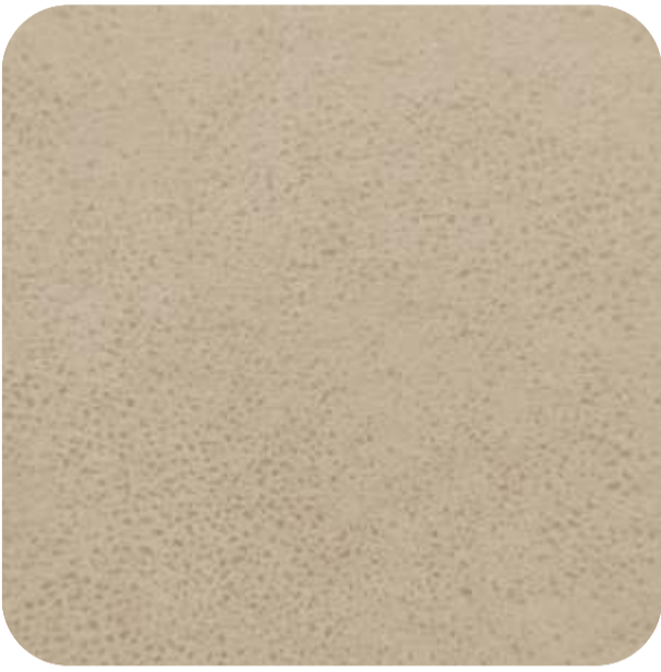
APACHE - 901