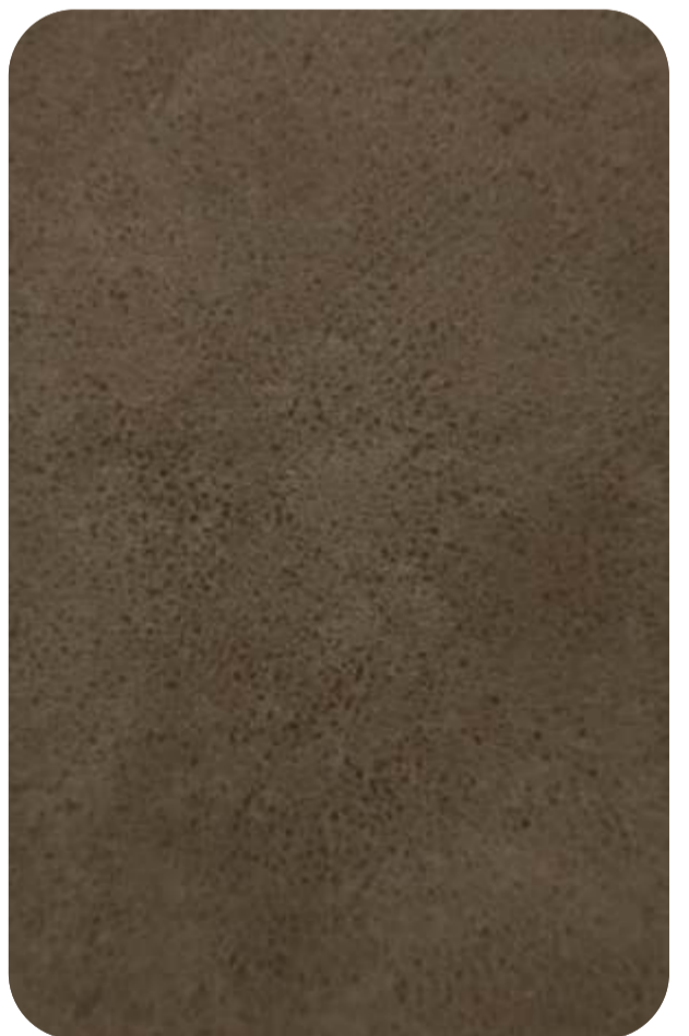
APACHE - 905