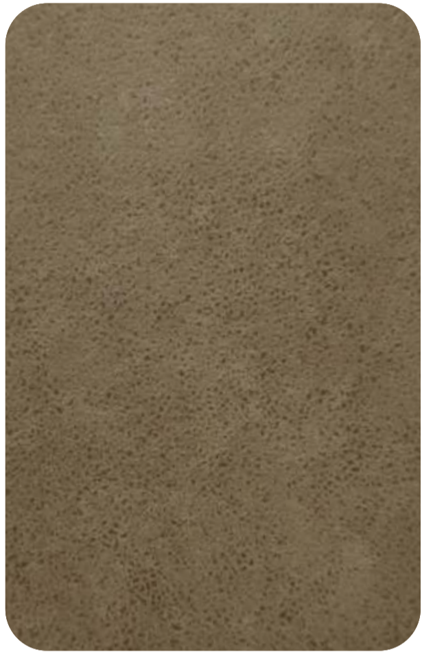
APACHE - 904