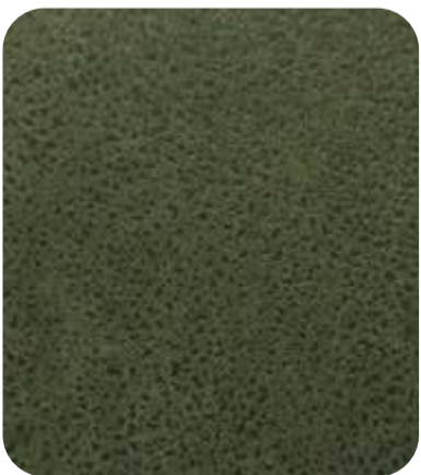
APACHE - 911