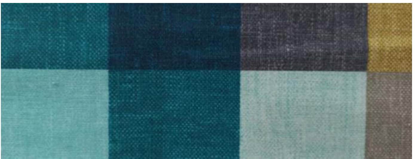
CALIBRI | 304