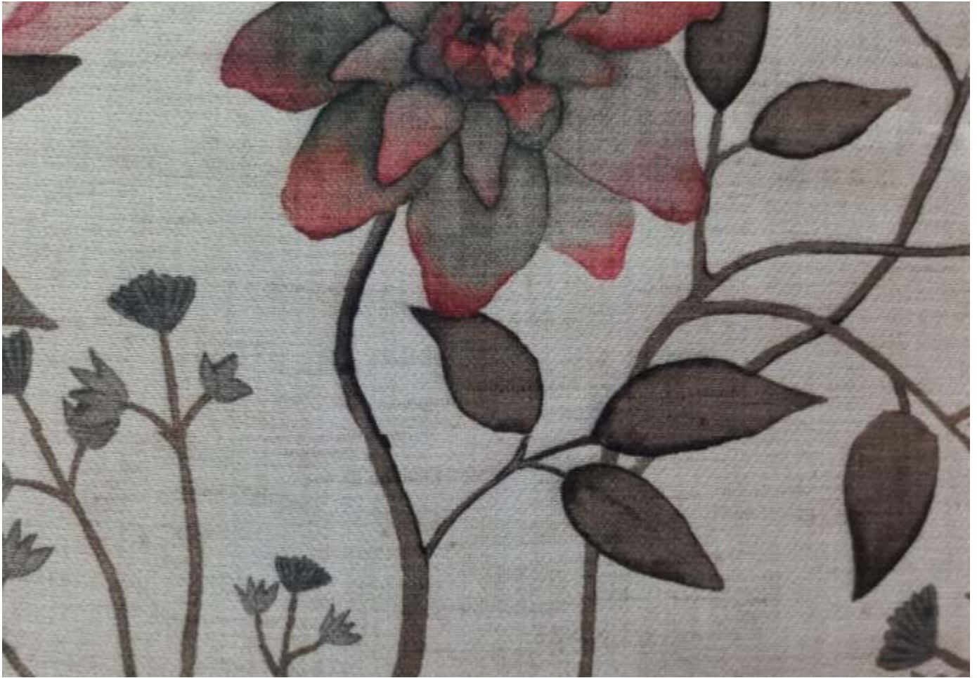
CALIBRI | 202