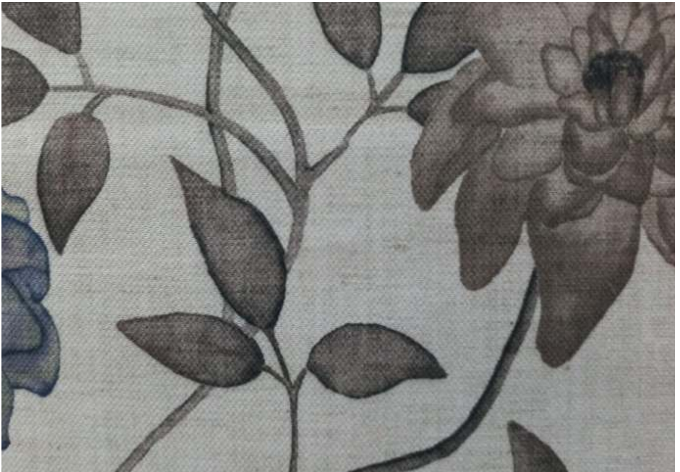
CALIBRI | 203