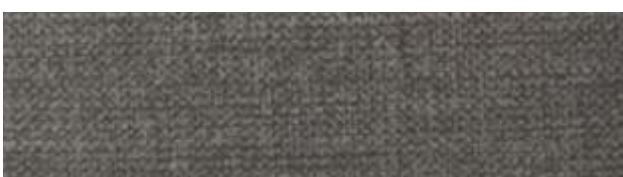
AMBER | 119