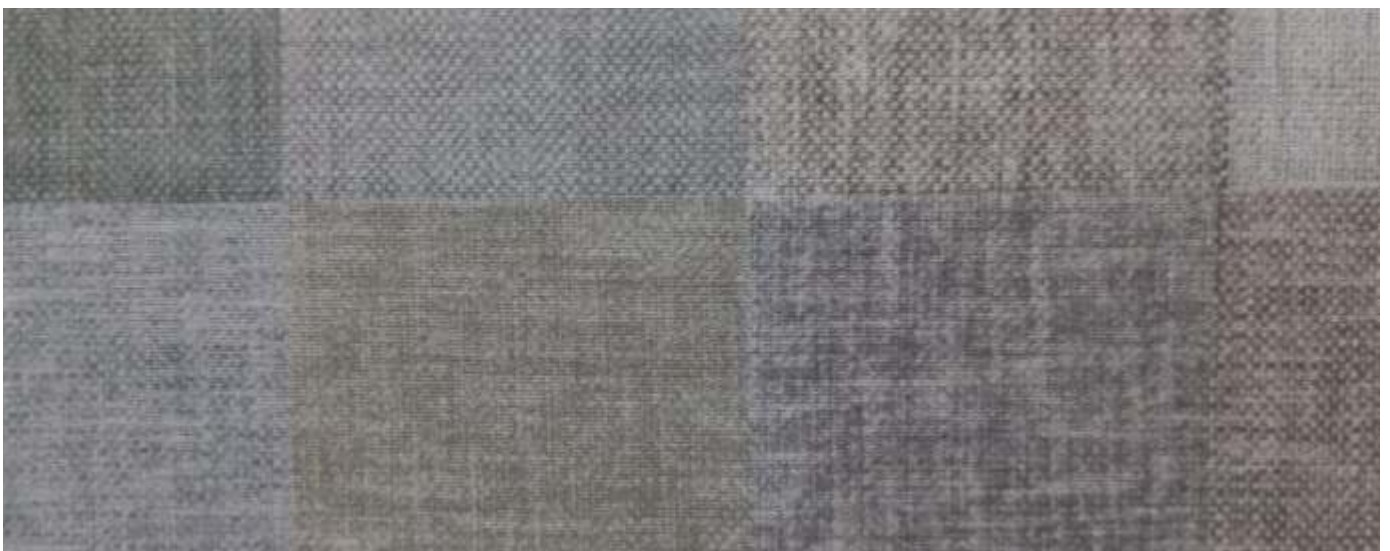
CALIBRI | 301