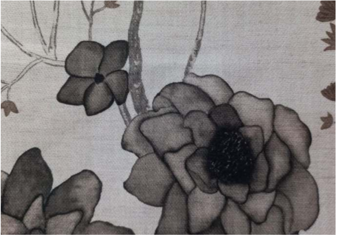
CALIBRI | 201