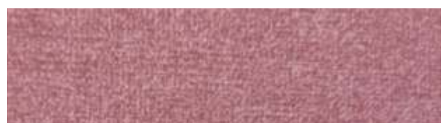
MUSK | 707