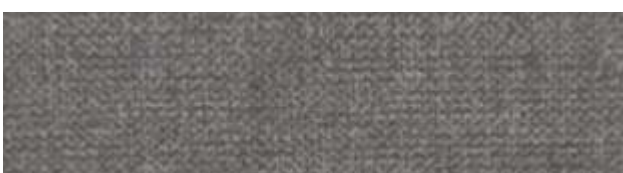
AMBER | 119