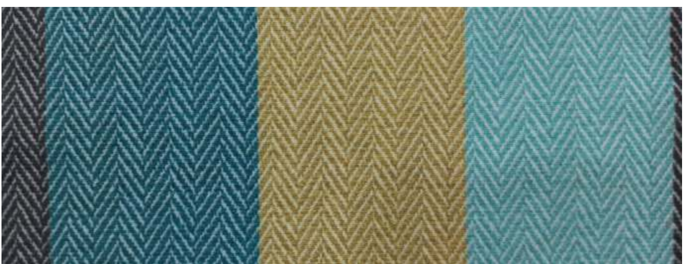
CALIBRI | 104