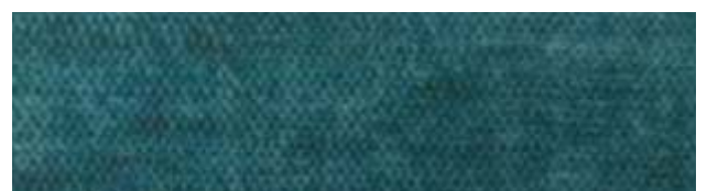
IBIZA | 759