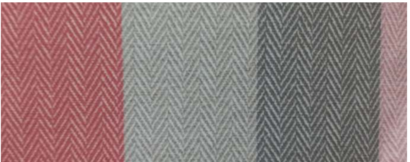
CALIBRI | 102