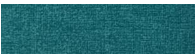
MUSK | 708