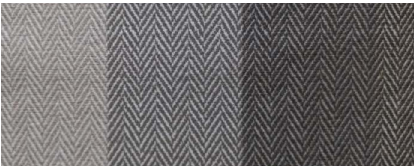
CALIBRI | 101