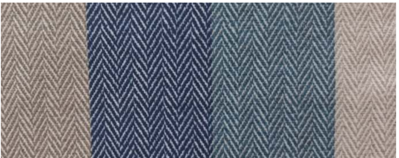
CALIBRI | 103