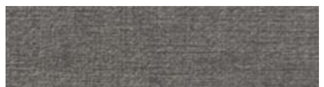
MUSK | 712