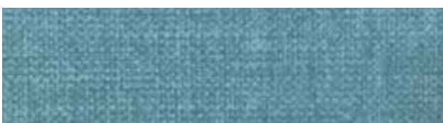
AMBER | 110