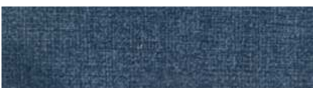
MUSK | 711