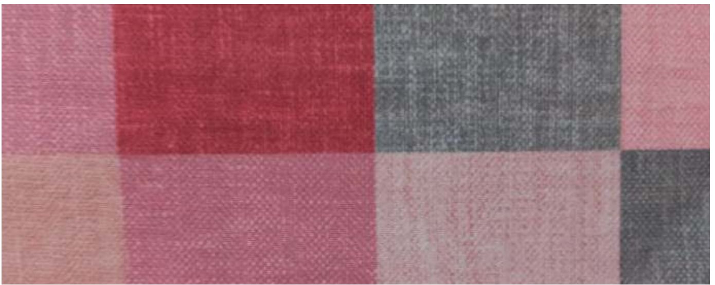
CALIBRI | 302