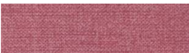
AMBER | 122