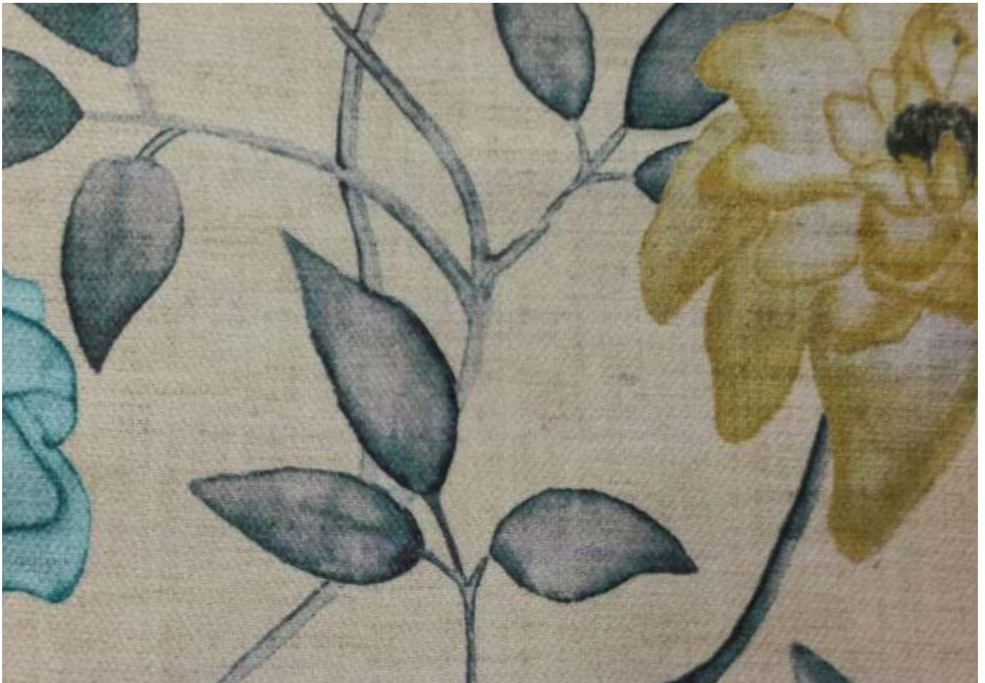
CALIBRI | 204