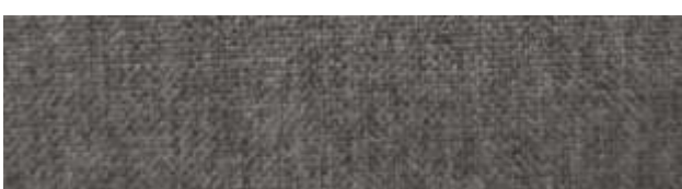
ASABA | 727