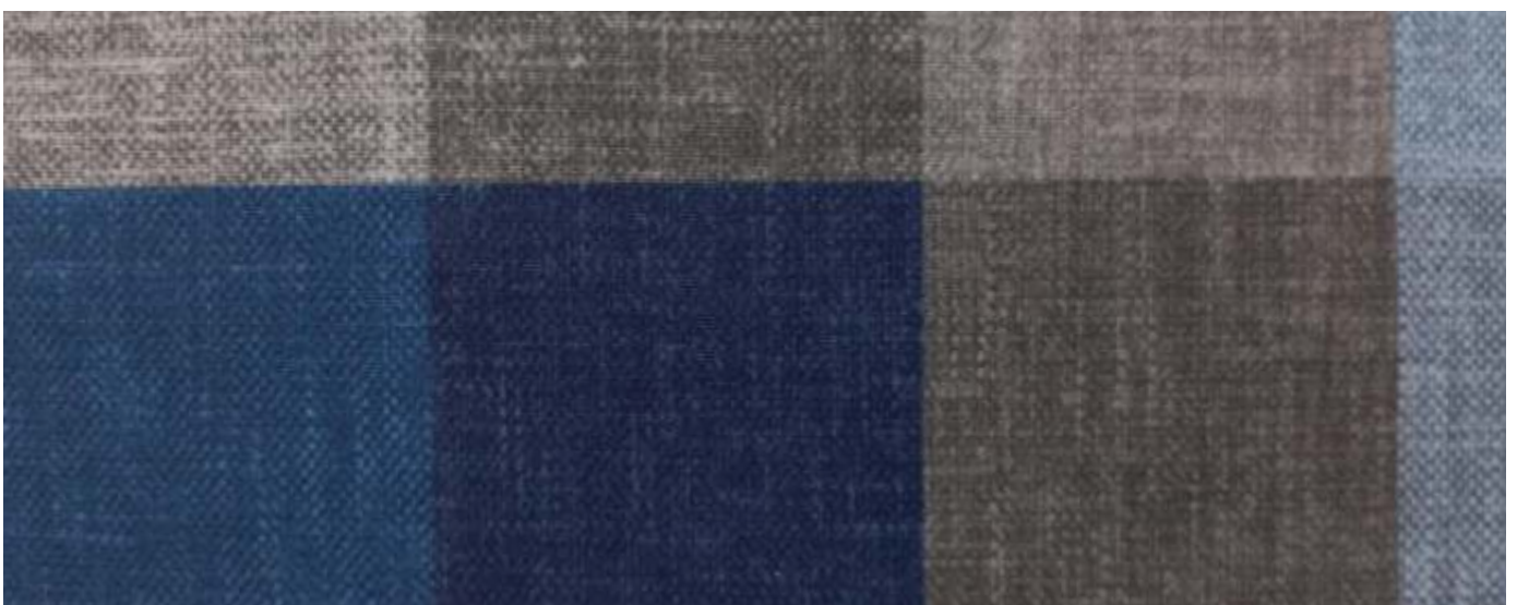
CALIBRI | 303